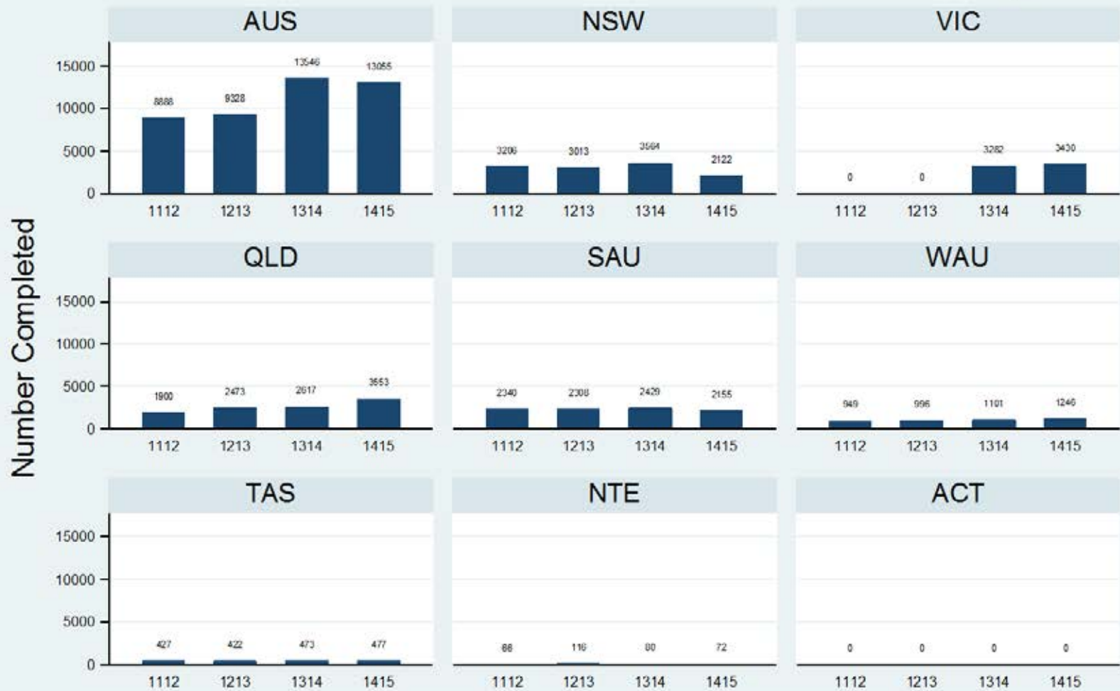
Figure 1.3.3.7.V: Child & Adolescent - Ambulatory - Discharge - Diagnosis

Data Extract - 06 March 2016; Analysis & Reporting - 12 March 2016