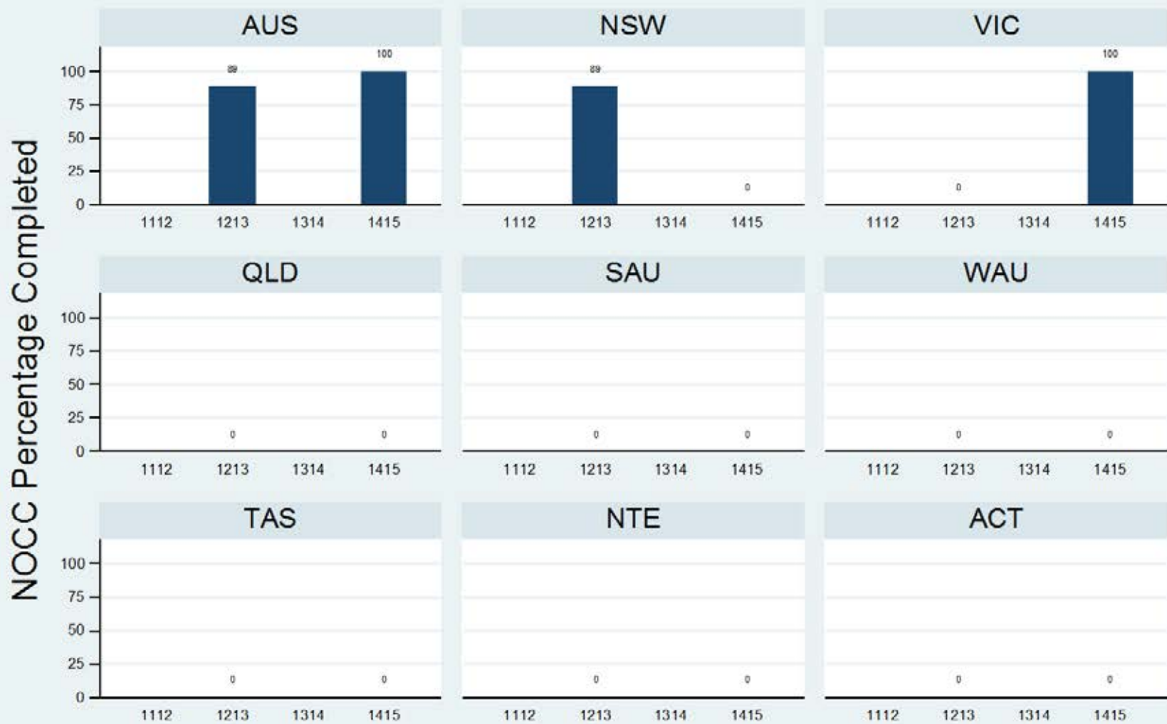
Figure 1.2.2.7.C: Child & Adolescent - Residential - Review - Diagnosis

Data Extract - 06 March 2016; Analysis & Reporting - 12 March 2016