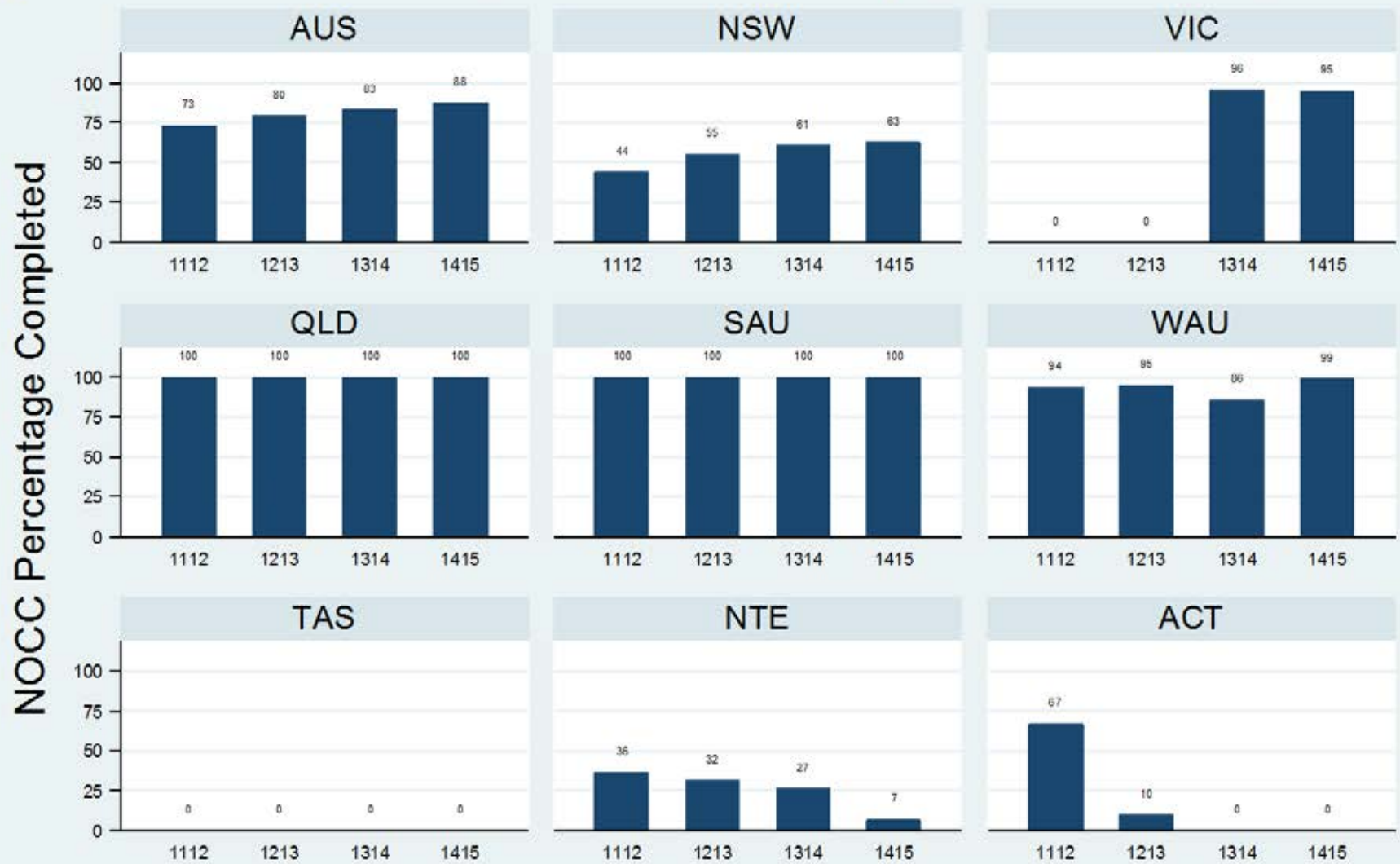
Figure 1.1.1.2.C: Child & Adolescent - Inpatient - Admission - CGAS

Data Extract - 06 March 2016; Analysis & Reporting - 12 March 2016