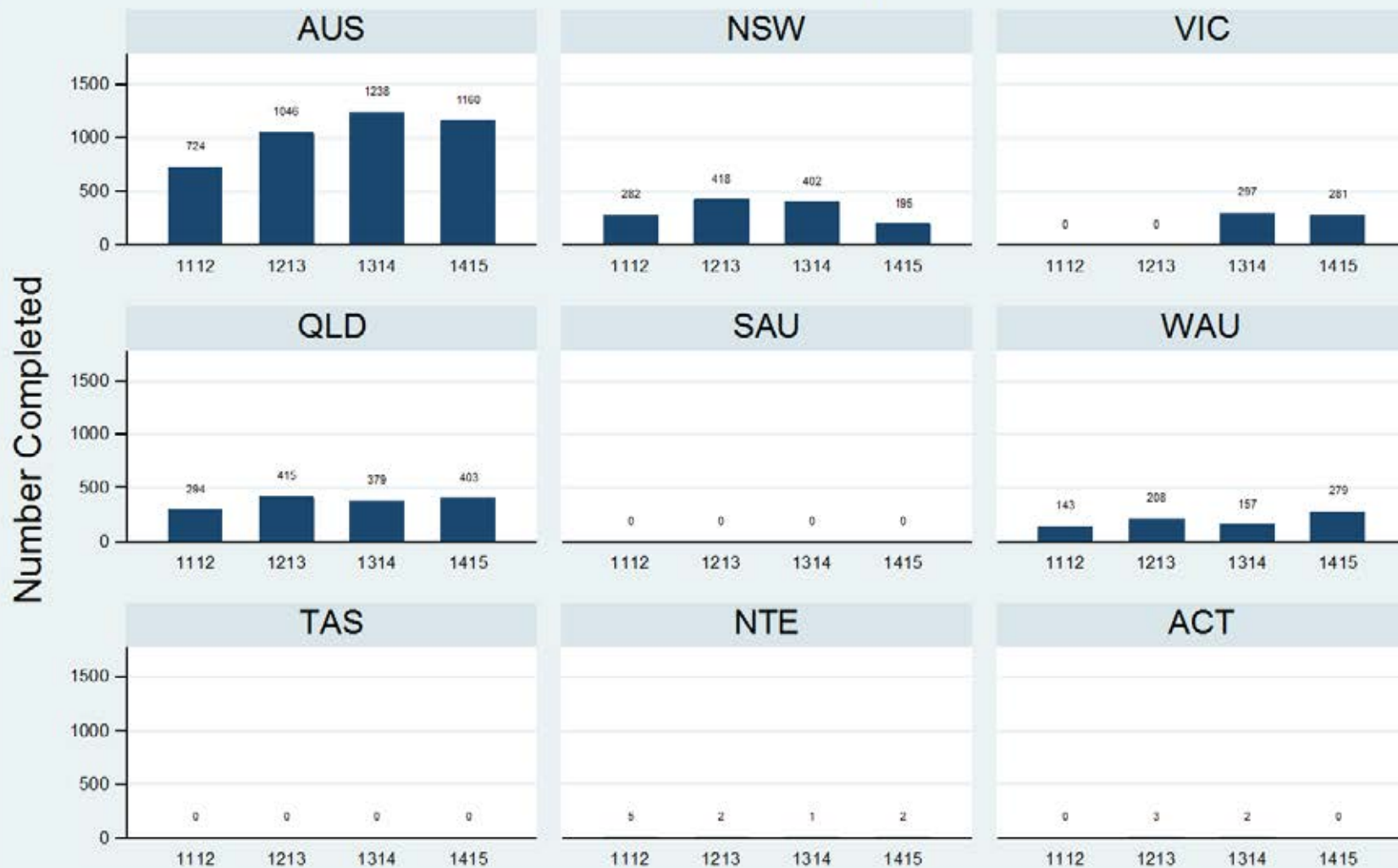
Figure 1.1.1.5.V: Child & Adolescent - Inpatient - Admission - SDQ-PY

Data Extract - 06 March 2016; Analysis & Reporting - 12 March 2016