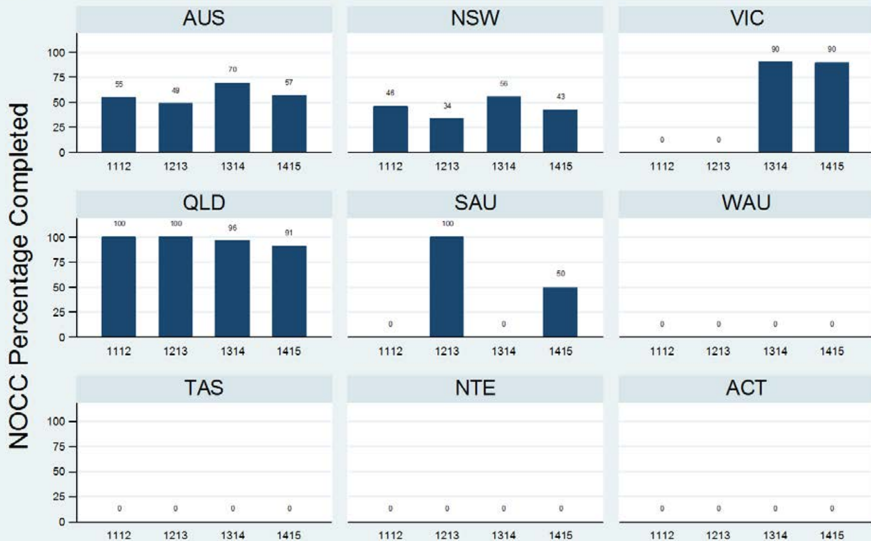
Figure 1.1.2.3.C: Child & Adolescent - Inpatient - Review - FIHS

Data Extract - 06 March 2016; Analysis & Reporting - 12 March 2016