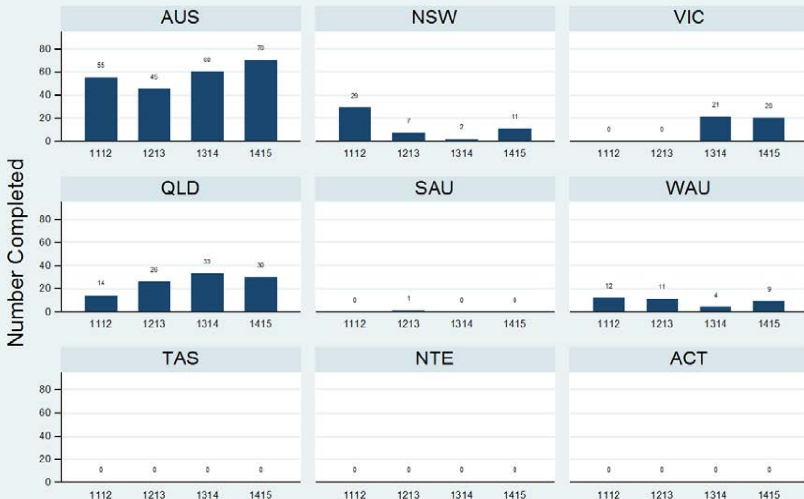
Figure 1.1.1.4.V: Child & Adolescent - Inpatient - Admission - SDQ-PC

Data Extract - 06 March 2016; Analysis & Reporting - 12 March 2016