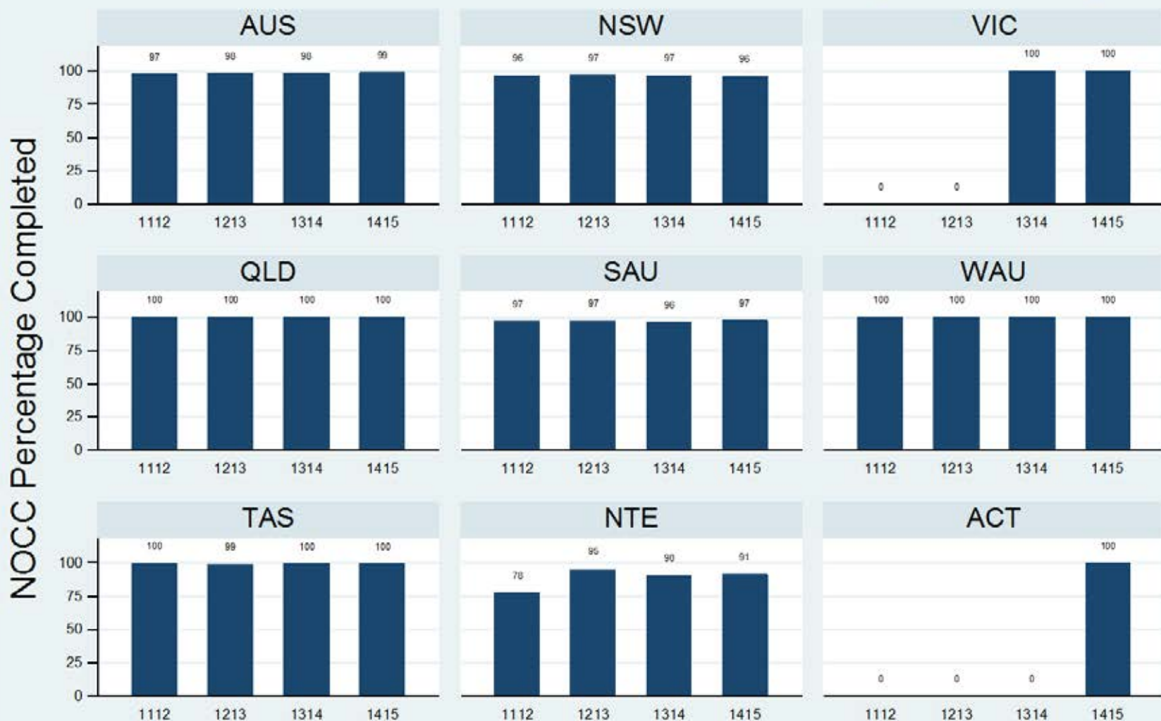
Figure 1.3.3.8.C: Child & Adolescent - Ambulatory - Discharge - MHLS

Data Extract - 06 March 2016; Analysis & Reporting - 12 March 2016