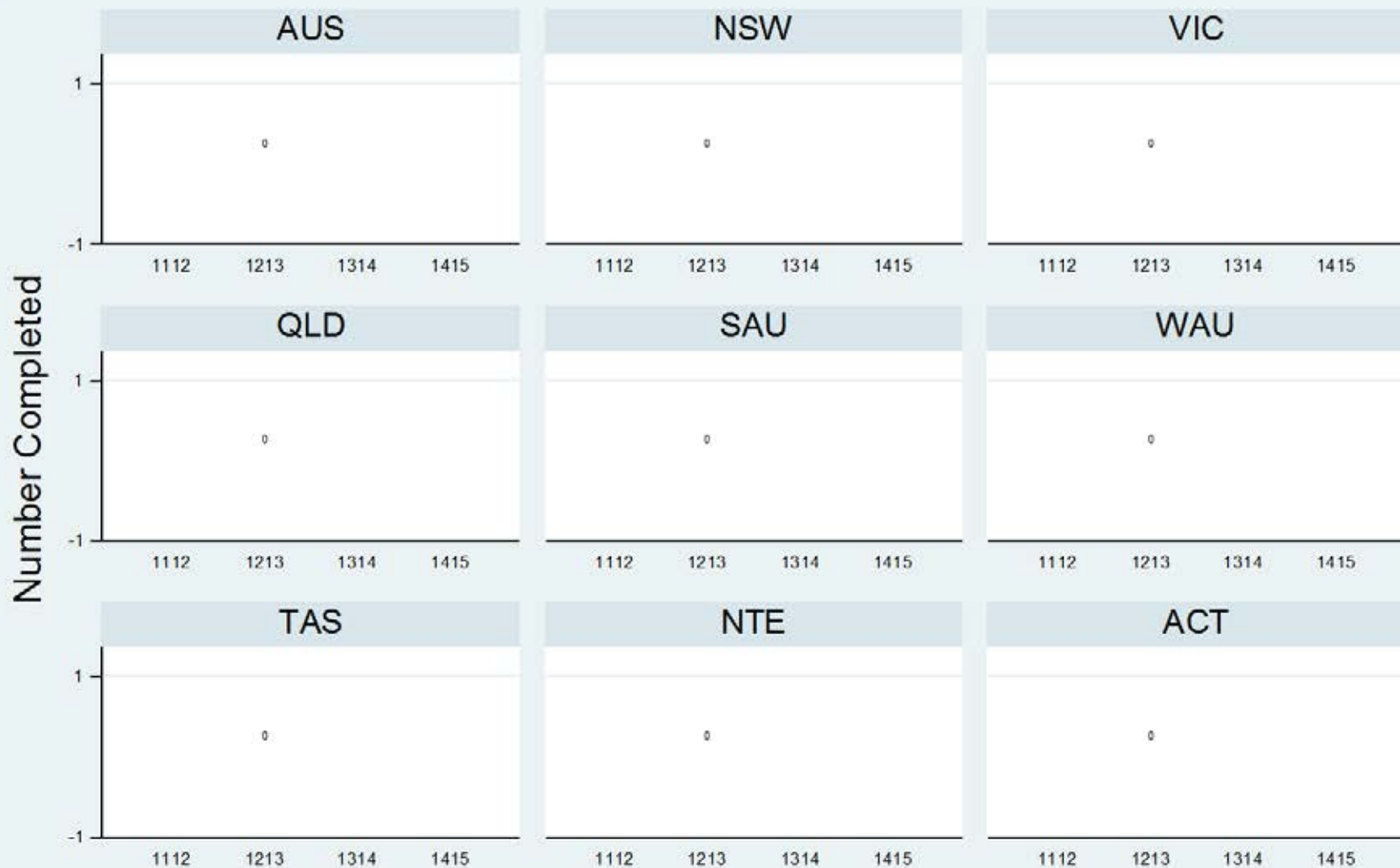
Figure 1.2.2.4.V: Child & Adolescent - Residential - Review - SDQ-PC

Data Extract - 06 March 2016; Analysis & Reporting - 12 March 2016