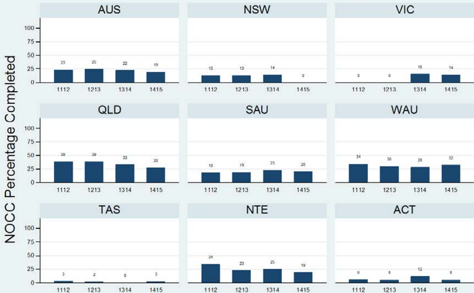
Figure 1.3.2.4.C: Child & Adolescent - Ambulatory - Review - SDQ-PC

Data Extract - 06 March 2016; Analysis & Reporting - 12 March 2016