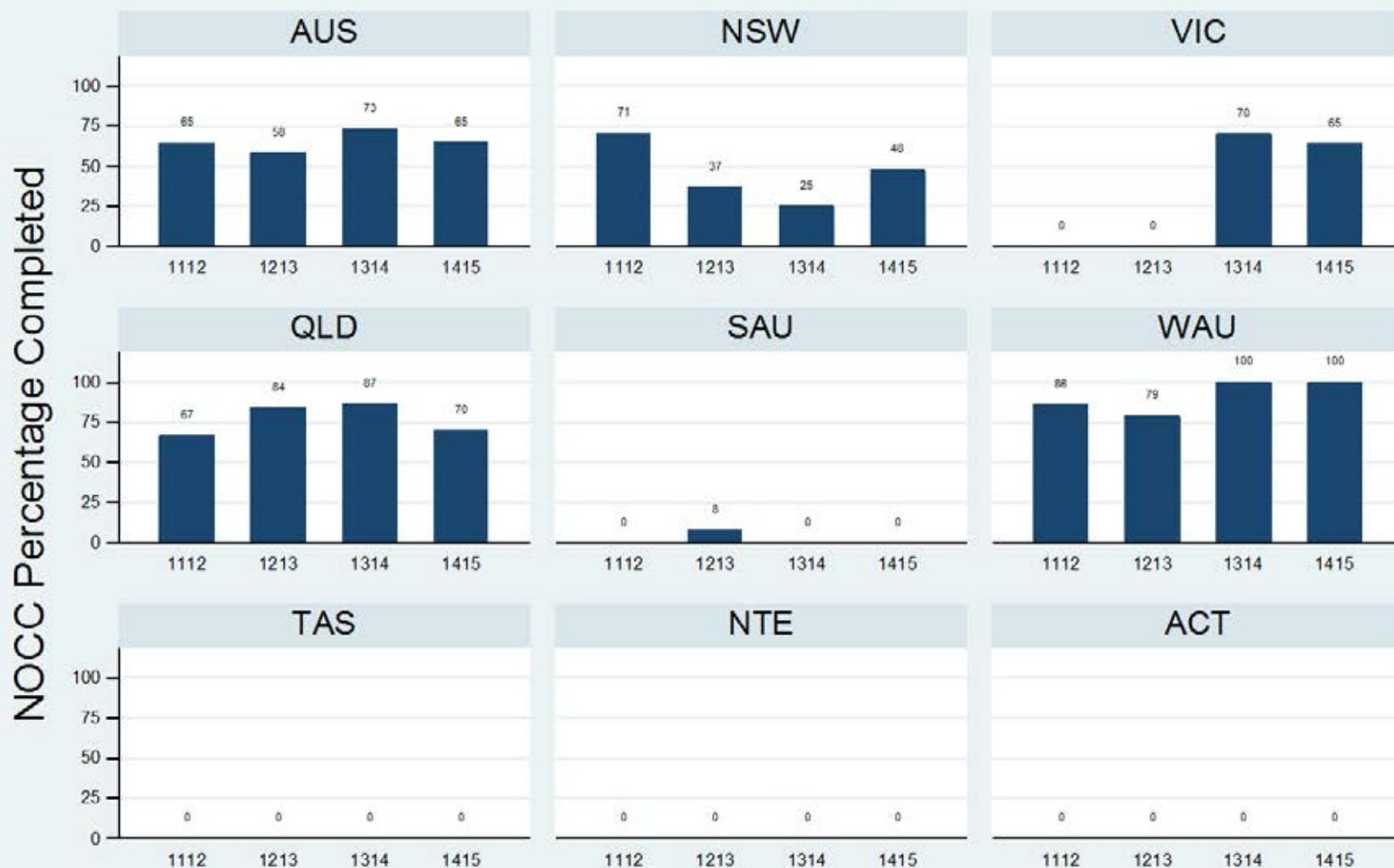
Figure 1.1.1.4.C: Child & Adolescent - Inpatient - Admission - SDQ-PC

Data Extract - 06 March 2016; Analysis & Reporting - 12 March 2016