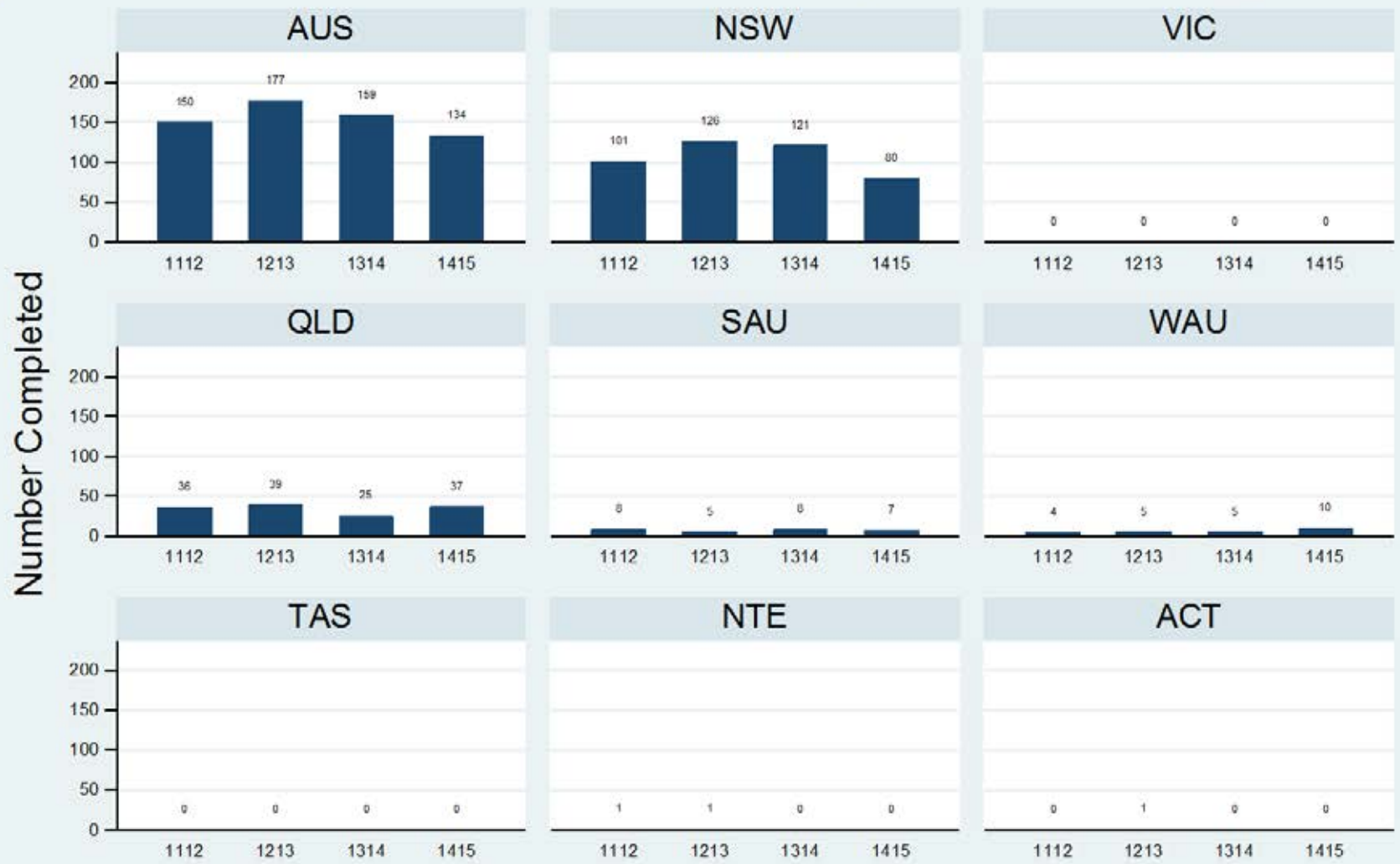
Figure 1.1.3.6.V: Child & Adolescent - Inpatient - Discharge - SDQ-YR

Data Extract - 06 March 2016; Analysis & Reporting - 12 March 2016