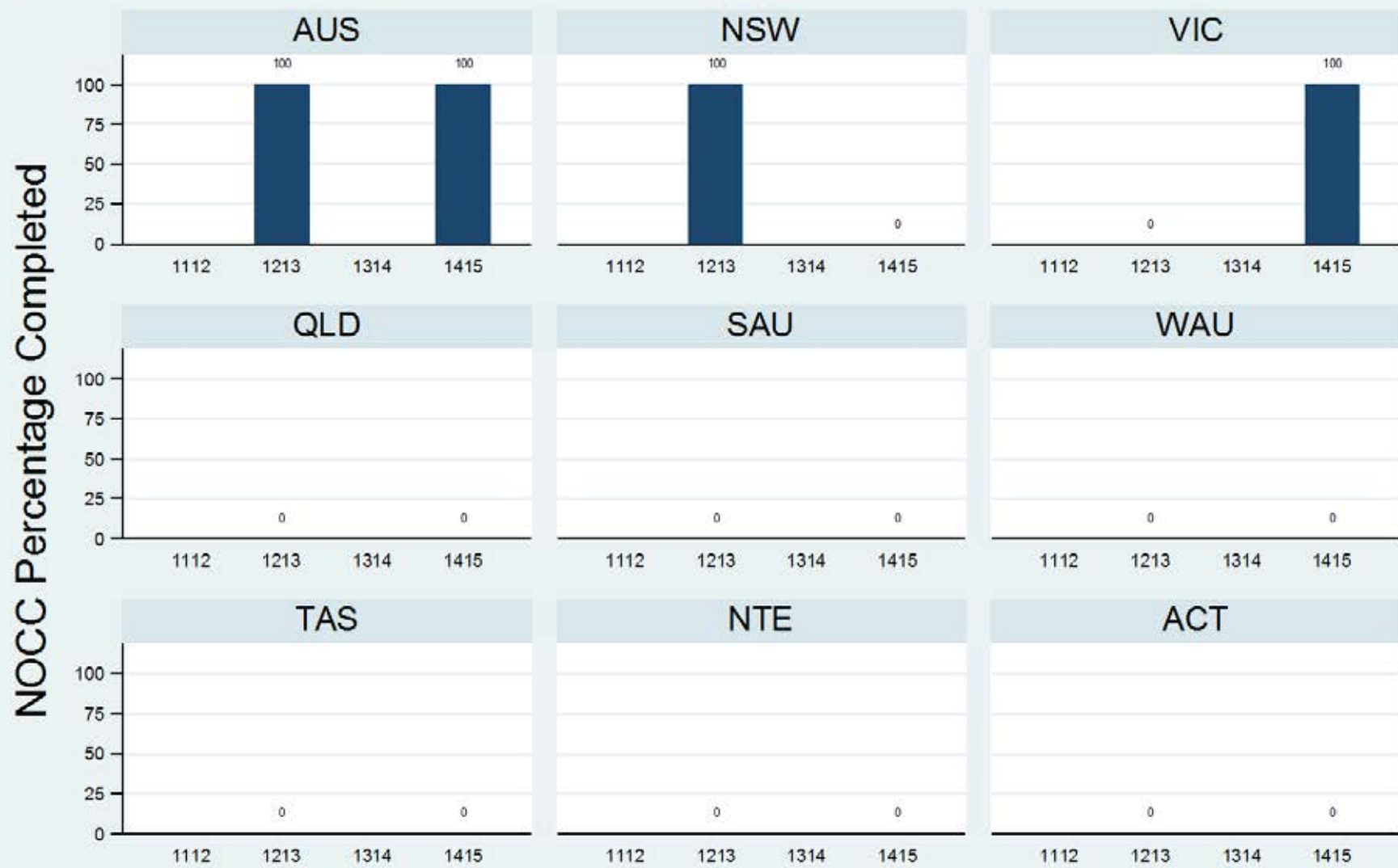
Figure 1.2.2.8.C: Child & Adolescent - Residential - Review - MHLS

Data Extract - 06 March 2016; Analysis & Reporting - 12 March 2016