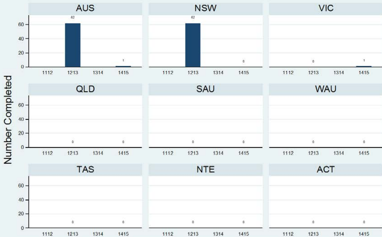
Figure 1.2.2.1.V: Child & Adolescent - Residential - Review - HoNOSCA

Data Extract - 06 March 2016; Analysis & Reporting - 12 March 2016