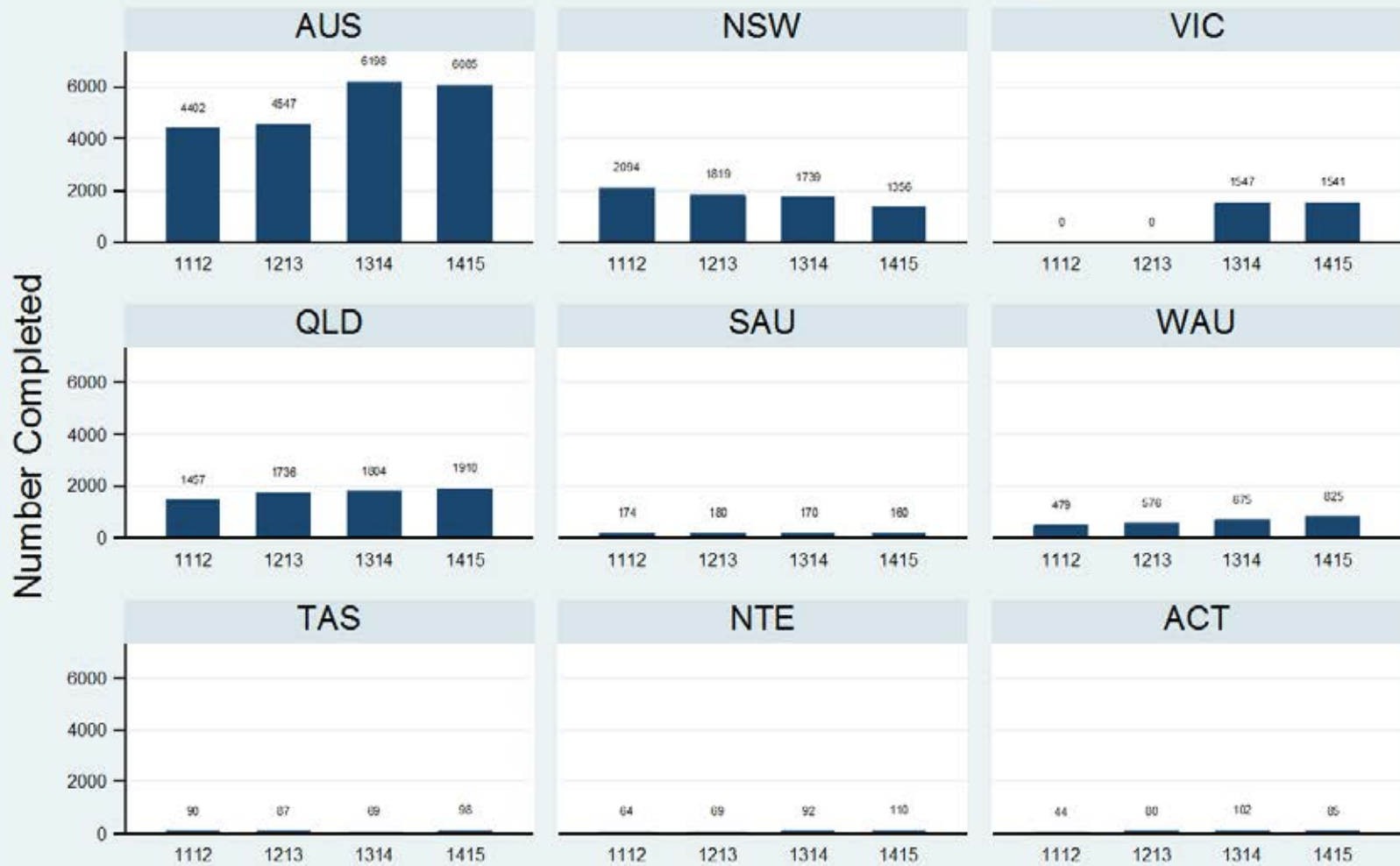
Figure 1.3.1.5.V: Child & Adolescent - Ambulatory - Admission - SDQ-PY

Data Extract - 06 March 2016; Analysis & Reporting - 12 March 2016