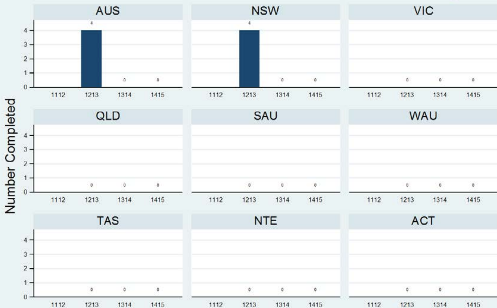
Figure 1.2.3.6.V: Child & Adolescent - Residential - Discharge - SDQ-YR

Data Extract - 06 March 2016; Analysis & Reporting - 12 March 2016