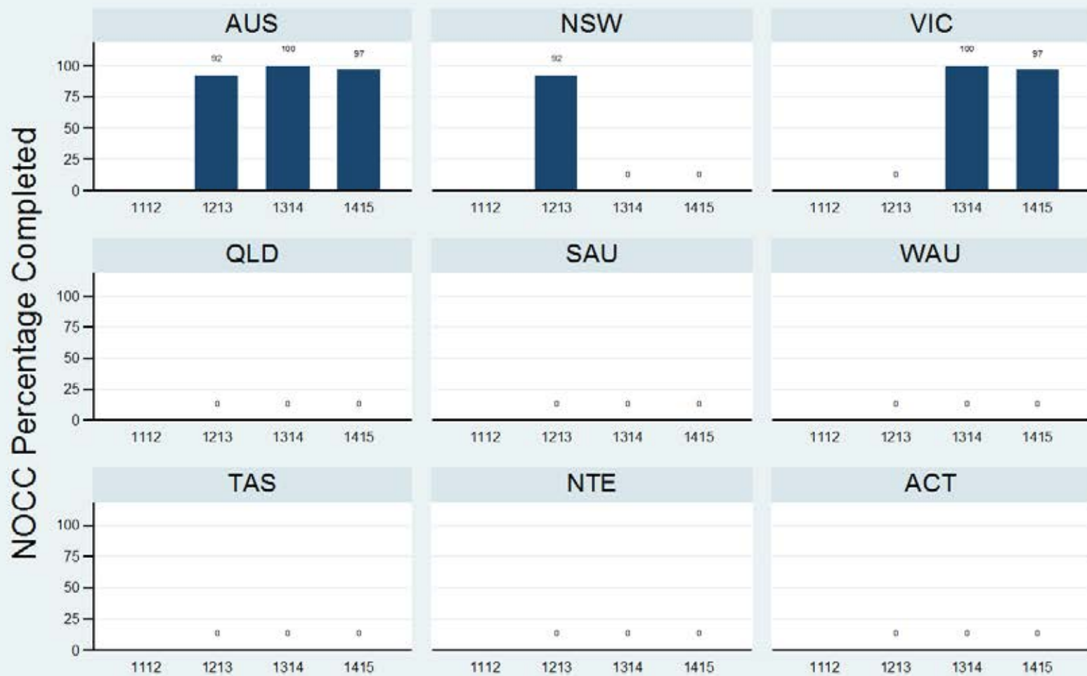
Figure 1.2.1.1.C: Child & Adolescent - Residential - Admission - HoNOSCA

Data Extract - 06 March 2016; Analysis & Reporting - 12 March 2016