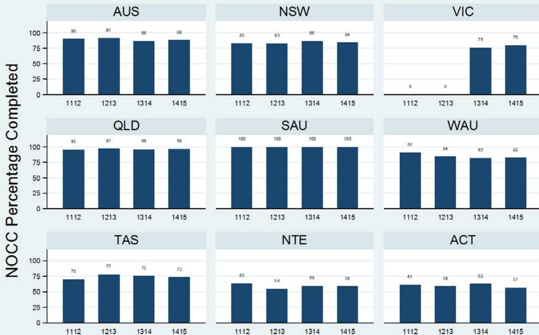
Figure 1.3.2.2.C: Child & Adolescent - Ambulatory - Review - CGAS

Data Extract - 06 March 2016; Analysis & Reporting - 12 March 2016