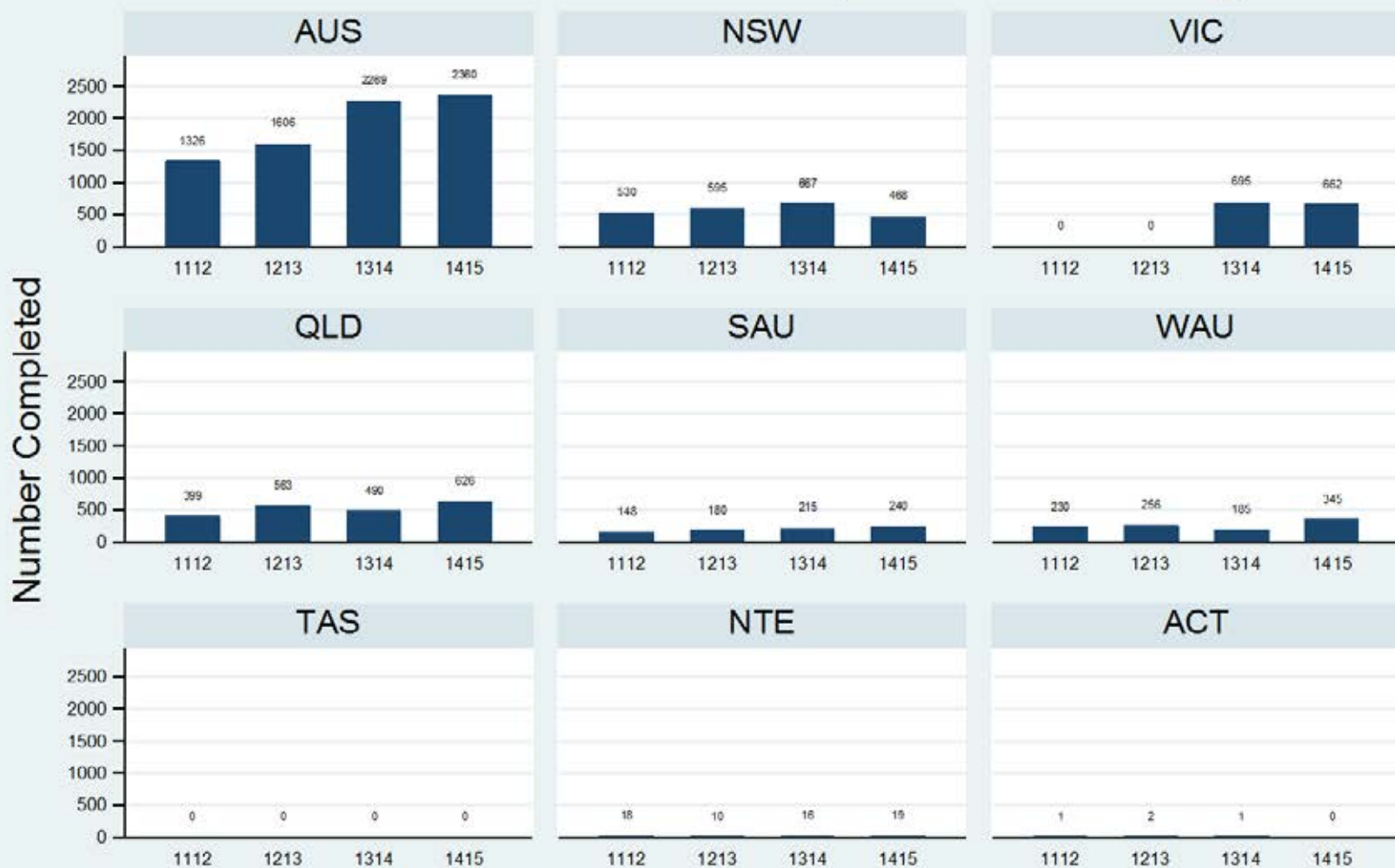
Figure 1.1.3.1.V: Child & Adolescent - Inpatient - Discharge - HoNOSCA

Data Extract - 06 March 2016; Analysis & Reporting - 12 March 2016