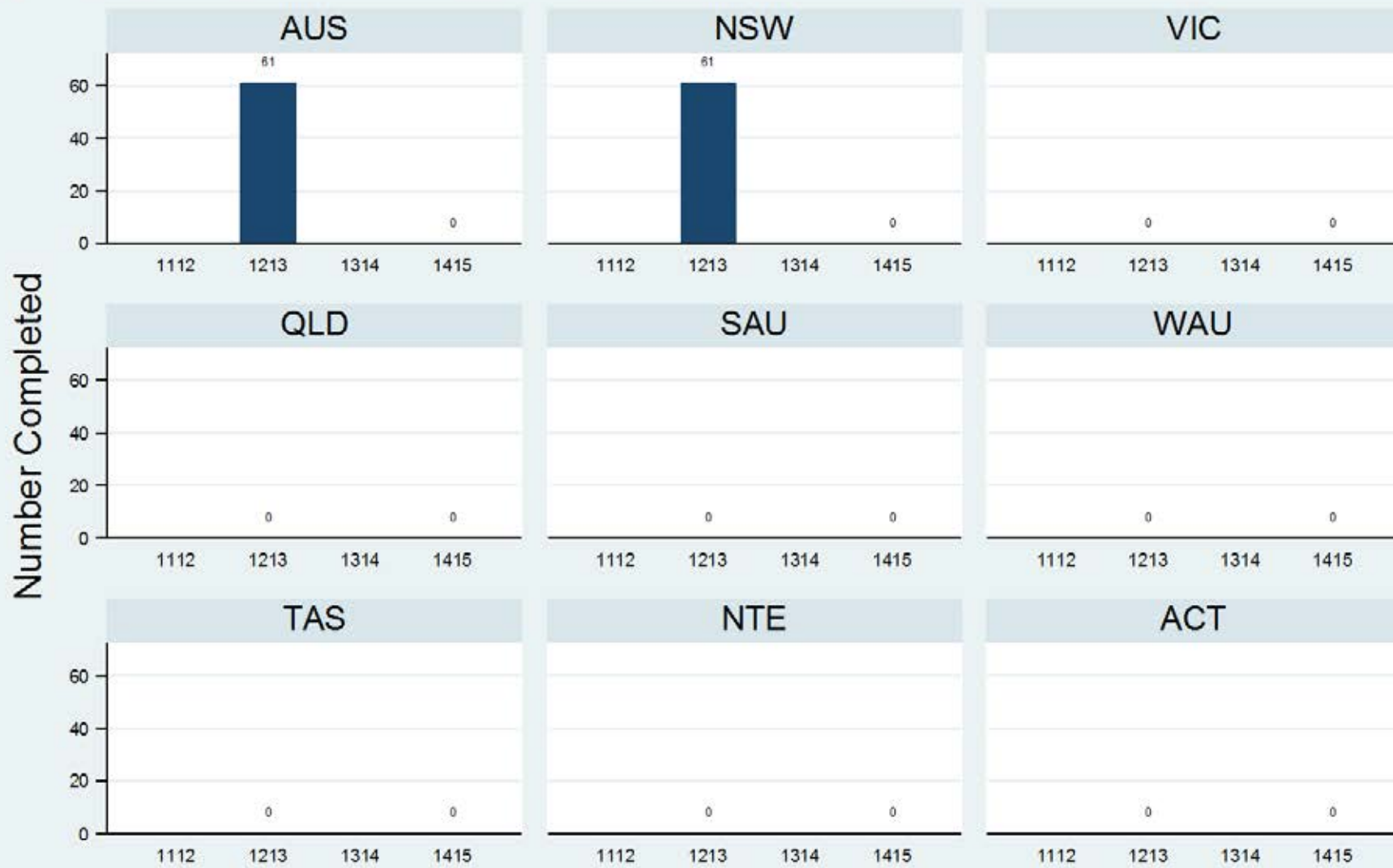
Figure 1.2.2.2.V: Child & Adolescent - Residential - Review - CGAS

Data Extract - 06 March 2016; Analysis & Reporting - 12 March 2016