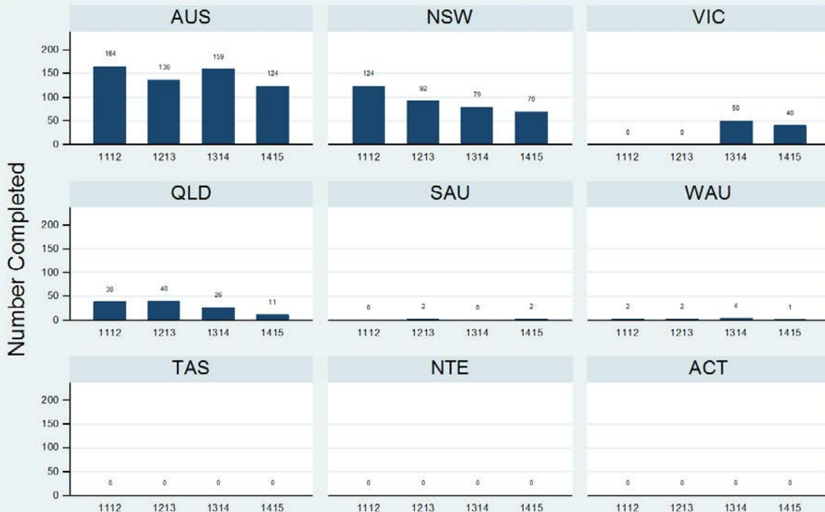
Figure 1.1.2.7.V: Child & Adolescent - Inpatient - Review - Diagnosis

Data Extract - 06 March 2016; Analysis & Reporting - 12 March 2016