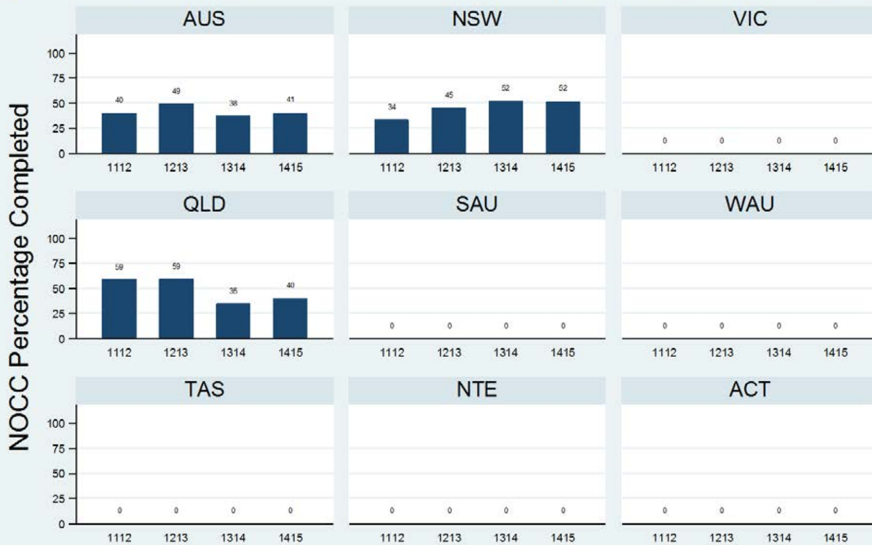
Figure 1.1.2.6.C: Child & Adolescent - Inpatient - Review - SDQ-YR

Data Extract - 06 March 2016; Analysis & Reporting - 12 March 2016