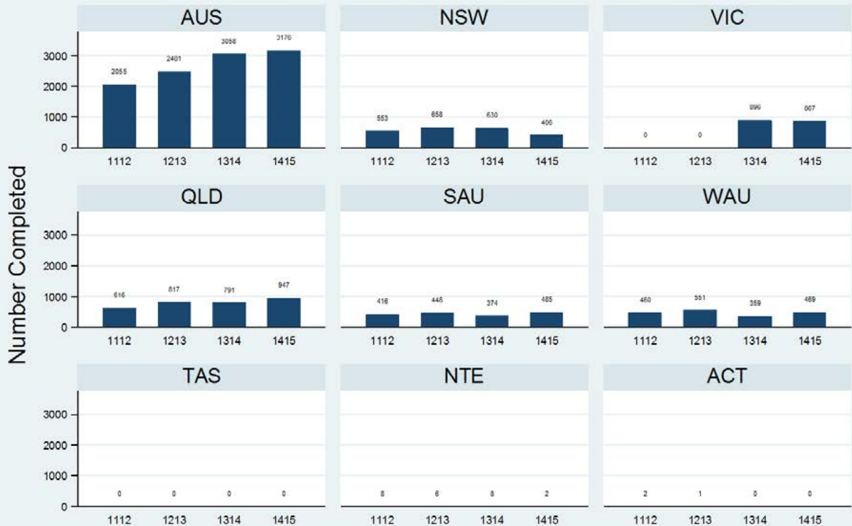
Figure 1.1.1.2.V: Child & Adolescent - Inpatient - Admission - CGAS

Data Extract - 06 March 2016; Analysis & Reporting - 12 March 2016