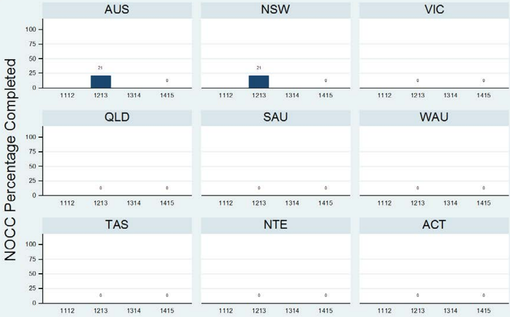
Figure 1.2.2.5.C: Child & Adolescent - Residential - Review - SDQ-PY

Data Extract - 06 March 2016; Analysis & Reporting - 12 March 2016