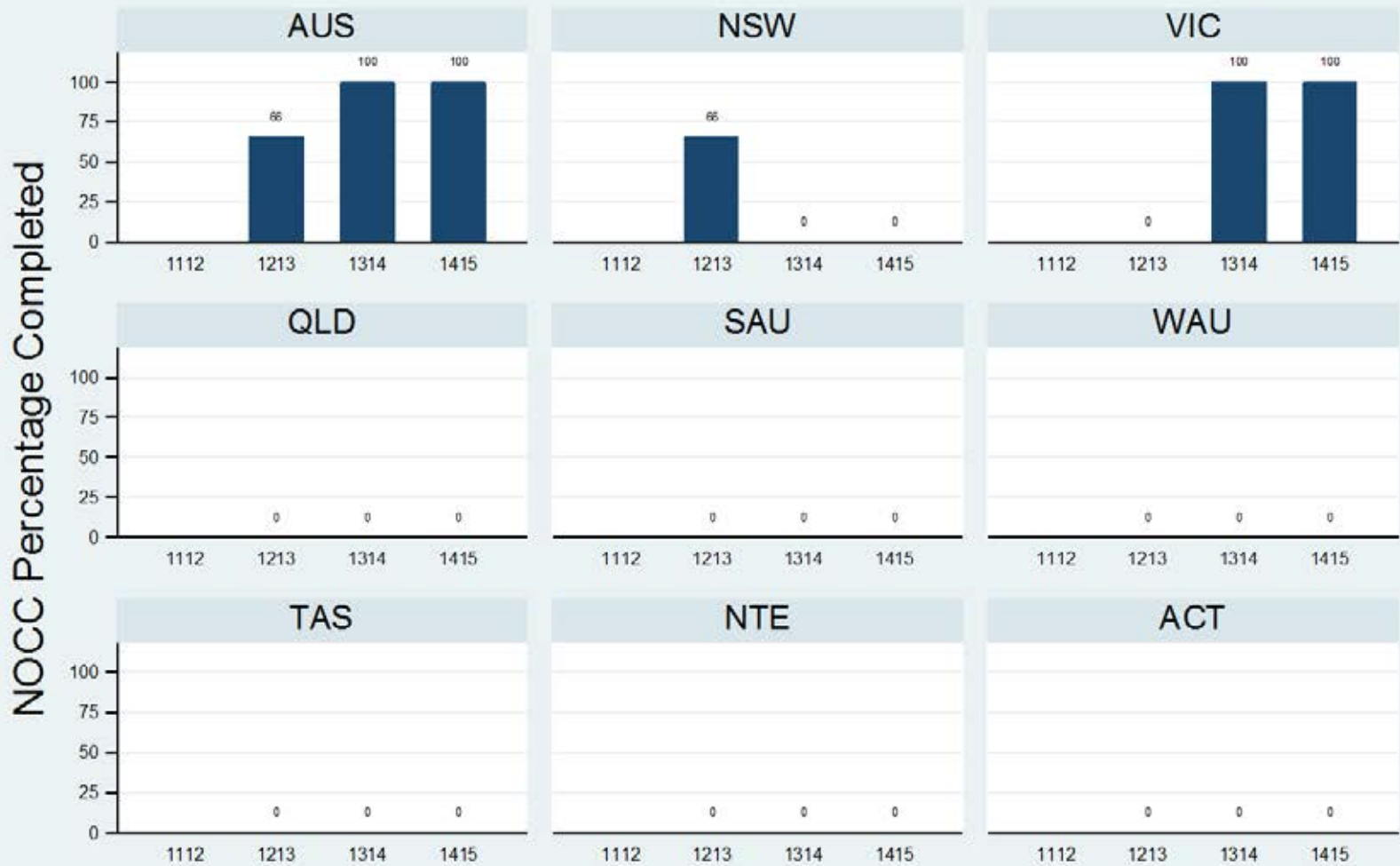
Figure 1.2.3.7.C: Child & Adolescent - Residential - Discharge - Diagnosis

Data Extract - 06 March 2016; Analysis & Reporting - 12 March 2016