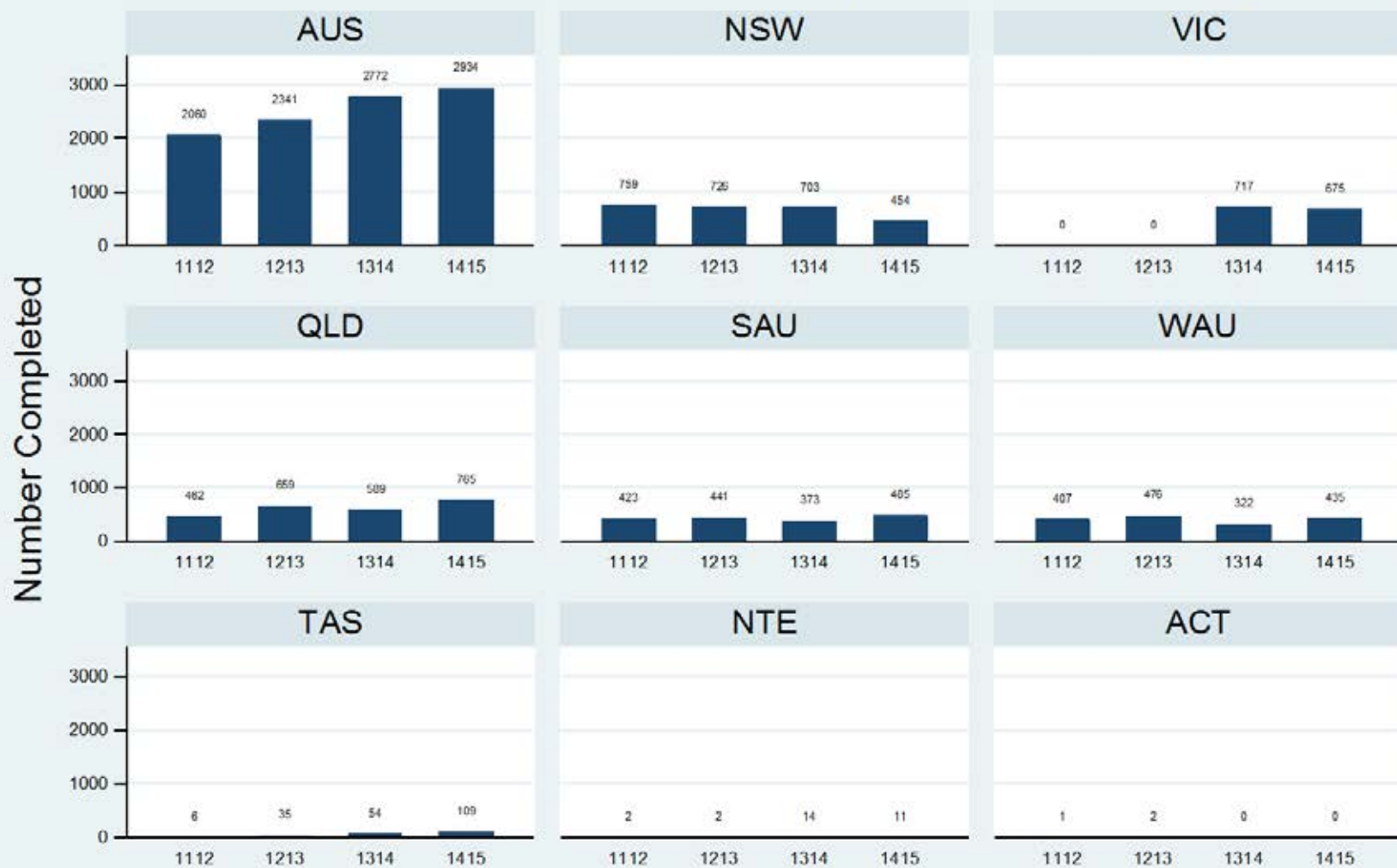
Figure 1.1.3.7.V: Child & Adolescent - Inpatient - Discharge - Diagnosis

Data Extract - 06 March 2016; Analysis & Reporting - 12 March 2016