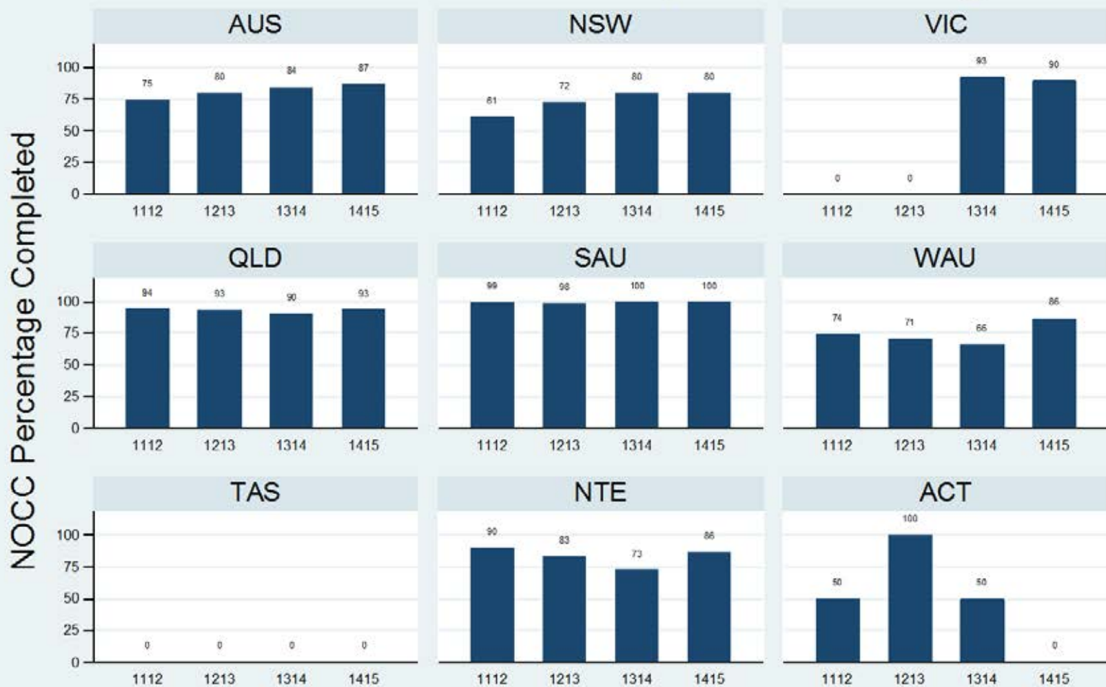
Figure 1.1.3.1.C: Child & Adolescent - Inpatient - Discharge - HoNOSCA

Data Extract - 06 March 2016; Analysis & Reporting - 12 March 2016