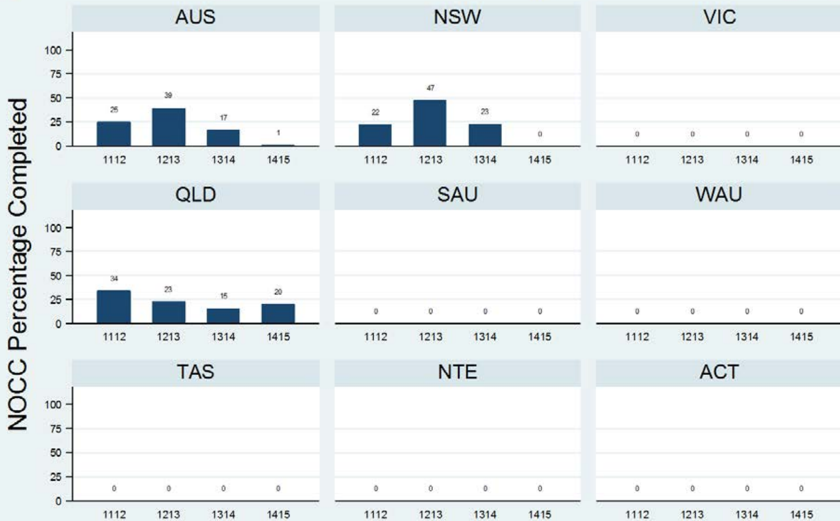
Figure 1.1.2.5.C: Child & Adolescent - Inpatient - Review - SDQ-PY

Data Extract - 06 March 2016; Analysis & Reporting - 12 March 2016