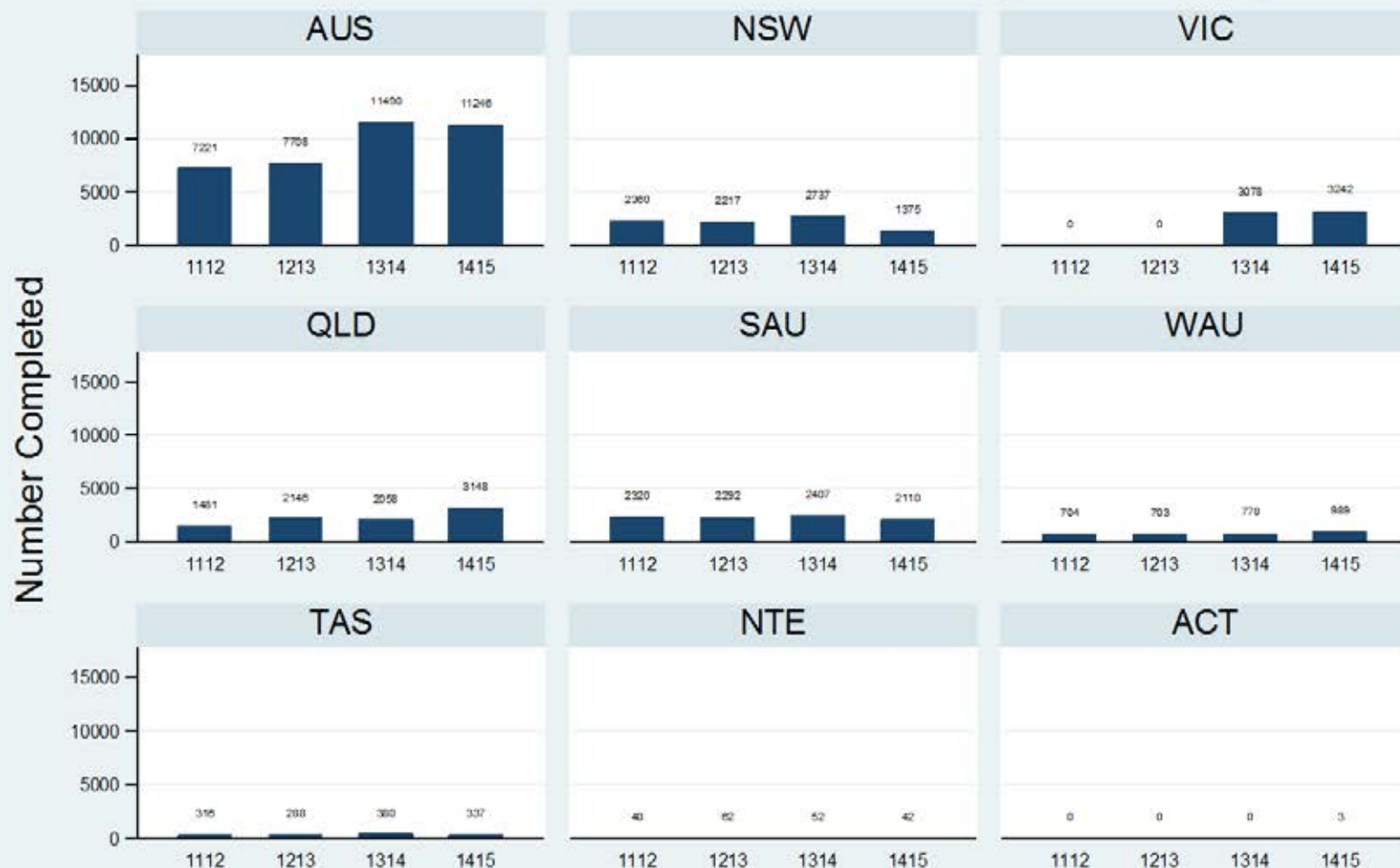
Figure 1.3.3.1.V: Child & Adolescent - Ambulatory - Discharge - HoNOSCA

Data Extract - 06 March 2016; Analysis & Reporting - 12 March 2016