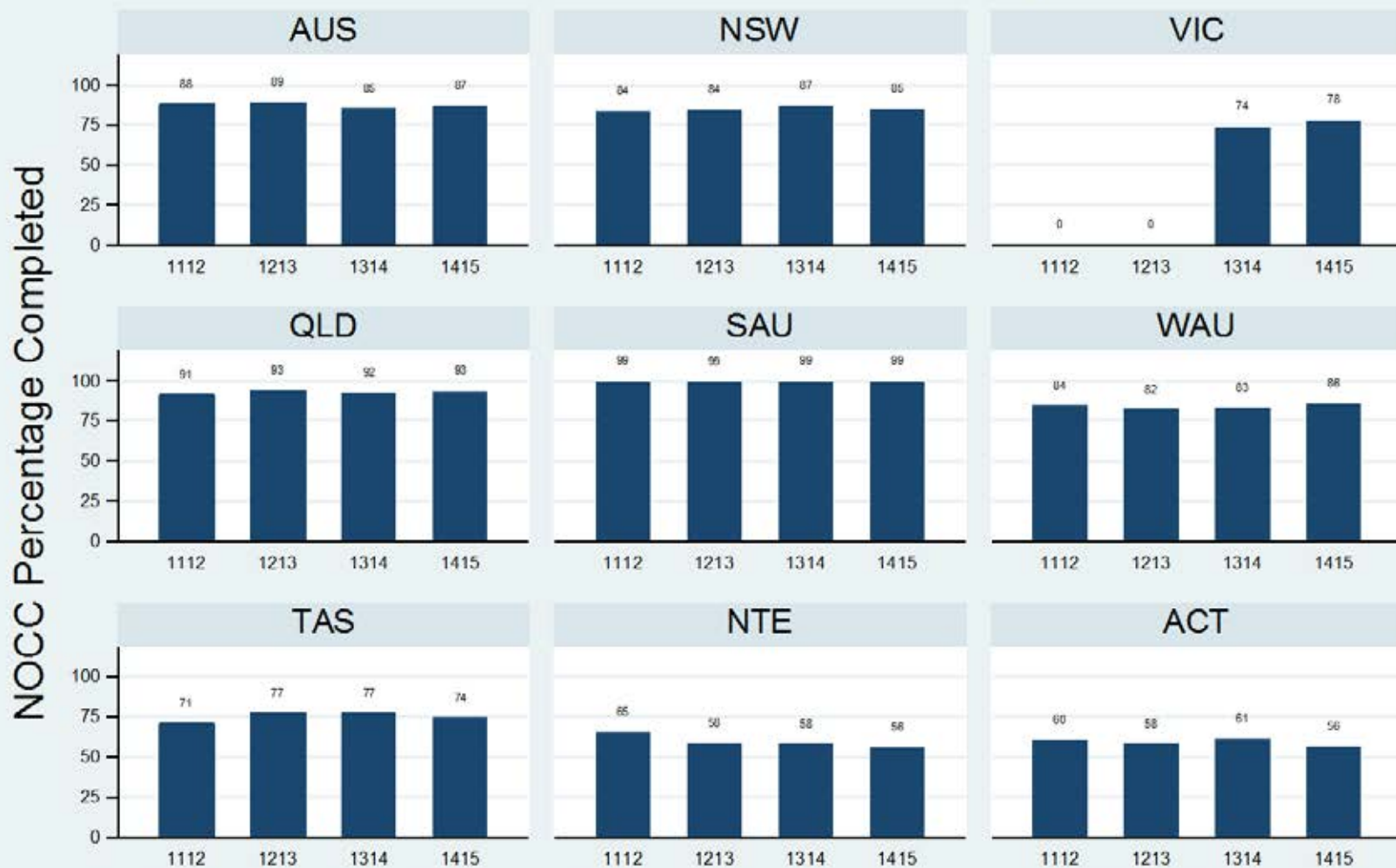
Figure 1.3.2.1.C: Child & Adolescent - Ambulatory - Review - HoNOSCA

Data Extract - 06 March 2016; Analysis & Reporting - 12 March 2016