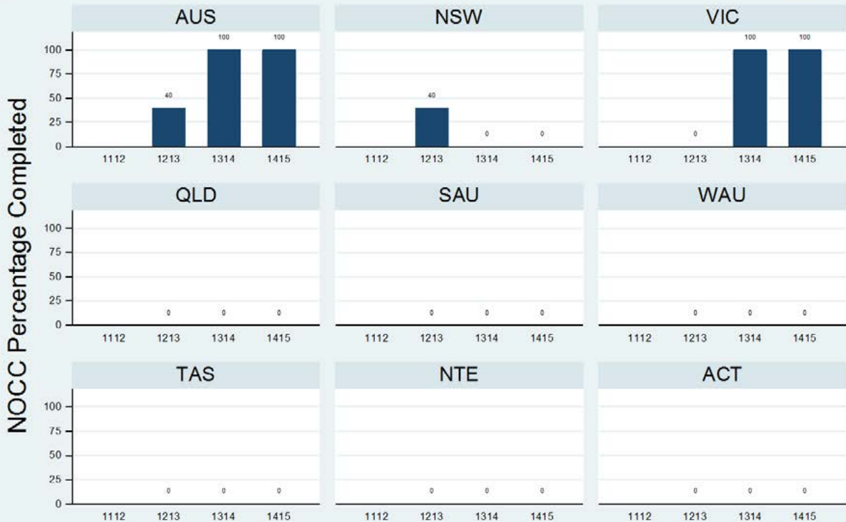
Figure 1.2.3.3.C: Child & Adolescent - Residential - Discharge - FIHS

Data Extract - 06 March 2016; Analysis & Reporting - 12 March 2016