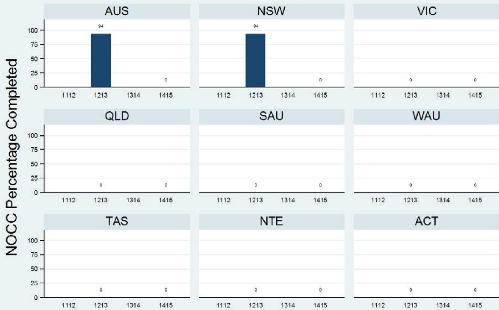
Figure 1.2.2.2.C: Child & Adolescent - Residential - Review - CGAS

Data Extract - 06 March 2016; Analysis & Reporting - 12 March 2016