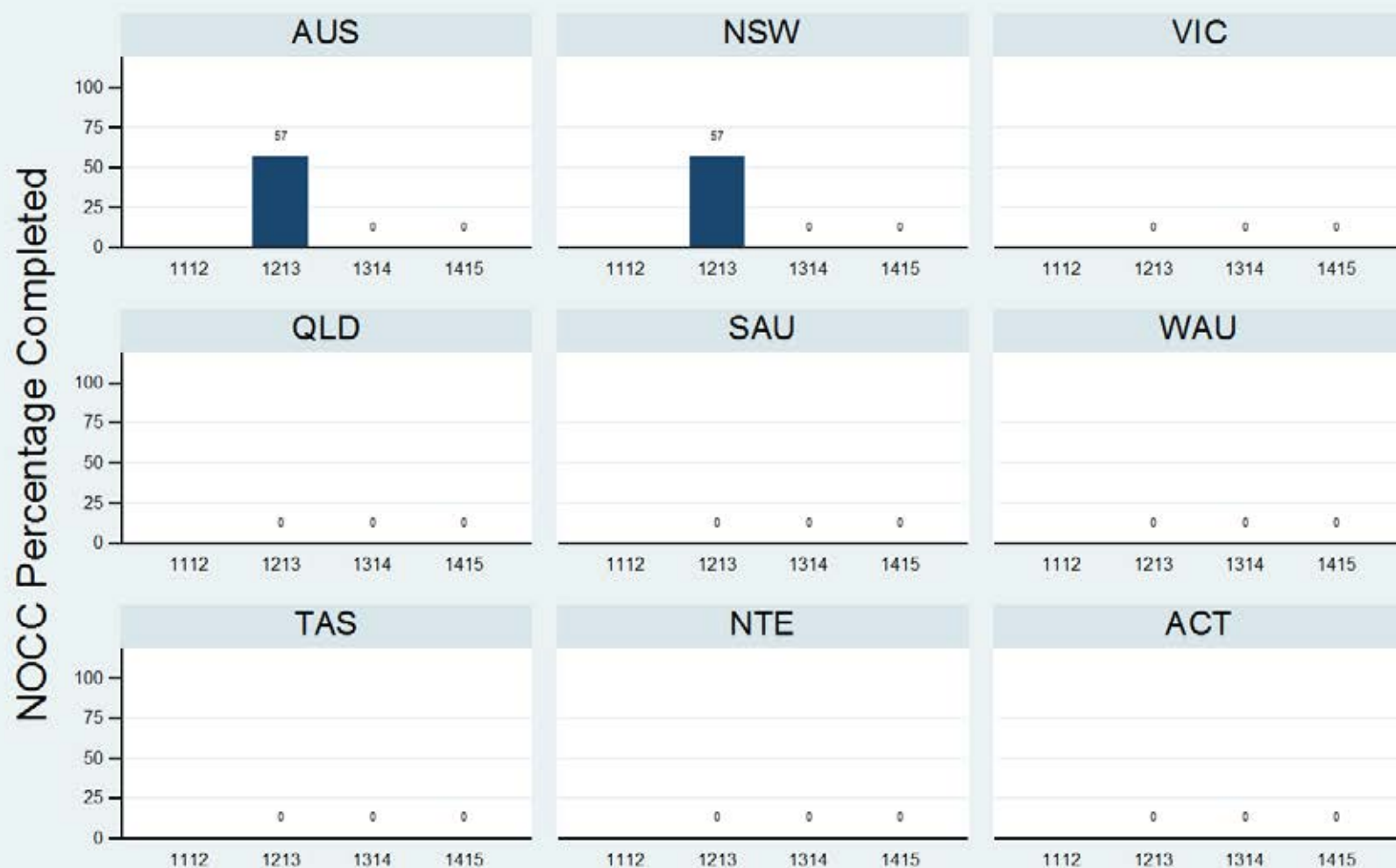
Figure 1.2.1.5.C: Child & Adolescent - Residential - Admission - SDQ-PY

Data Extract - 06 March 2016; Analysis & Reporting - 12 March 2016