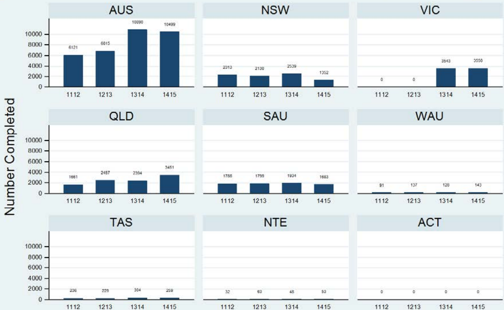
Figure 1.3.3.3.V: Child & Adolescent - Ambulatory - Discharge - FIHS

Data Extract - 06 March 2016; Analysis & Reporting - 12 March 2016