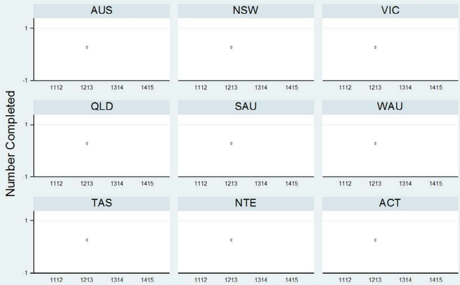
Figure 1.2.3.4.V: Child & Adolescent - Residential - Discharge - SDQ-PC

Data Extract - 06 March 2016; Analysis & Reporting - 12 March 2016