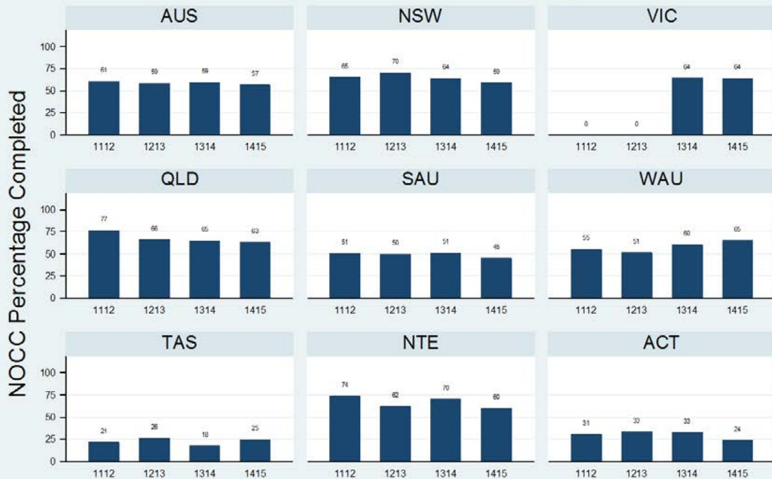
Figure 1.3.1.4.C: Child & Adolescent - Ambulatory - Admission - SDQ-PC

Data Extract - 06 March 2016; Analysis & Reporting - 12 March 2016