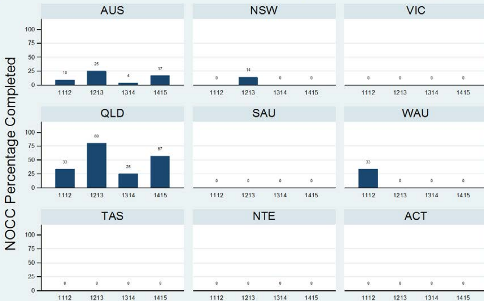
Figure 1.1.3.4.C: Child & Adolescent - Inpatient - Discharge - SDQ-PC

Data Extract - 06 March 2016; Analysis & Reporting - 12 March 2016