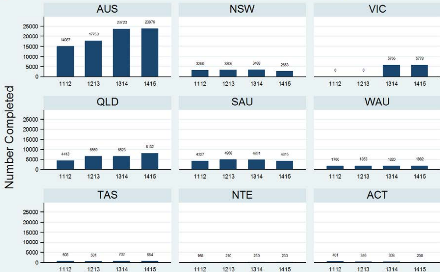
Figure 1.3.2.2.V: Child & Adolescent - Ambulatory - Review - CGAS

Data Extract - 06 March 2016; Analysis & Reporting - 12 March 2016