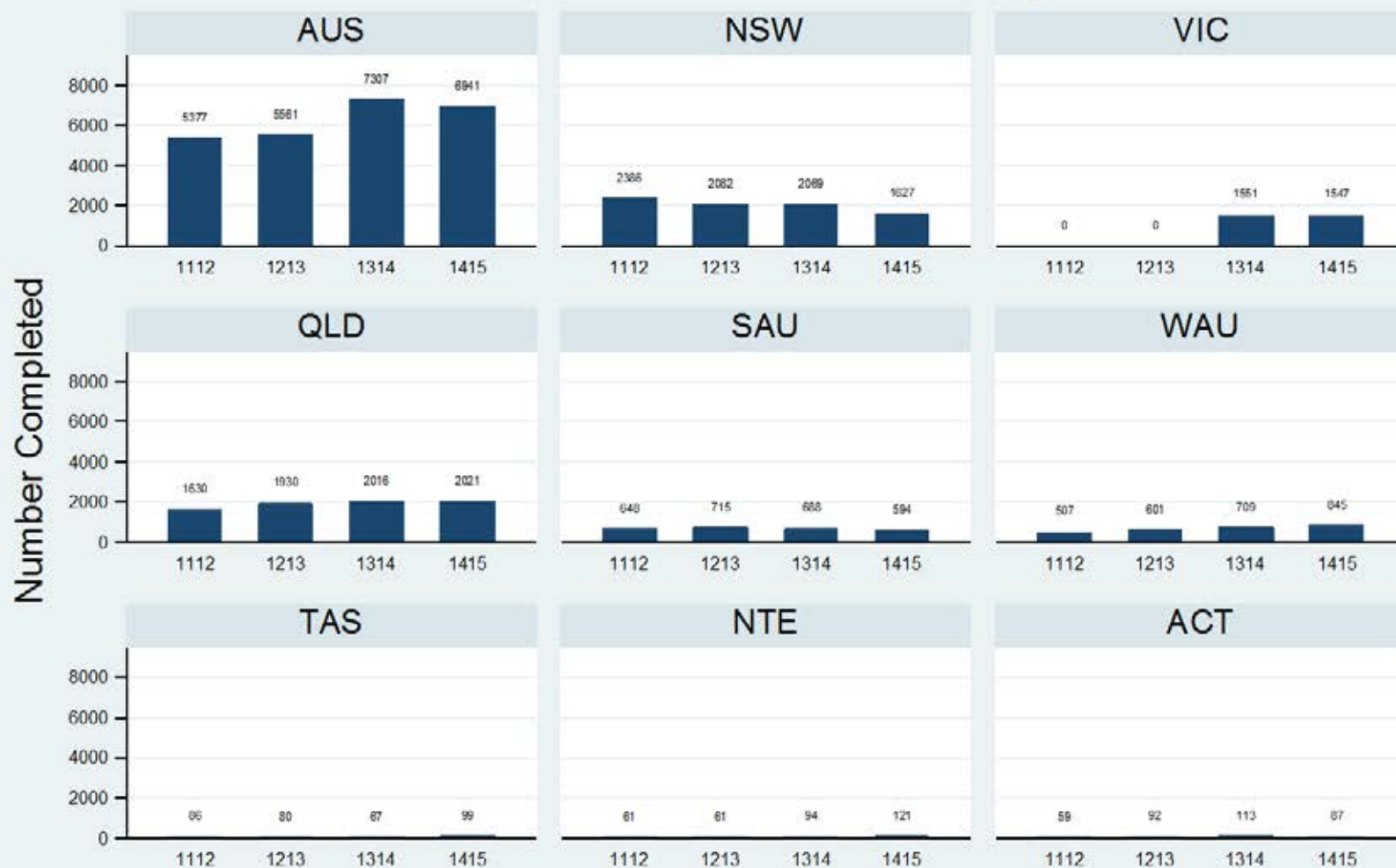
Figure 1.3.1.6.V: Child & Adolescent - Ambulatory - Admission - SDQ-YR

Data Extract - 06 March 2016; Analysis & Reporting - 12 March 2016