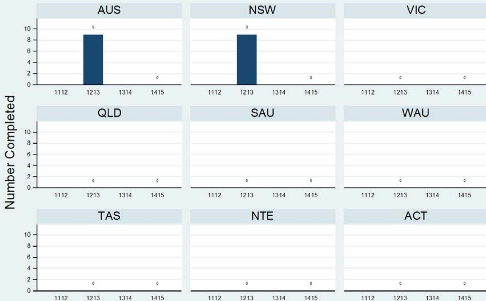
Figure 1.2.2.5.V: Child & Adolescent - Residential - Review - SDQ-PY

Data Extract - 06 March 2016; Analysis & Reporting - 12 March 2016