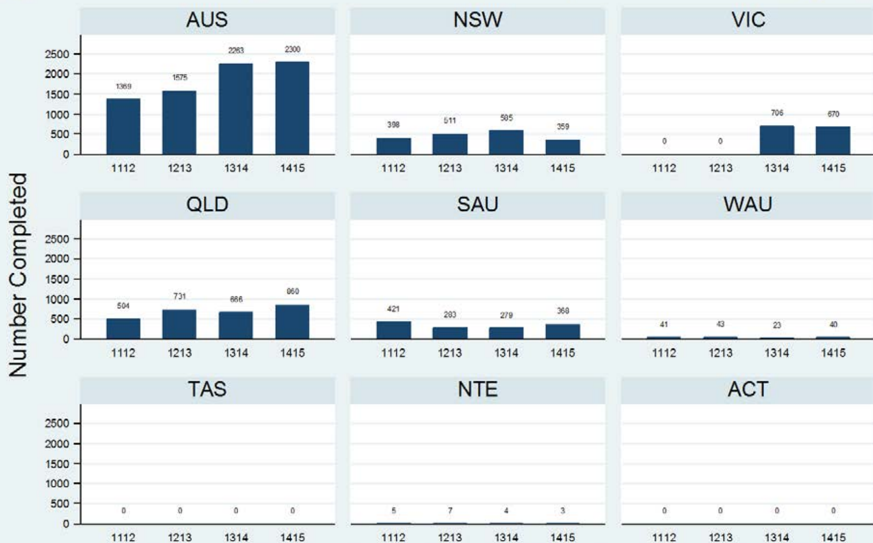
Figure 1.1.3.3.V: Child & Adolescent - Inpatient - Discharge - FIHS

Data Extract - 06 March 2016; Analysis & Reporting - 12 March 2016