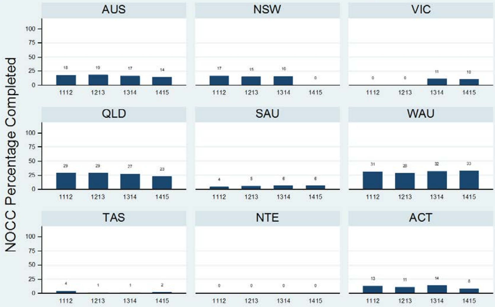
Figure 1.3.2.5.C: Child & Adolescent - Ambulatory - Review - SDQ-PY

Data Extract - 06 March 2016; Analysis & Reporting - 12 March 2016