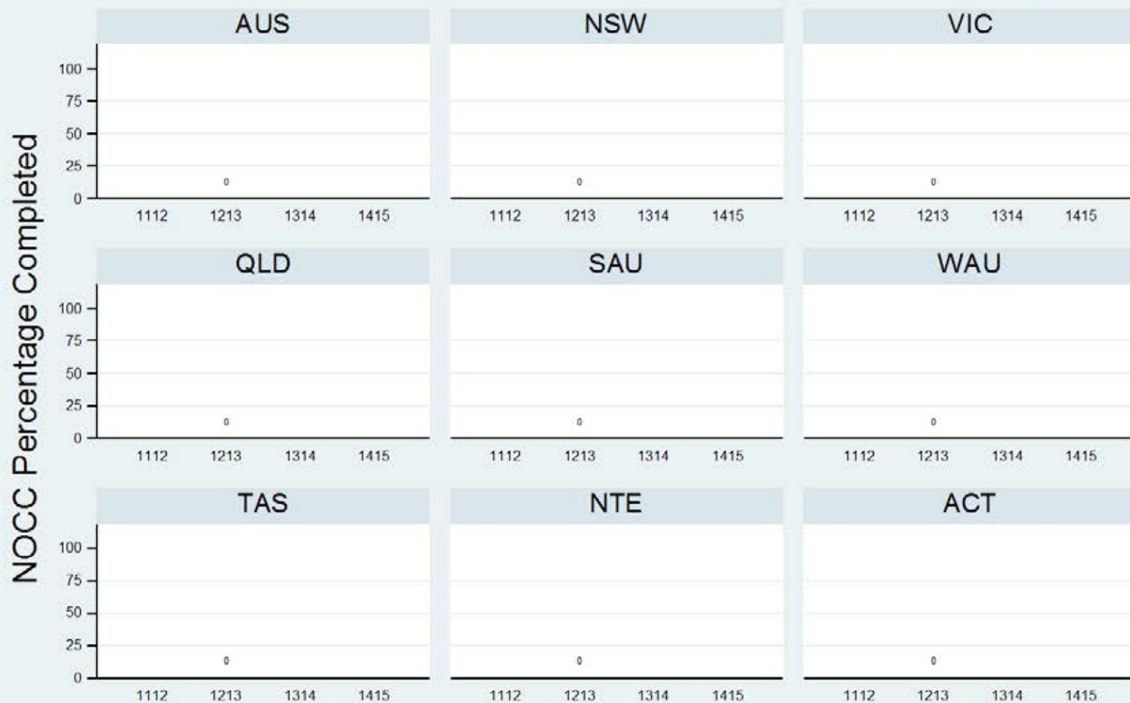
Figure 1.2.3.4.C: Child & Adolescent - Residential - Discharge - SDQ-PC

Data Extract - 06 March 2016; Analysis & Reporting - 12 March 2016