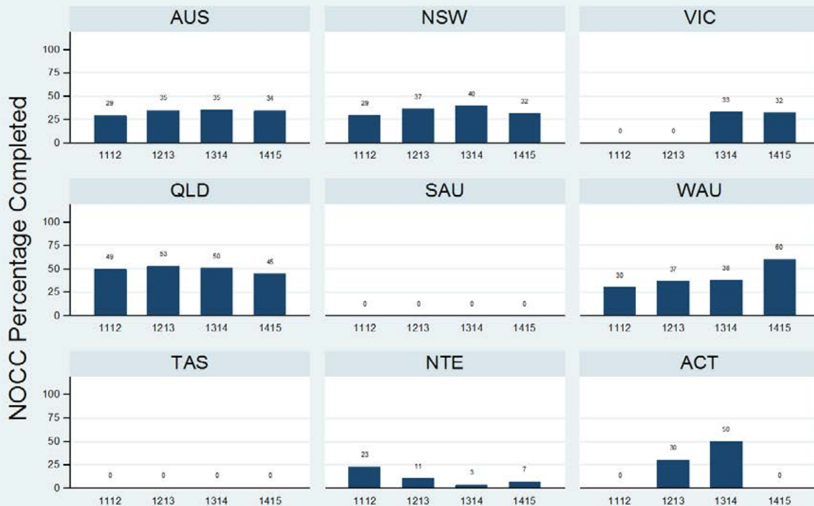
Figure 1.1.1.5.C: Child & Adolescent - Inpatient - Admission - SDQ-PY

Data Extract - 06 March 2016; Analysis & Reporting - 12 March 2016