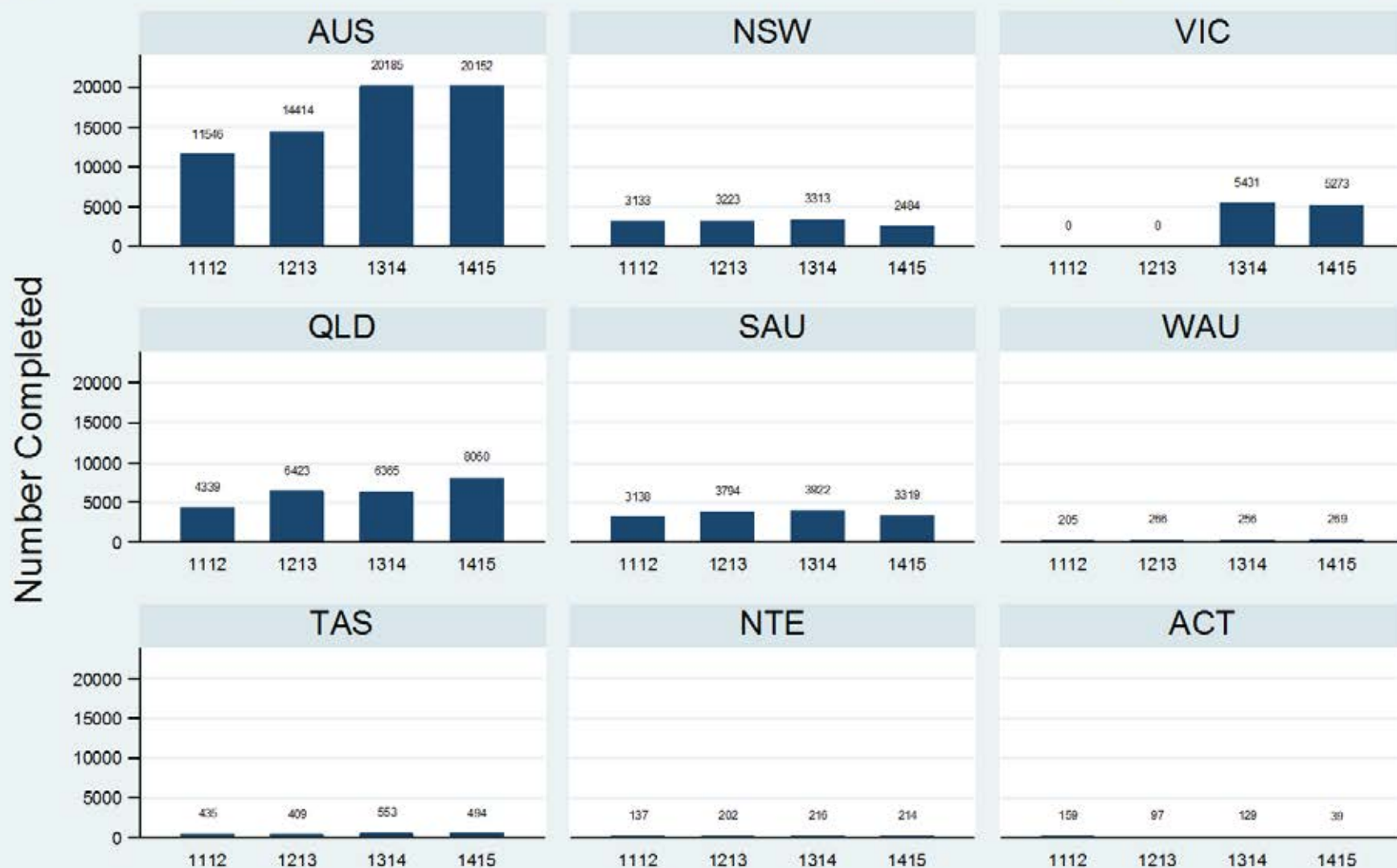
Figure 1.3.2.3.V: Child & Adolescent - Ambulatory - Review - FIHS

Data Extract - 06 March 2016; Analysis & Reporting - 12 March 2016