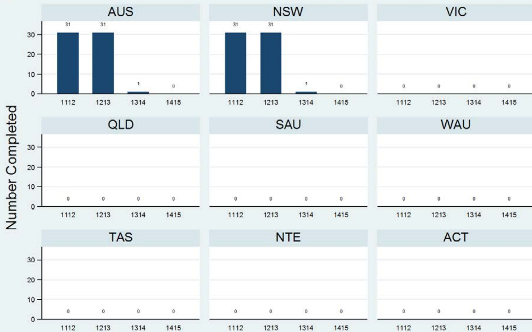
Figure 1.1.2.4.V: Child & Adolescent - Inpatient - Review - SDQ-PC

Data Extract - 06 March 2016; Analysis & Reporting - 12 March 2016