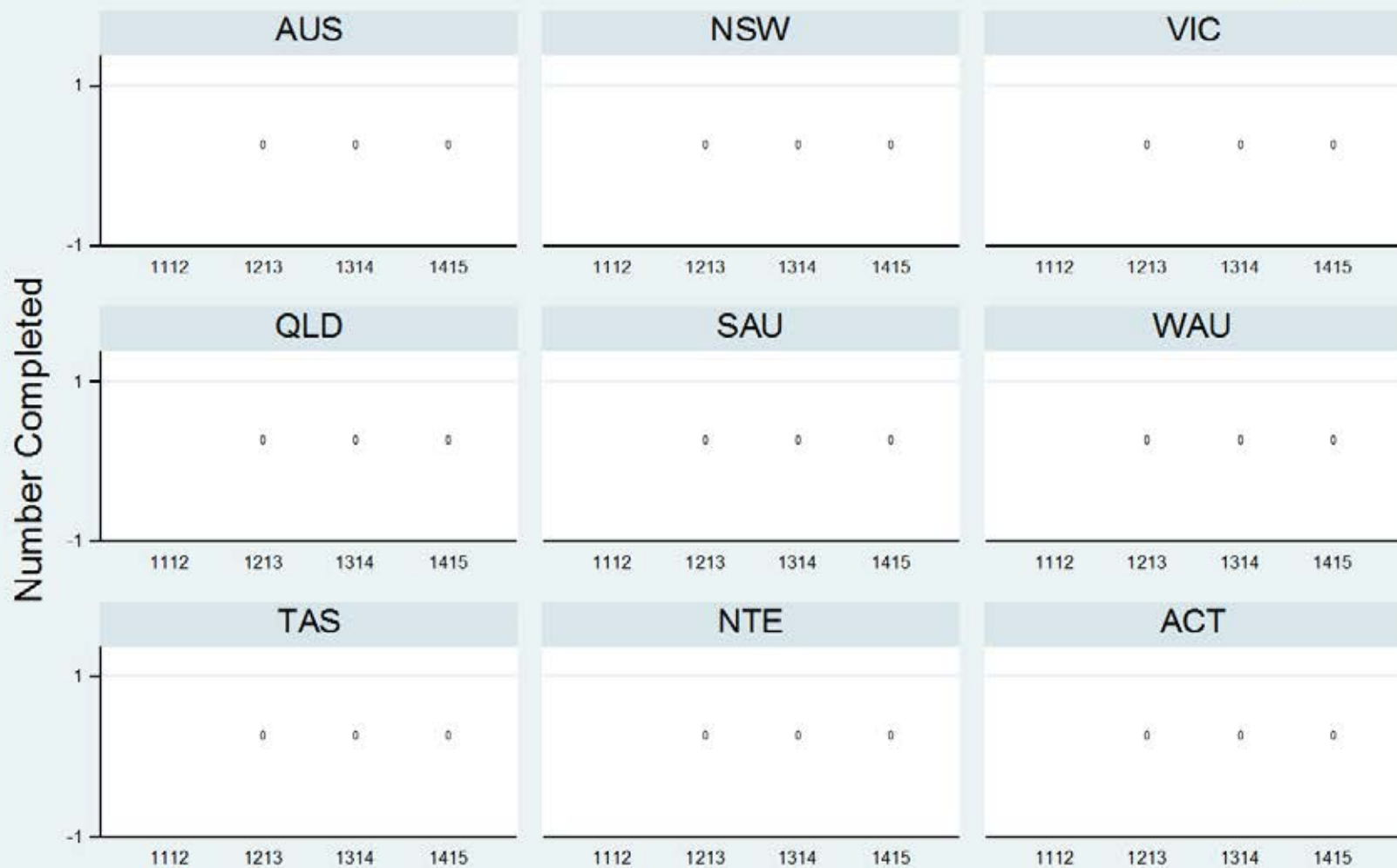
Figure 1.2.3.5.V: Child & Adolescent - Residential - Discharge - SDQ-PY

Data Extract - 06 March 2016; Analysis & Reporting - 12 March 2016