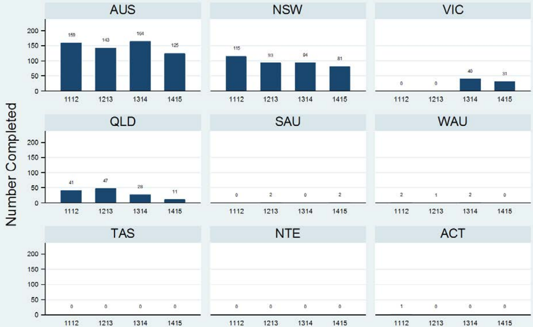
Figure 1.1.2.2.V: Child & Adolescent - Inpatient - Review - CGAS

Data Extract - 06 March 2016; Analysis & Reporting - 12 March 2016