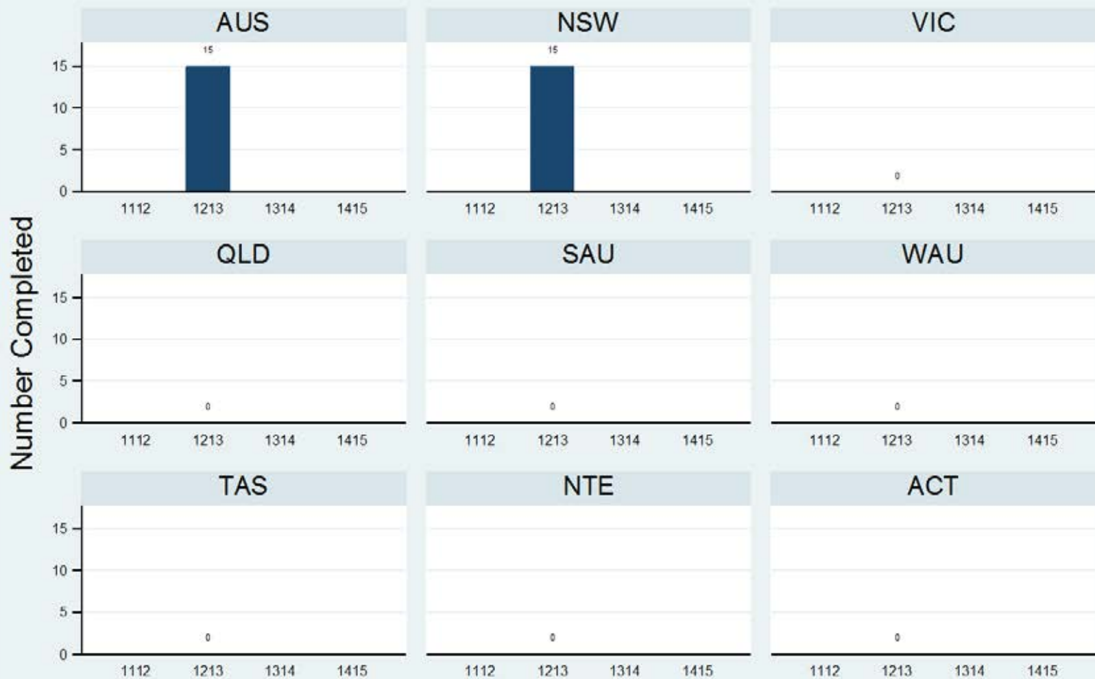
Figure 1.2.1.4.V: Child & Adolescent - Residential - Admission - SDQ-PC

Data Extract - 06 March 2016; Analysis & Reporting - 12 March 2016