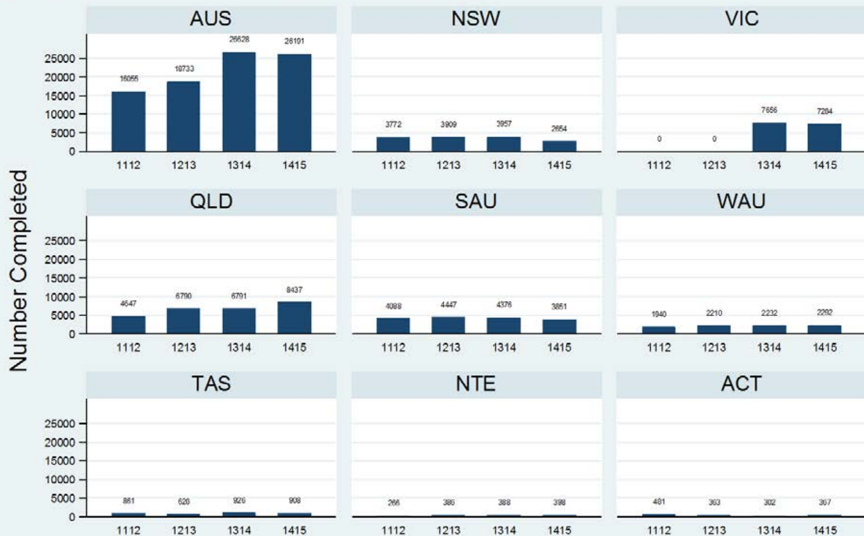
Figure 1.3.2.8.V: Child & Adolescent - Ambulatory - Review - MHLS

Data Extract - 06 March 2016; Analysis & Reporting - 12 March 2016