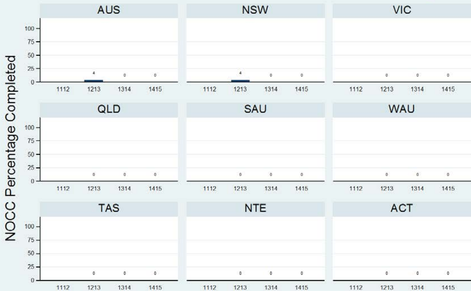
Figure 1.2.3.6.C: Child & Adolescent - Residential - Discharge - SDQ-YR

Data Extract - 06 March 2016; Analysis & Reporting - 12 March 2016