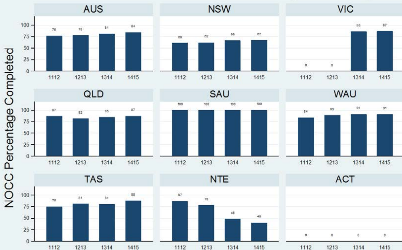
Figure 1.3.3.7.C: Child & Adolescent - Ambulatory - Discharge - Diagnosis

Data Extract - 06 March 2016; Analysis & Reporting - 12 March 2016