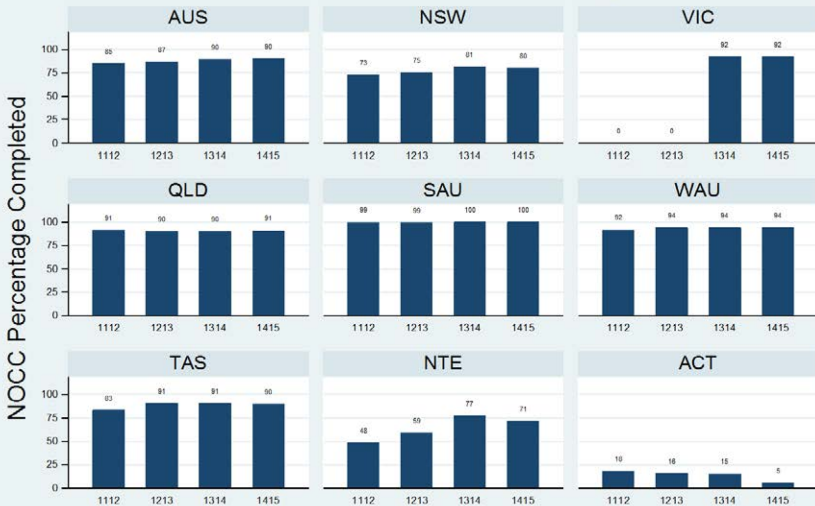
Figure 1.3.2.7.C: Child & Adolescent - Ambulatory - Review - Diagnosis

Data Extract - 06 March 2016; Analysis & Reporting - 12 March 2016