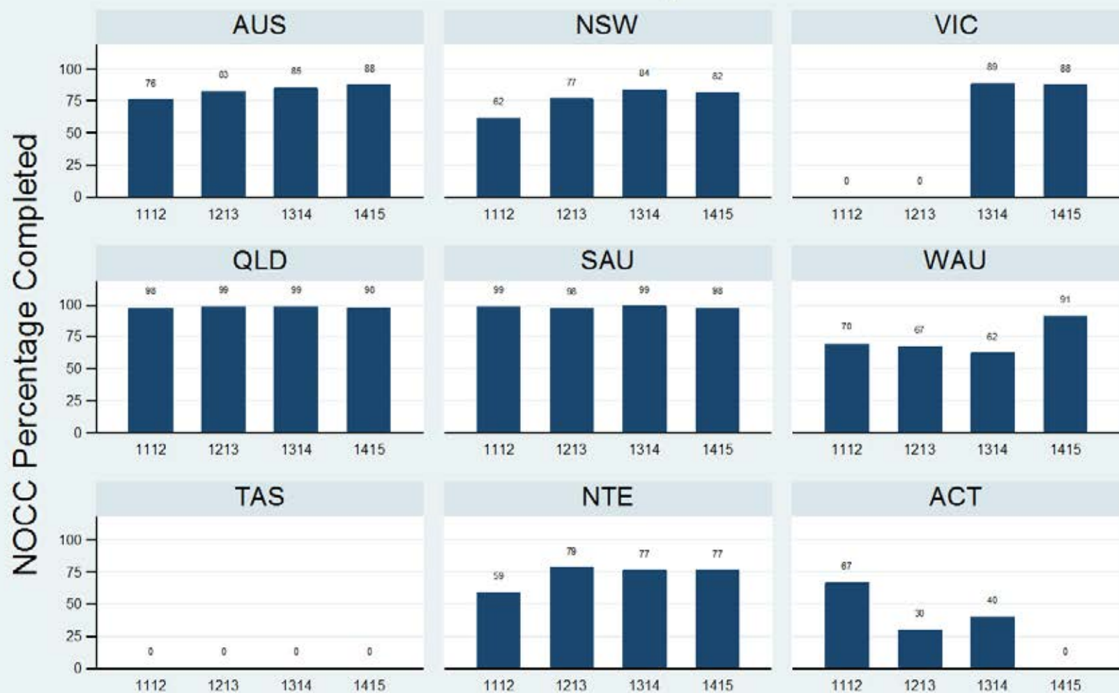
Figure 1.1.1.1.C: Child & Adolescent - Inpatient - Admission - HoNOSCA

Data Extract - 06 March 2016; Analysis & Reporting - 12 March 2016