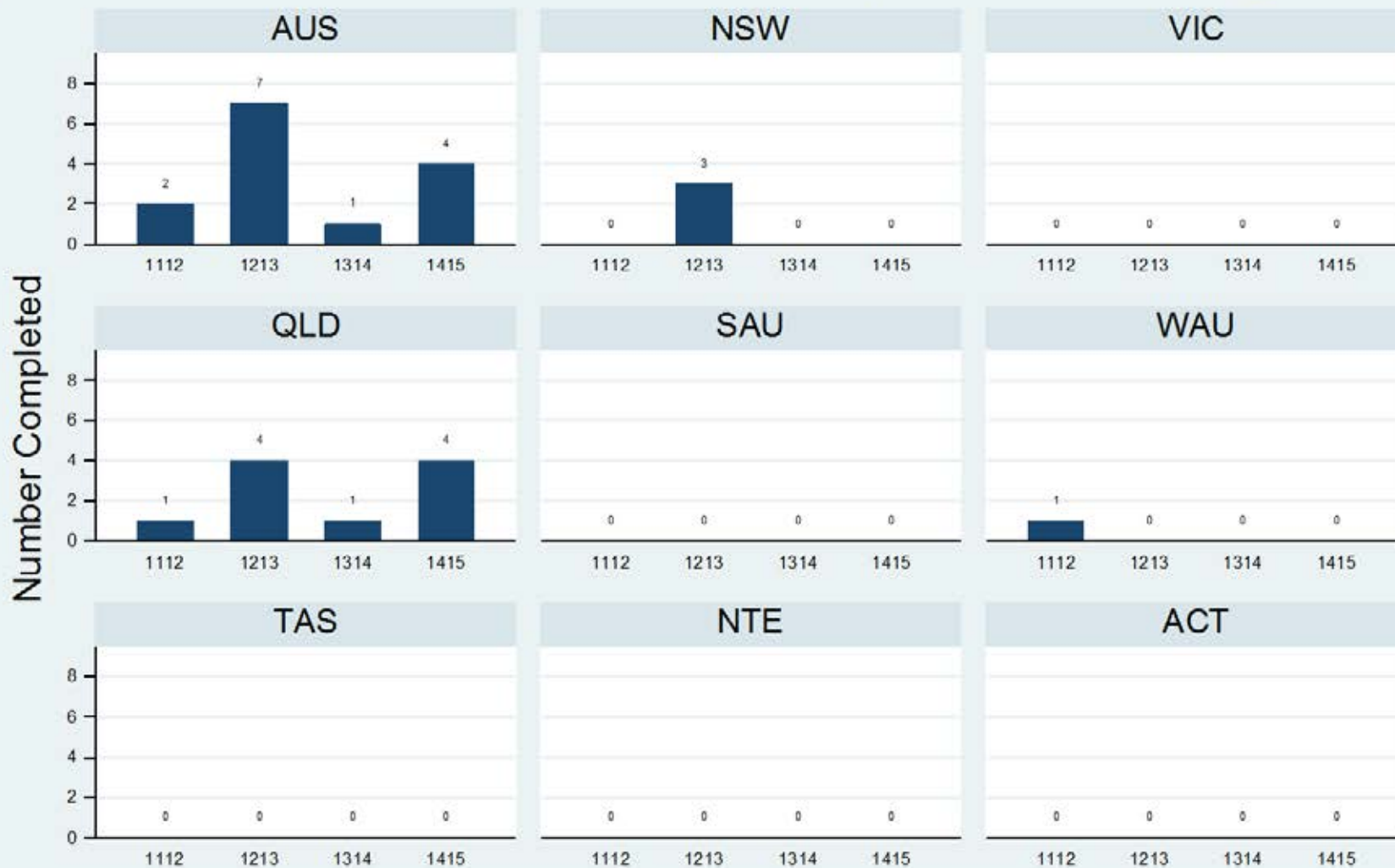
Figure 1.1.3.4.V: Child & Adolescent - Inpatient - Discharge - SDQ-PC

Data Extract - 06 March 2016; Analysis & Reporting - 12 March 2016