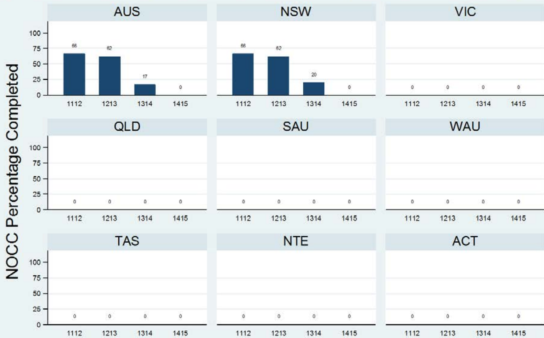
Figure 1.1.2.4.C: Child & Adolescent - Inpatient - Review - SDQ-PC

Data Extract - 06 March 2016; Analysis & Reporting - 12 March 2016