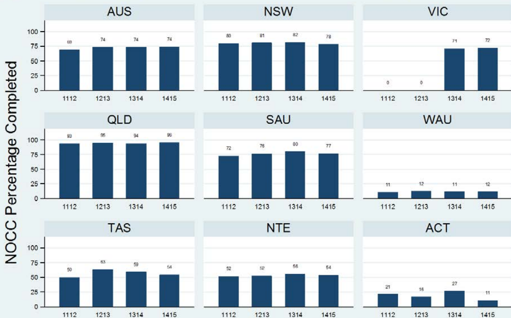
Figure 1.3.2.3.C: Child & Adolescent - Ambulatory - Review - FIHS

Data Extract - 06 March 2016; Analysis & Reporting - 12 March 2016