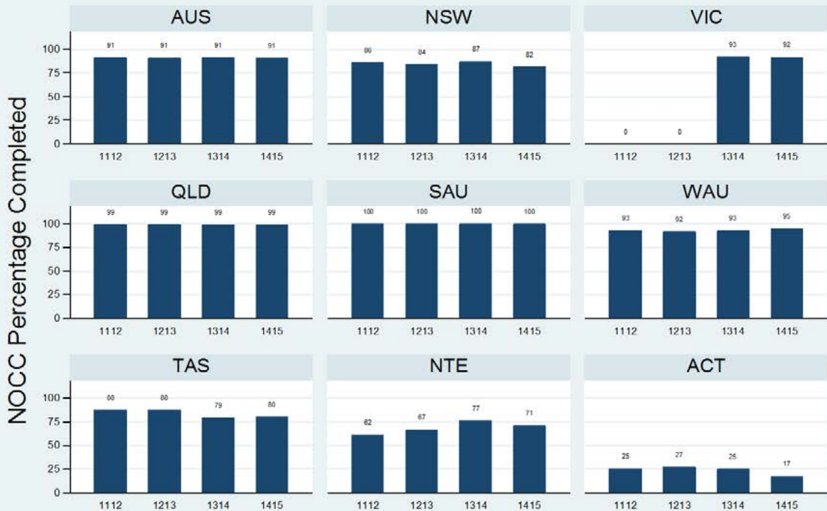
Figure 1.3.1.2.C: Child & Adolescent - Ambulatory - Admission - CGAS

Data Extract - 06 March 2016; Analysis & Reporting - 12 March 2016