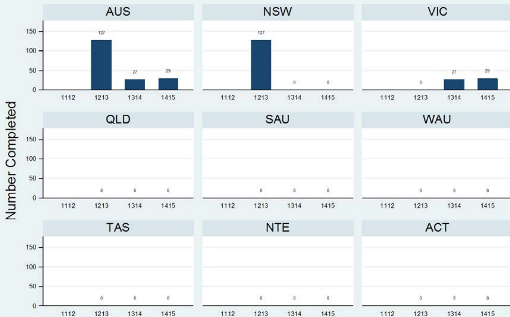
Figure 1.2.1.2.V: Child & Adolescent - Residential - Admission - CGAS

Data Extract - 06 March 2016; Analysis & Reporting - 12 March 2016