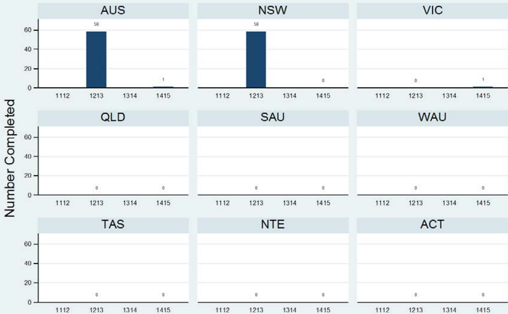
Figure 1.2.2.7.V: Child & Adolescent - Residential - Review - Diagnosis

Data Extract - 06 March 2016; Analysis & Reporting - 12 March 2016