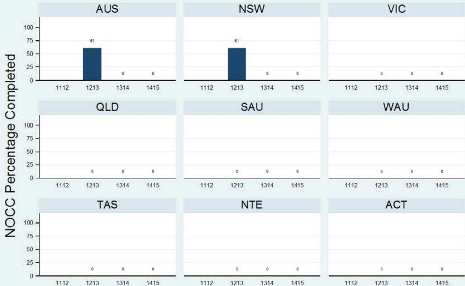
Figure 1.2.1.6.C: Child & Adolescent - Residential - Admission - SDQ-YR

Data Extract - 06 March 2016; Analysis & Reporting - 12 March 2016