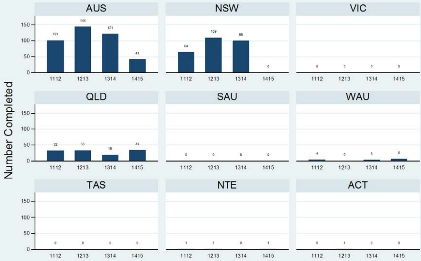
Figure 1.1.3.5.V: Child & Adolescent - Inpatient - Discharge - SDQ-PY

Data Extract - 06 March 2016; Analysis & Reporting - 12 March 2016