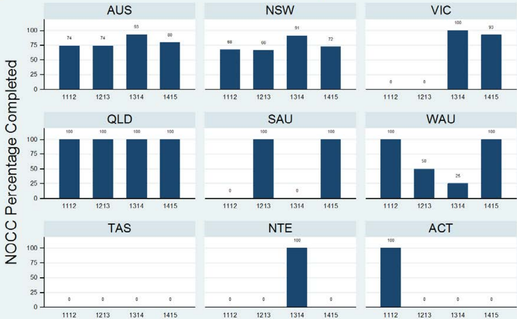
Figure 1.1.2.1.C: Child & Adolescent - Inpatient - Review - HoNOSCA

Data Extract - 06 March 2016; Analysis & Reporting - 12 March 2016