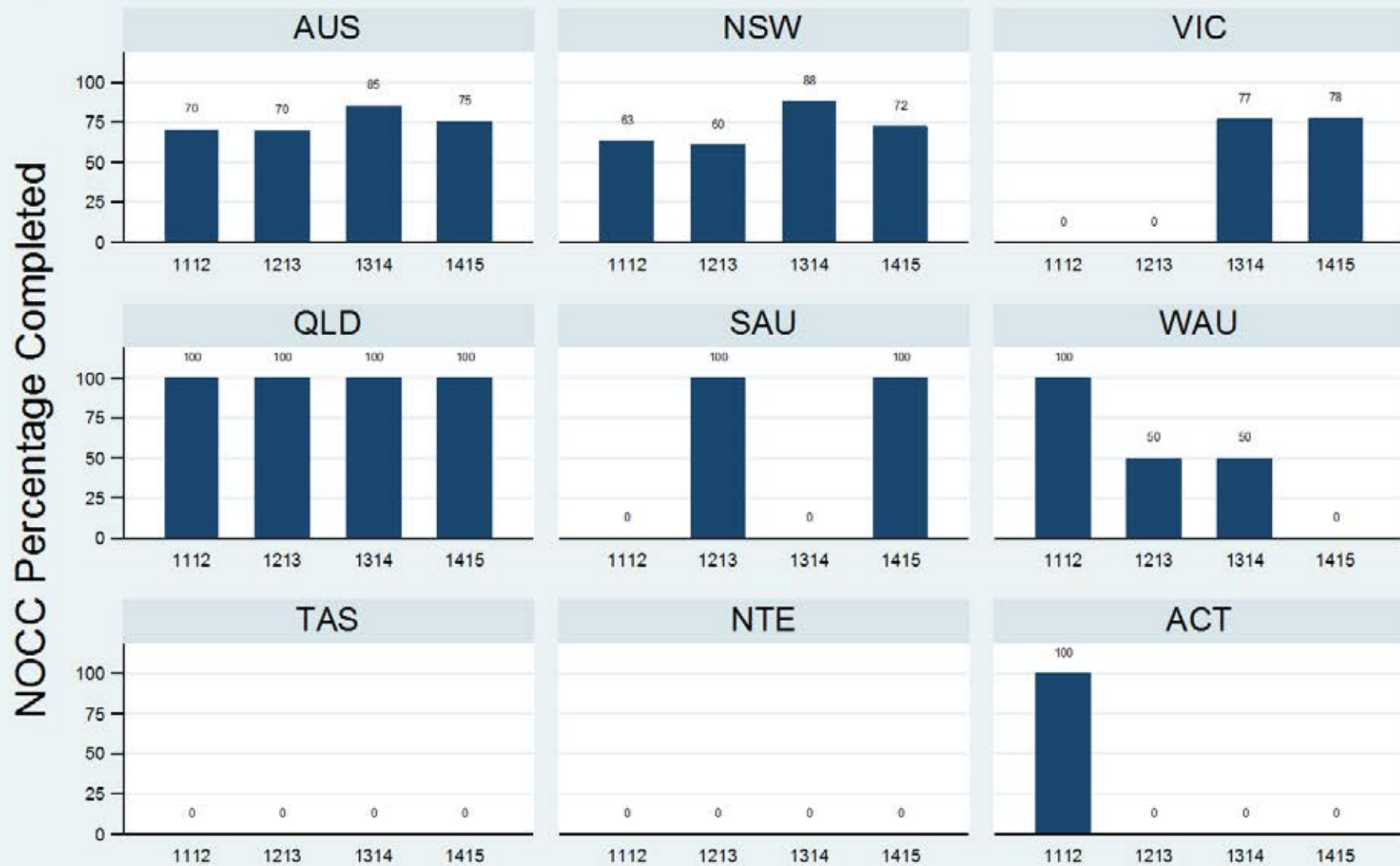
Figure 1.1.2.2.C: Child & Adolescent - Inpatient - Review - CGAS

Data Extract - 06 March 2016; Analysis & Reporting - 12 March 2016