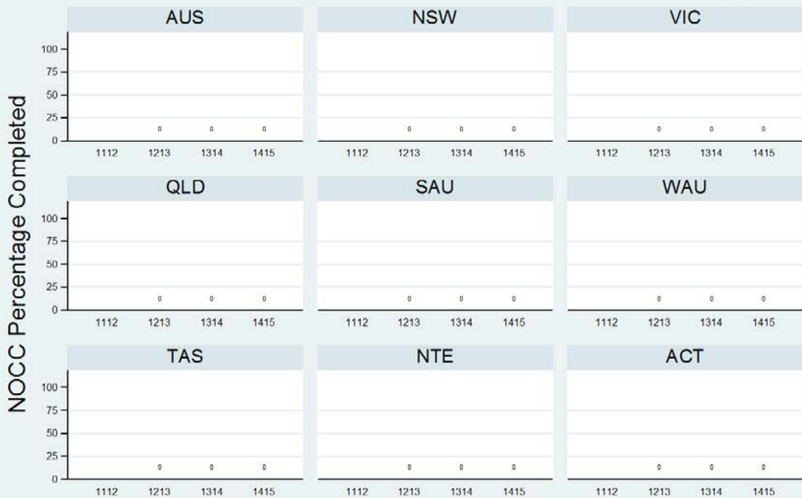
Figure 1.2.3.5.C: Child & Adolescent - Residential - Discharge - SDQ-PY

Data Extract - 06 March 2016; Analysis & Reporting - 12 March 2016