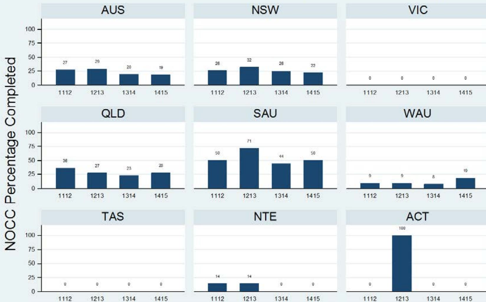
Figure 1.1.3.6.C: Child & Adolescent - Inpatient - Discharge - SDQ-YR

Data Extract - 06 March 2016; Analysis & Reporting - 12 March 2016