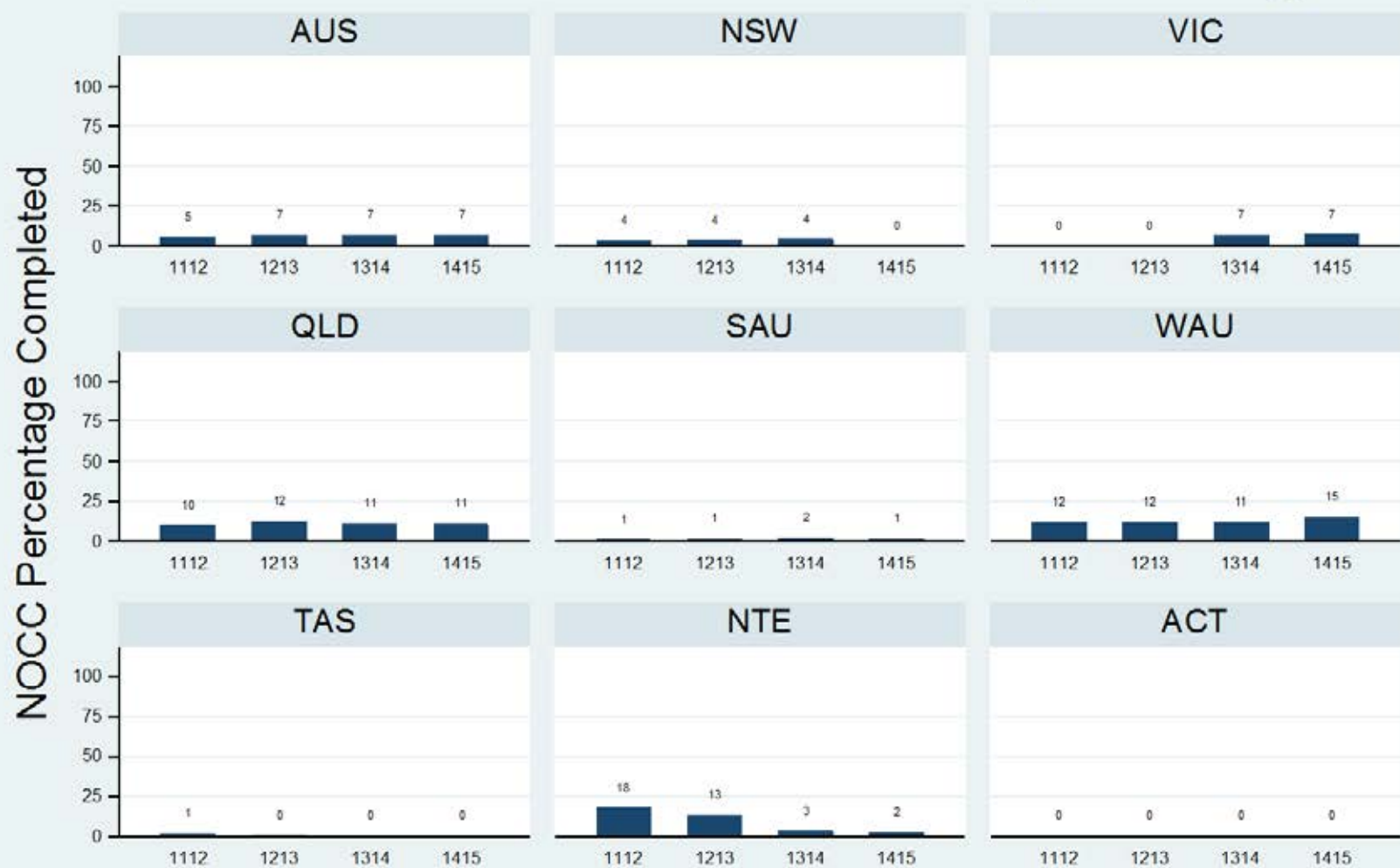
Figure 1.3.3.5.C: Child & Adolescent - Ambulatory - Discharge - SDQ-PY

Data Extract - 06 March 2016; Analysis & Reporting - 12 March 2016