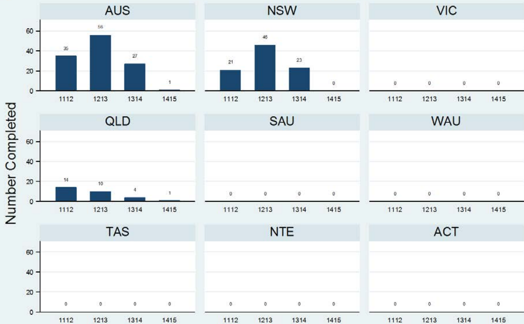
Figure 1.1.2.5.V: Child & Adolescent - Inpatient - Review - SDQ-PY

Data Extract - 06 March 2016; Analysis & Reporting - 12 March 2016