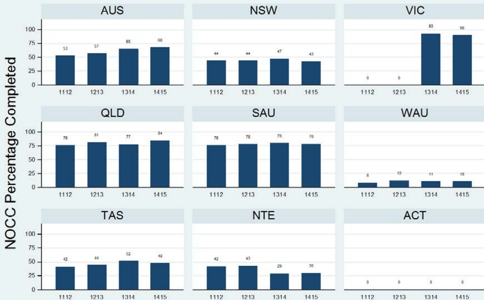
Figure 1.3.3.3.C: Child & Adolescent - Ambulatory - Discharge - FIHS

Data Extract - 06 March 2016; Analysis & Reporting - 12 March 2016