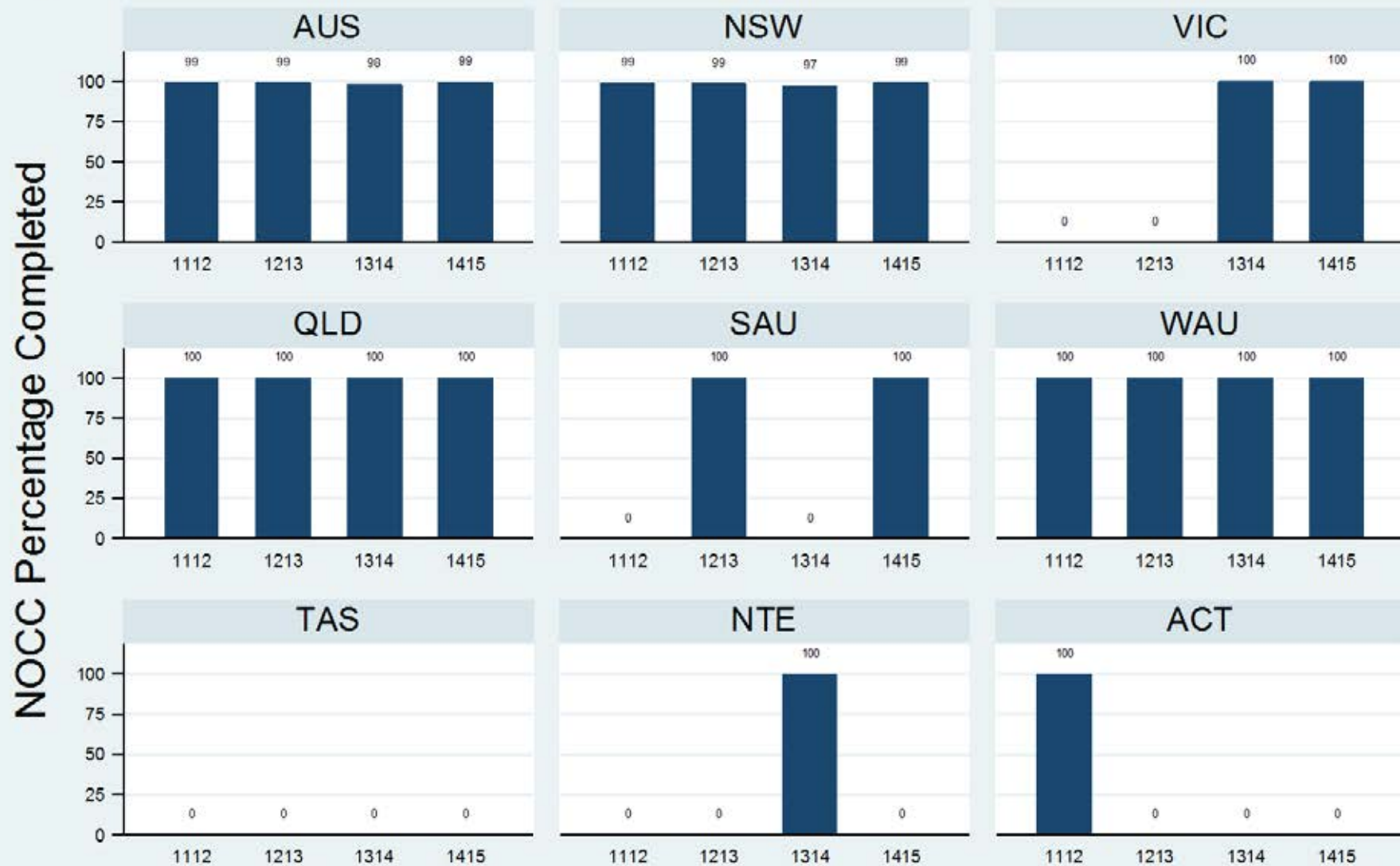
Figure 1.1.2.8.C: Child & Adolescent - Inpatient - Review - MHLS

Data Extract - 06 March 2016; Analysis & Reporting - 12 March 2016