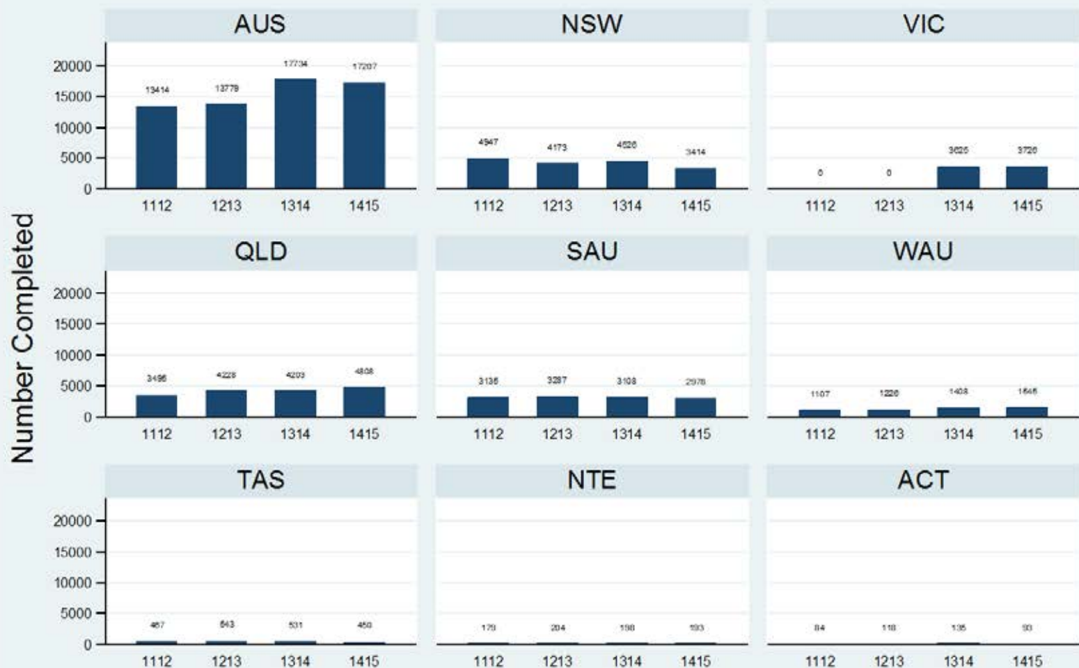
Figure 1.3.1.1.V: Child & Adolescent - Ambulatory - Admission - HoNOSCA

Data Extract - 06 March 2016; Analysis & Reporting - 12 March 2016