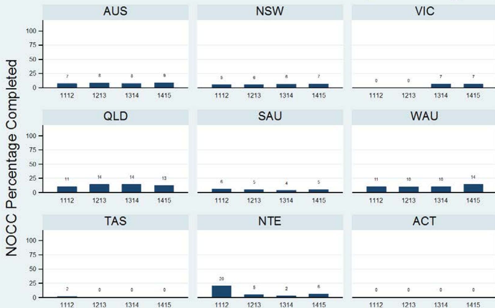
Figure 1.3.3.6.C: Child & Adolescent - Ambulatory - Discharge - SDQ-YR

Data Extract - 06 March 2016; Analysis & Reporting - 12 March 2016