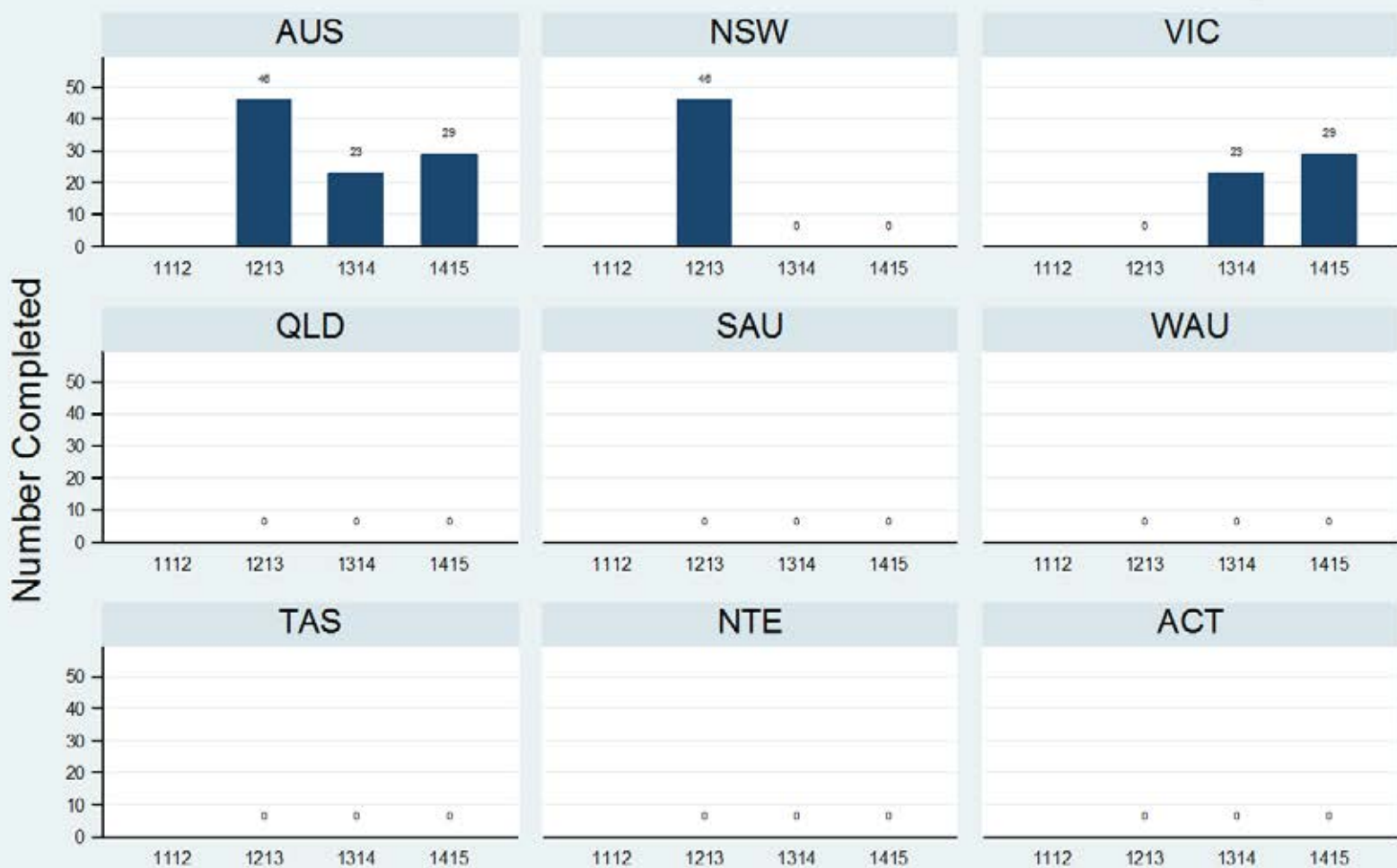
Figure 1.2.3.1.V: Child & Adolescent - Residential - Discharge - HoNOSCA

Data Extract - 06 March 2016; Analysis & Reporting - 12 March 2016