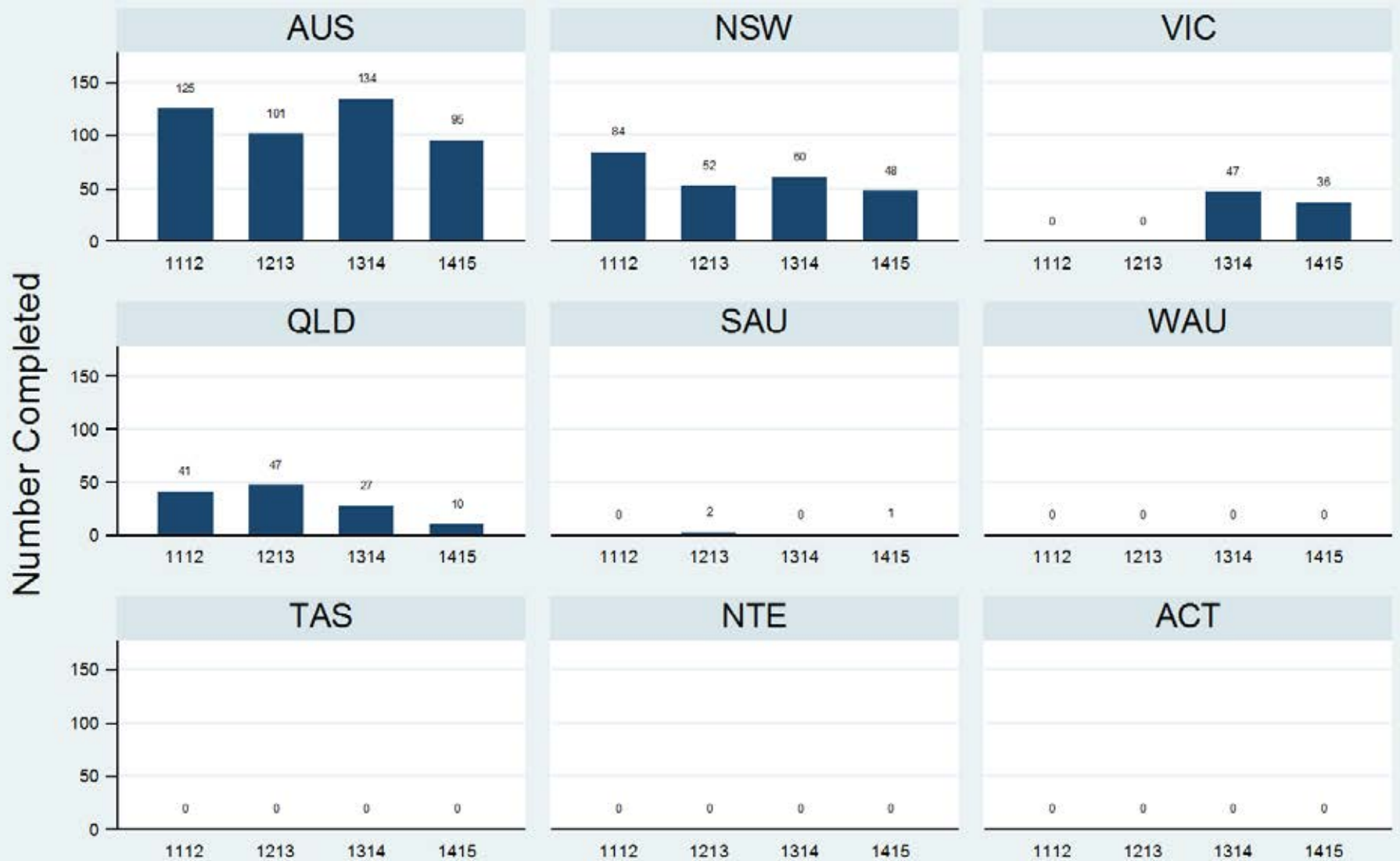
Figure 1.1.2.3.V: Child & Adolescent - Inpatient - Review - FIHS

Data Extract - 06 March 2016; Analysis & Reporting - 12 March 2016