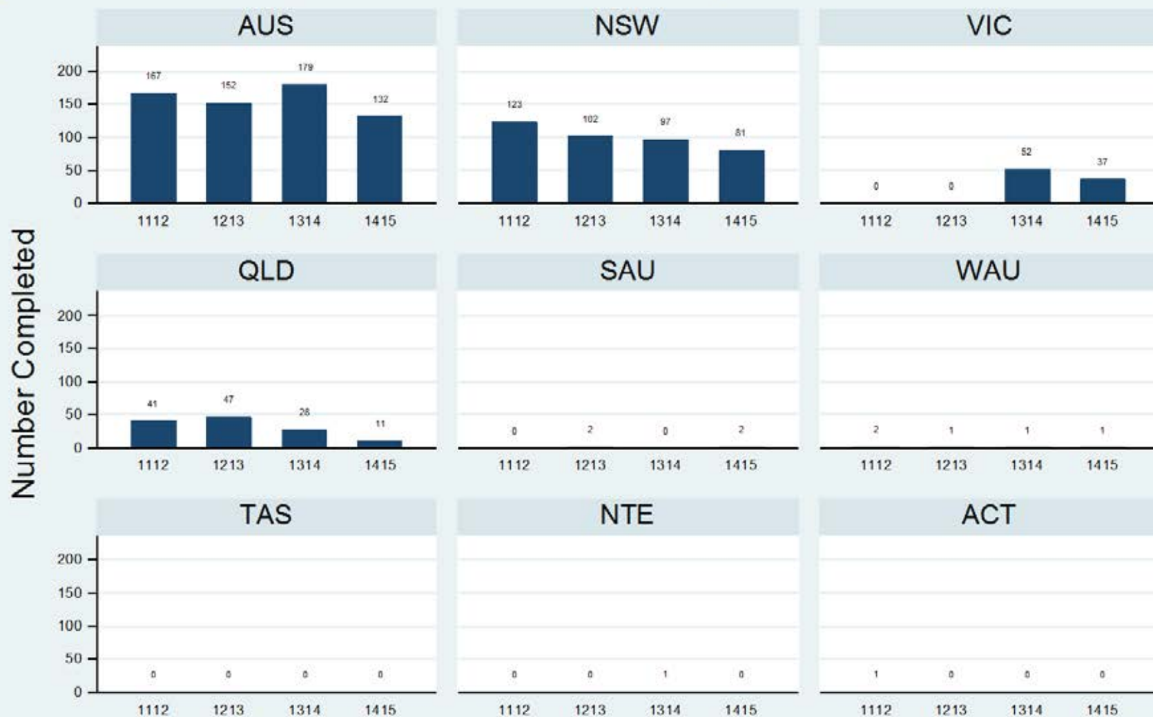
Figure 1.1.2.1.V: Child & Adolescent - Inpatient - Review - HoNOSCA

Data Extract - 06 March 2016; Analysis & Reporting - 12 March 2016