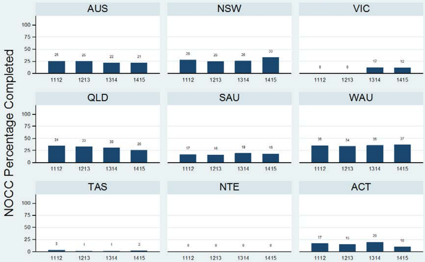
Figure 1.3.2.6.C: Child & Adolescent - Ambulatory - Review - SDQ-YR

Data Extract - 06 March 2016; Analysis & Reporting - 12 March 2016