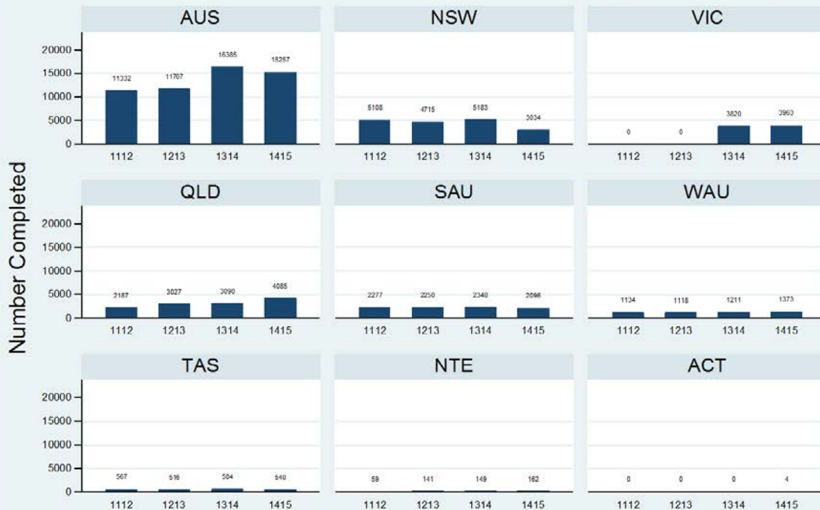
Figure 1.3.3.8.V: Child & Adolescent - Ambulatory - Discharge - MHLS

Data Extract - 06 March 2016; Analysis & Reporting - 12 March 2016