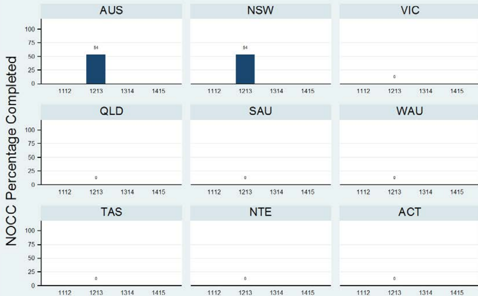
Figure 1.2.1.4.C: Child & Adolescent - Residential - Admission - SDQ-PC

Data Extract - 06 March 2016; Analysis & Reporting - 12 March 2016