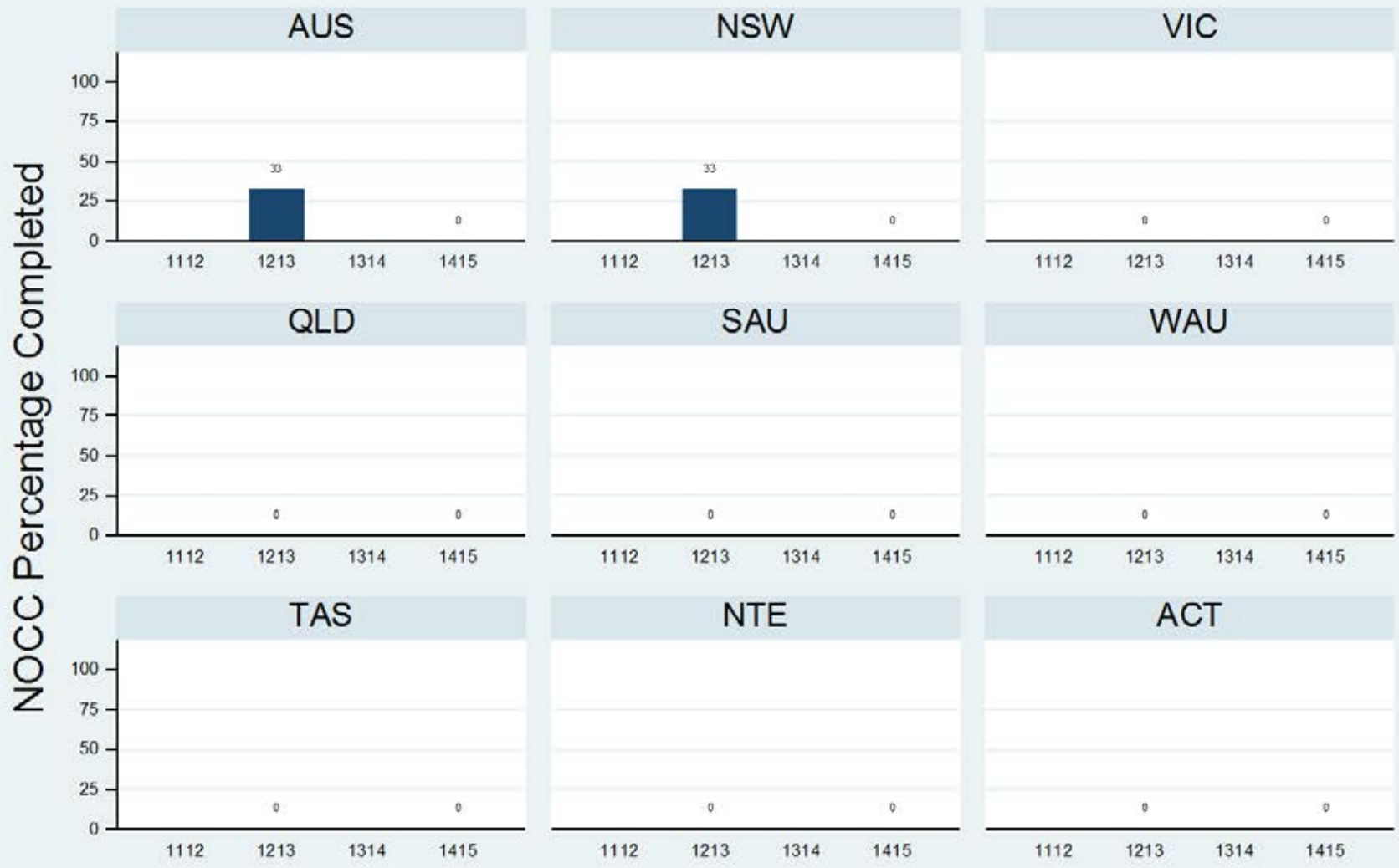
Figure 1.2.2.6.C: Child & Adolescent - Residential - Review - SDQ-YR

Data Extract - 06 March 2016; Analysis & Reporting - 12 March 2016