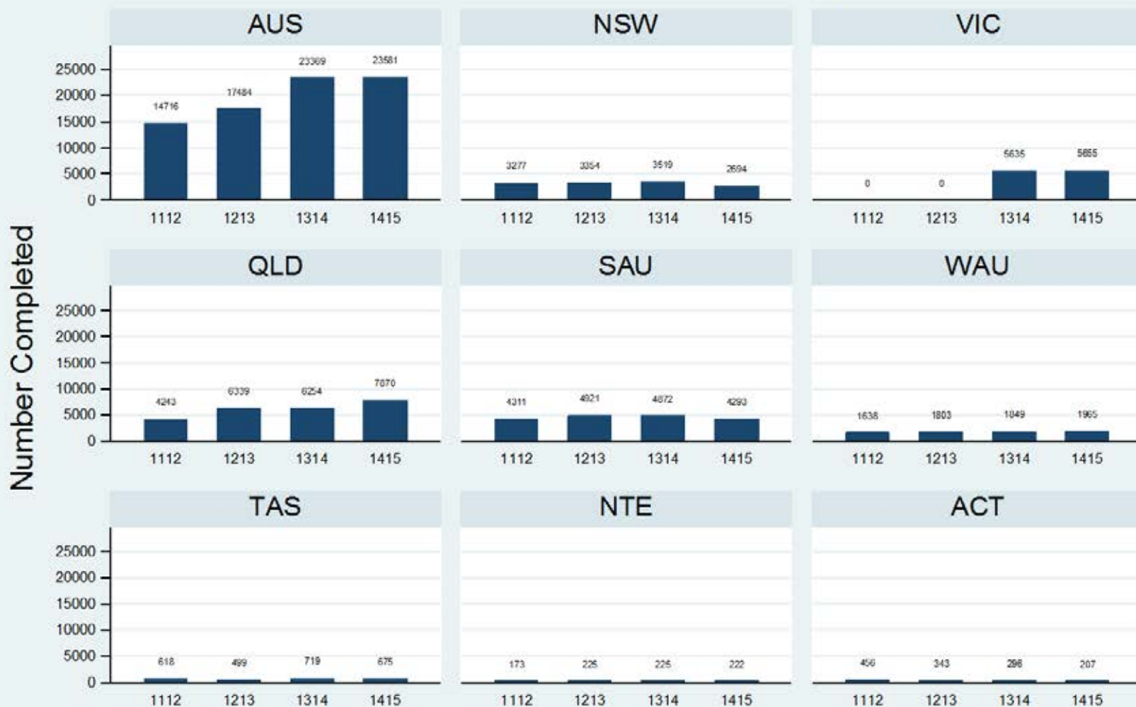
Figure 1.3.2.1.V: Child & Adolescent - Ambulatory - Review - HoNOSCA

Data Extract - 06 March 2016; Analysis & Reporting - 12 March 2016