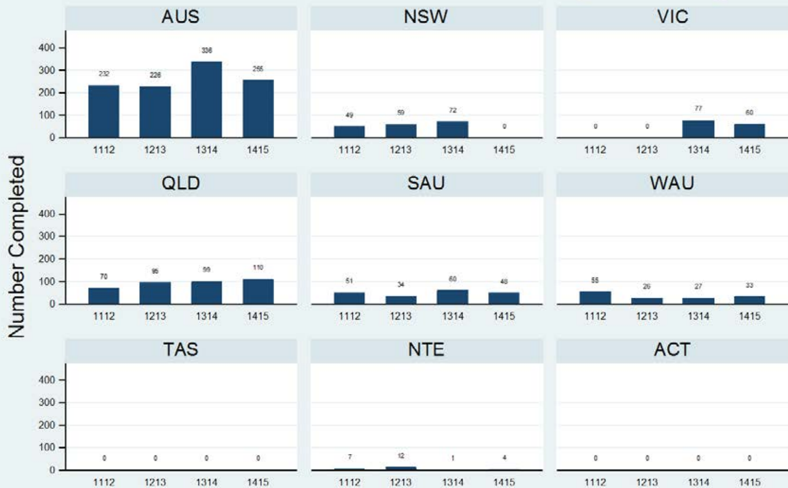
Figure 1.3.3.4.V: Child & Adolescent - Ambulatory - Discharge - SDQ-PC

Data Extract - 06 March 2016; Analysis & Reporting - 12 March 2016