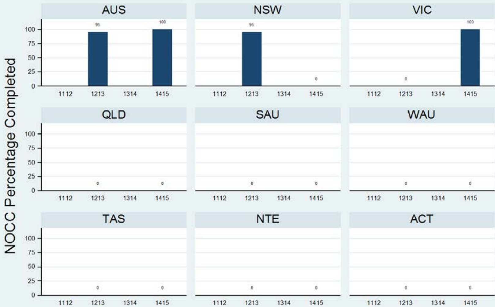
Figure 1.2.2.1.C: Child & Adolescent - Residential - Review - HoNOSCA

Data Extract - 06 March 2016; Analysis & Reporting - 12 March 2016