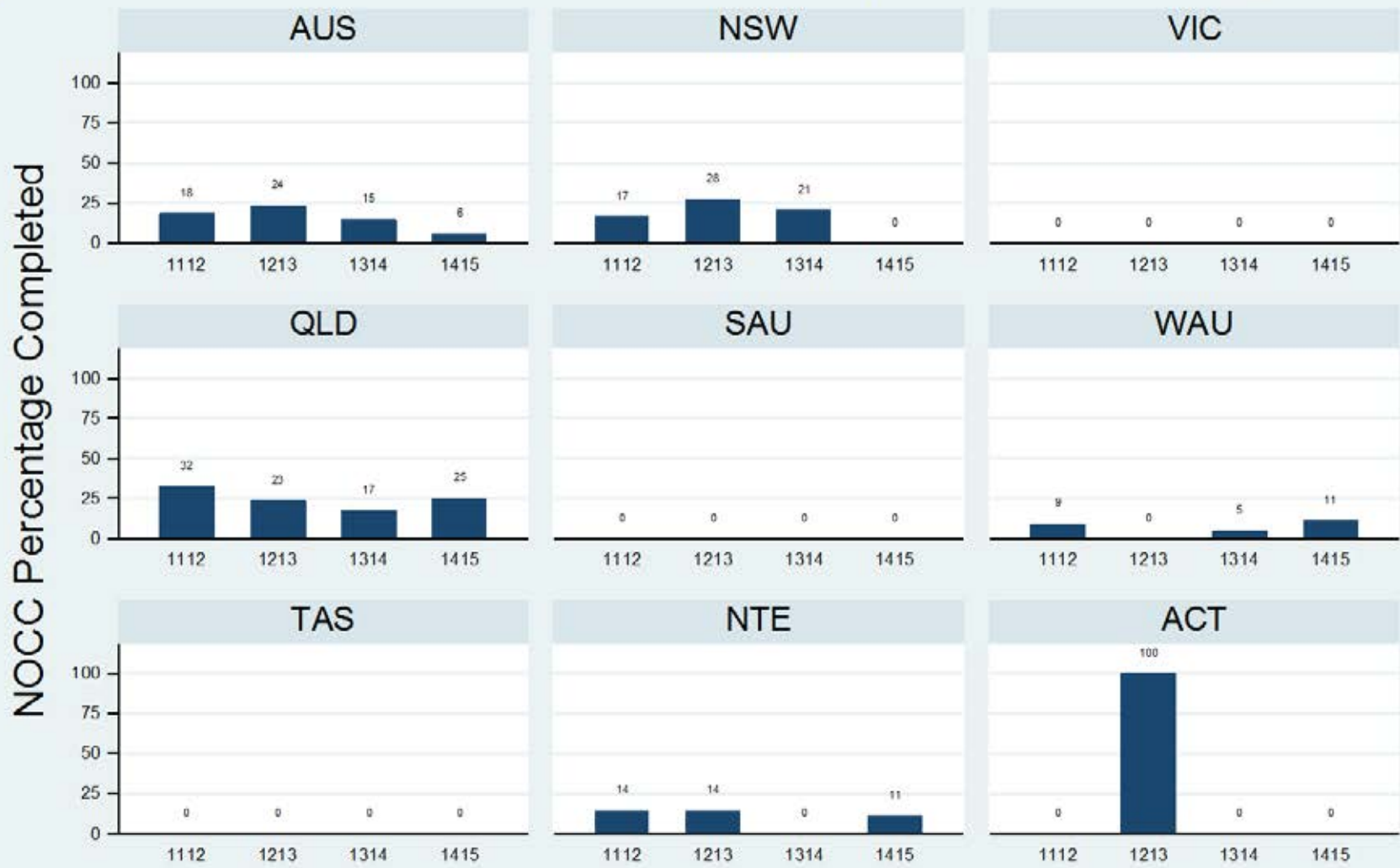
Figure 1.1.3.5.C: Child & Adolescent - Inpatient - Discharge - SDQ-PY

Data Extract - 06 March 2016; Analysis & Reporting - 12 March 2016