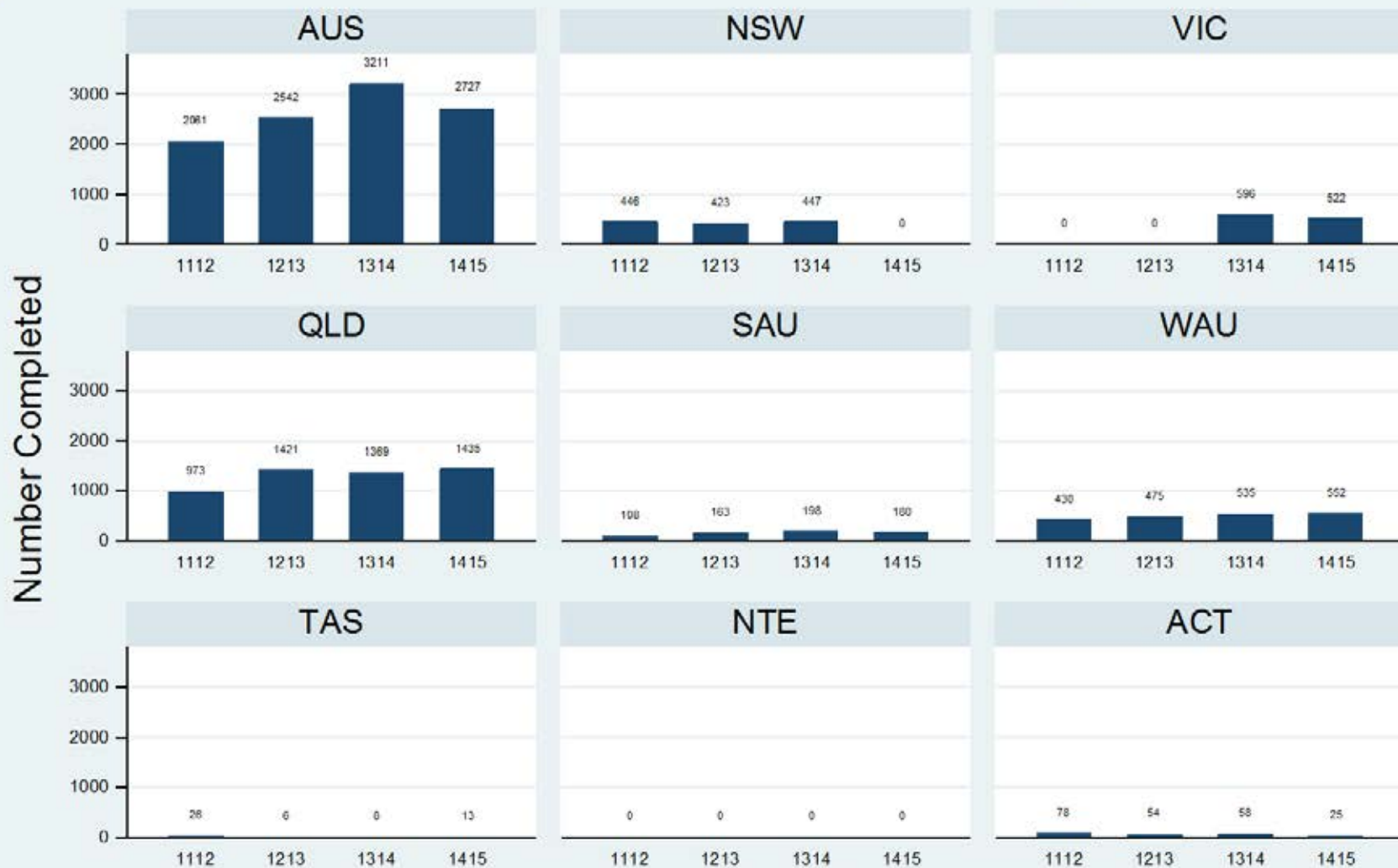
Figure 1.3.2.5.V: Child & Adolescent - Ambulatory - Review - SDQ-PY

Data Extract - 06 March 2016; Analysis & Reporting - 12 March 2016