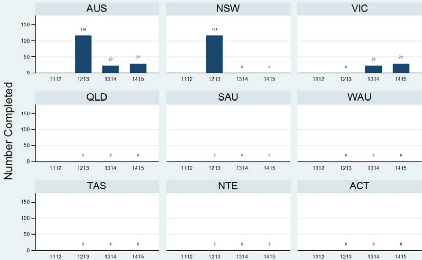
Figure 1.2.3.8.V: Child & Adolescent - Residential - Discharge - MHLS

Data Extract - 06 March 2016; Analysis & Reporting - 12 March 2016