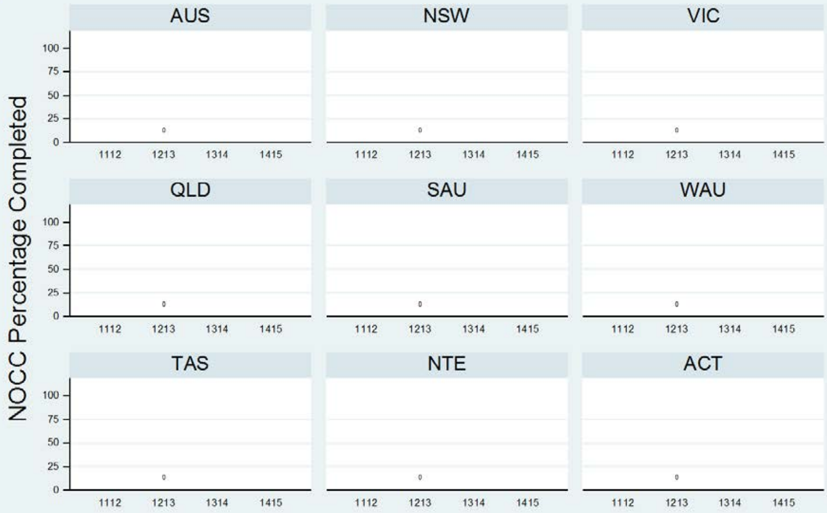
Figure 1.2.2.4.C: Child & Adolescent - Residential - Review - SDQ-PC

Data Extract - 06 March 2016; Analysis & Reporting - 12 March 2016