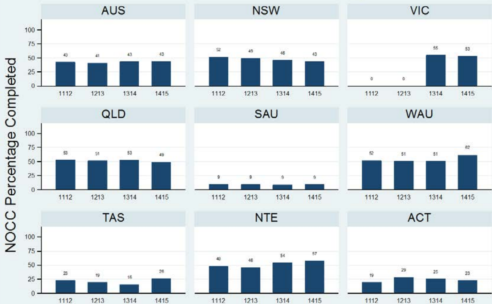
Figure 1.3.1.5.C: Child & Adolescent - Ambulatory - Admission - SDQ-PY

Data Extract - 06 March 2016; Analysis & Reporting - 12 March 2016