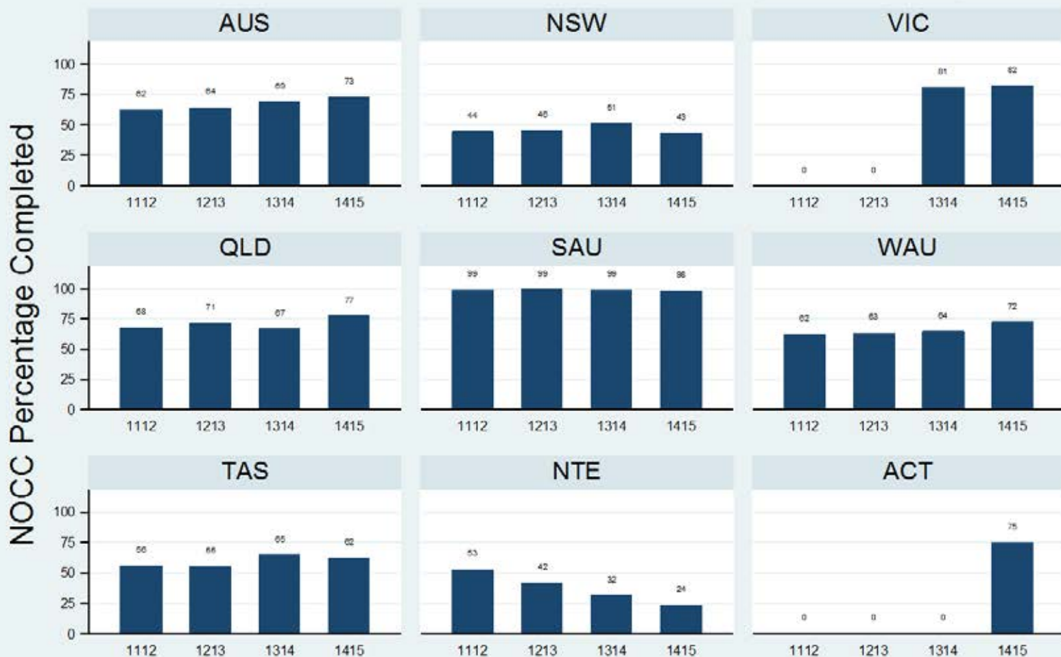
Figure 1.3.3.1.C: Child & Adolescent - Ambulatory - Discharge - HoNOSCA

Data Extract - 06 March 2016; Analysis & Reporting - 12 March 2016