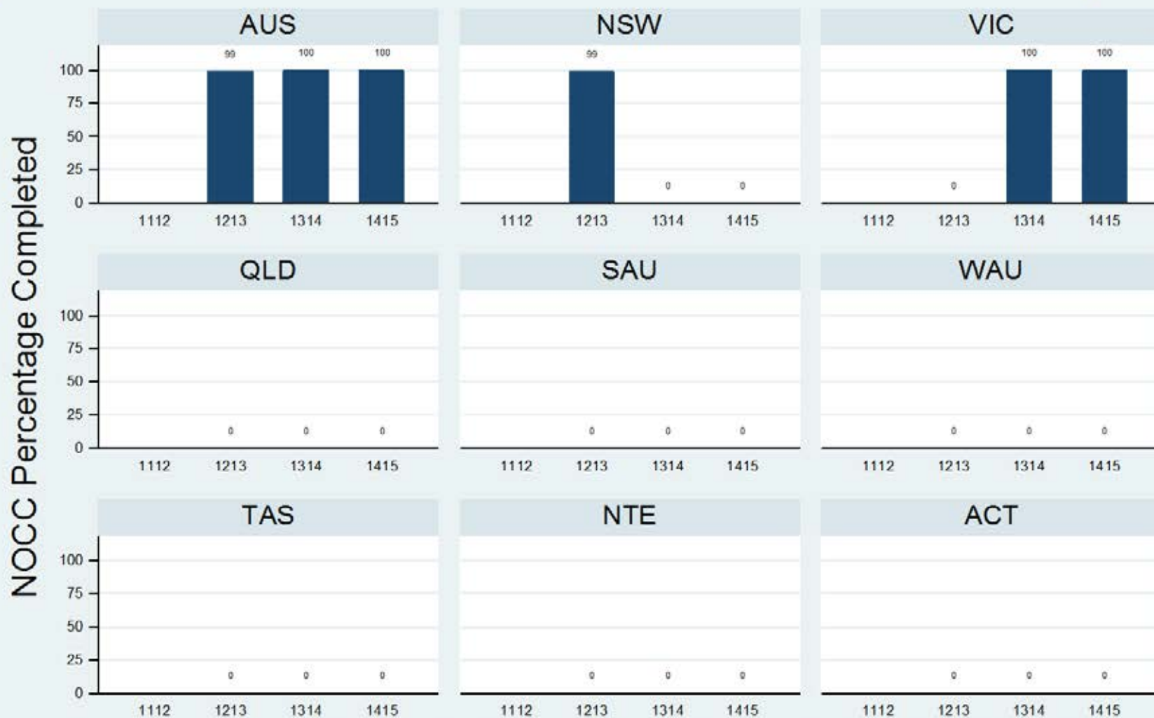
Figure 1.2.3.8.C: Child & Adolescent - Residential - Discharge - MHLS

Data Extract - 06 March 2016; Analysis & Reporting - 12 March 2016