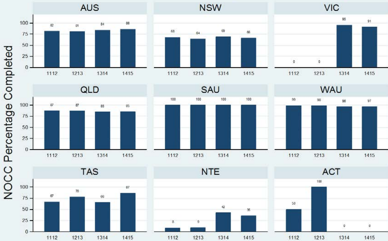
Figure 1.1.3.7.C: Child & Adolescent - Inpatient - Discharge - Diagnosis

Data Extract - 06 March 2016; Analysis & Reporting - 12 March 2016