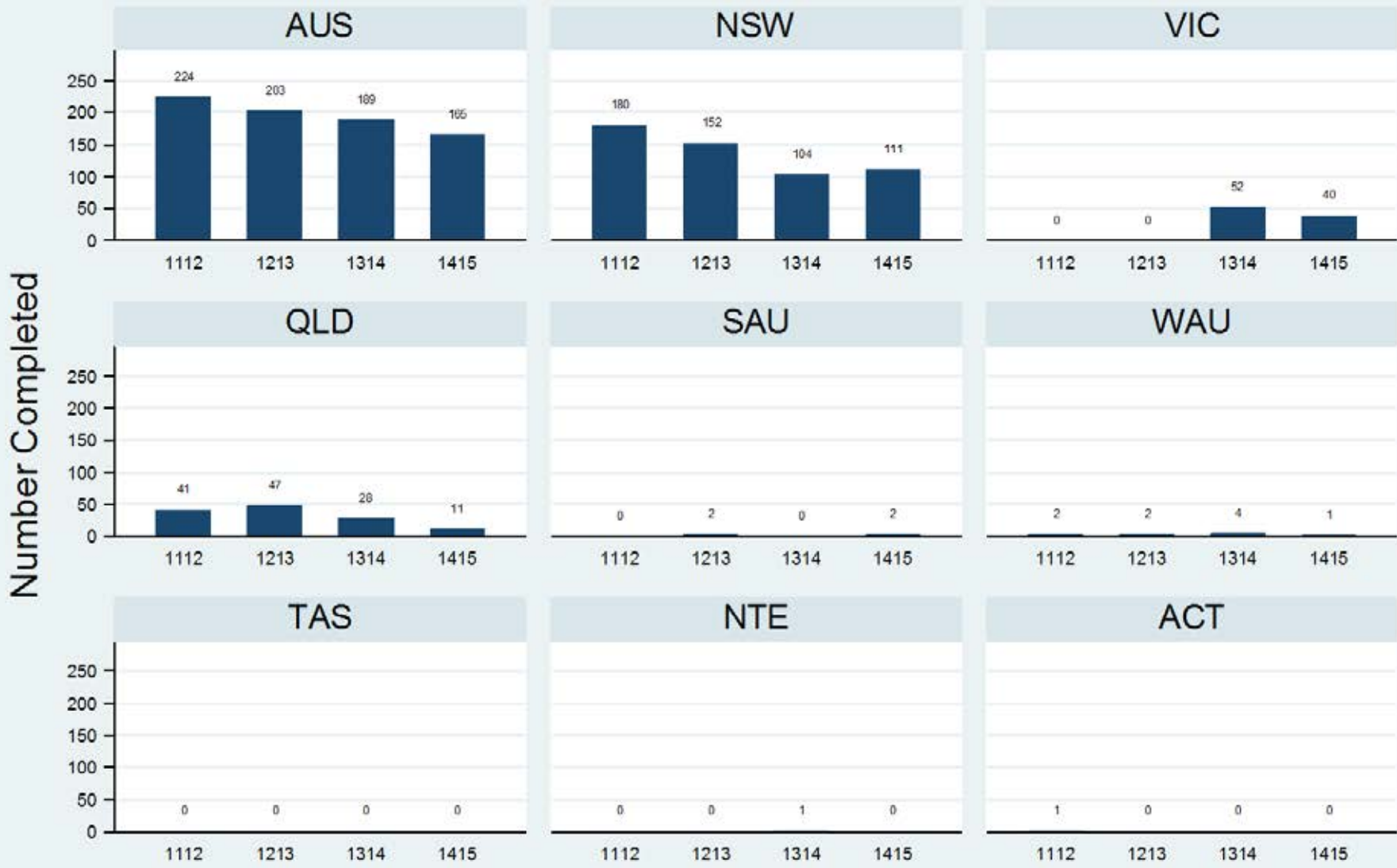
Figure 1.1.2.8.V: Child & Adolescent - Inpatient - Review - MHLS

Data Extract - 06 March 2016; Analysis & Reporting - 12 March 2016