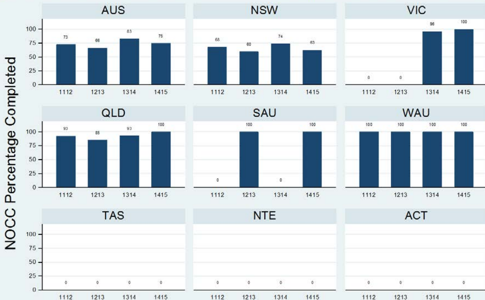
Figure 1.1.2.7.C: Child & Adolescent - Inpatient - Review - Diagnosis

Data Extract - 06 March 2016; Analysis & Reporting - 12 March 2016