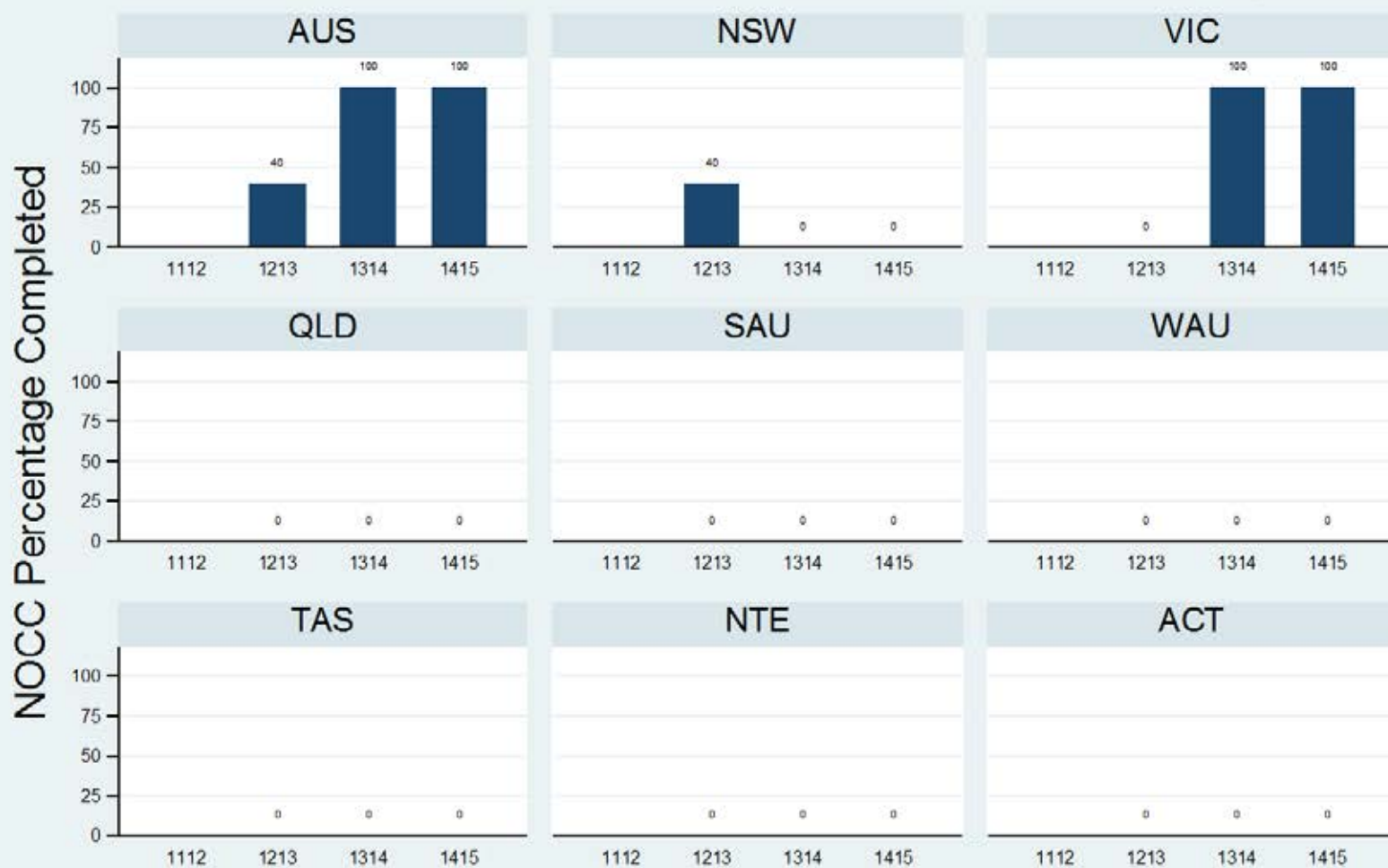
Figure 1.2.3.1.C: Child & Adolescent - Residential - Discharge - HoNOSCA

Data Extract - 06 March 2016; Analysis & Reporting - 12 March 2016