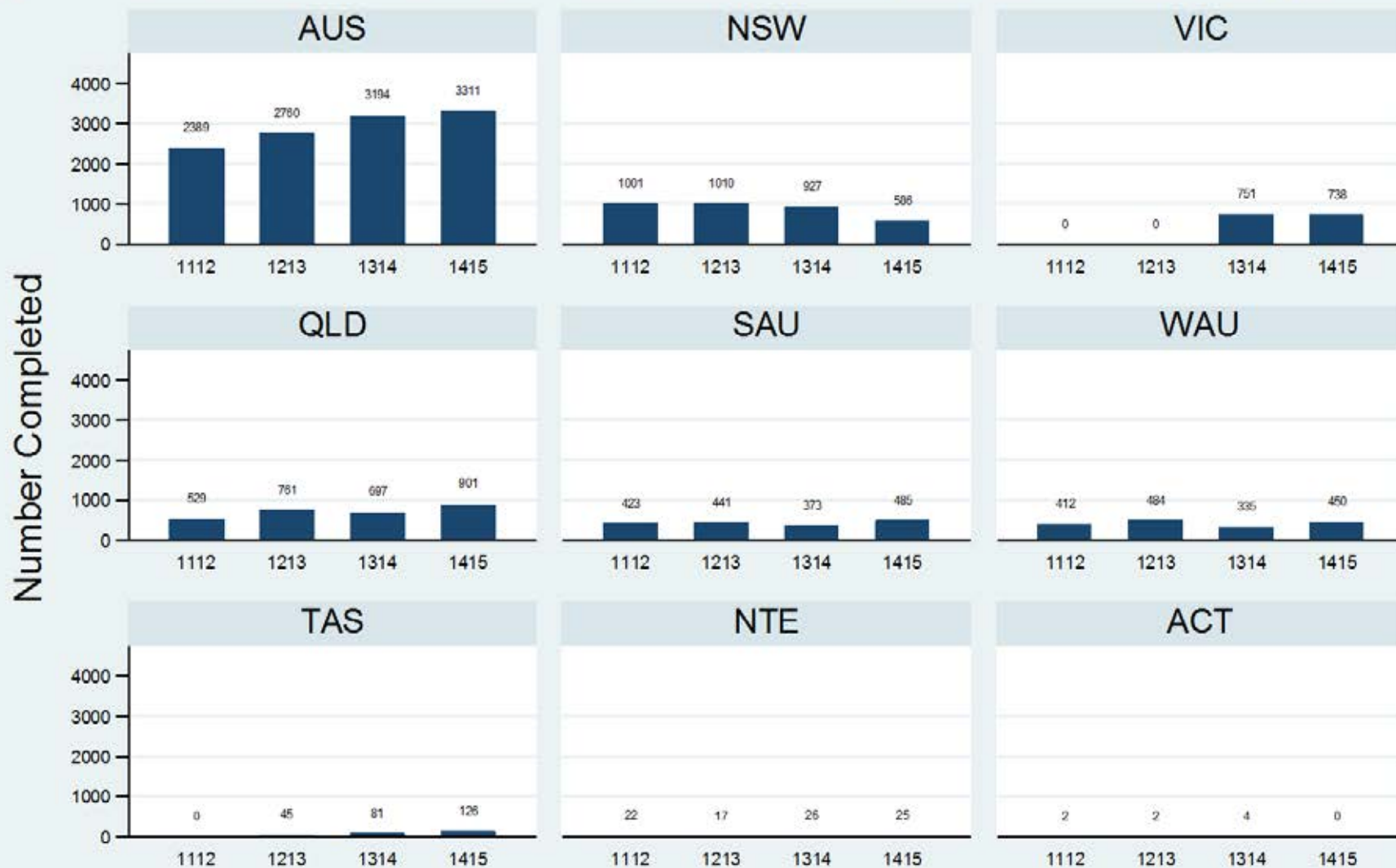
Figure 1.1.3.8.V: Child & Adolescent - Inpatient - Discharge - MHLS

Data Extract - 06 March 2016; Analysis & Reporting - 12 March 2016