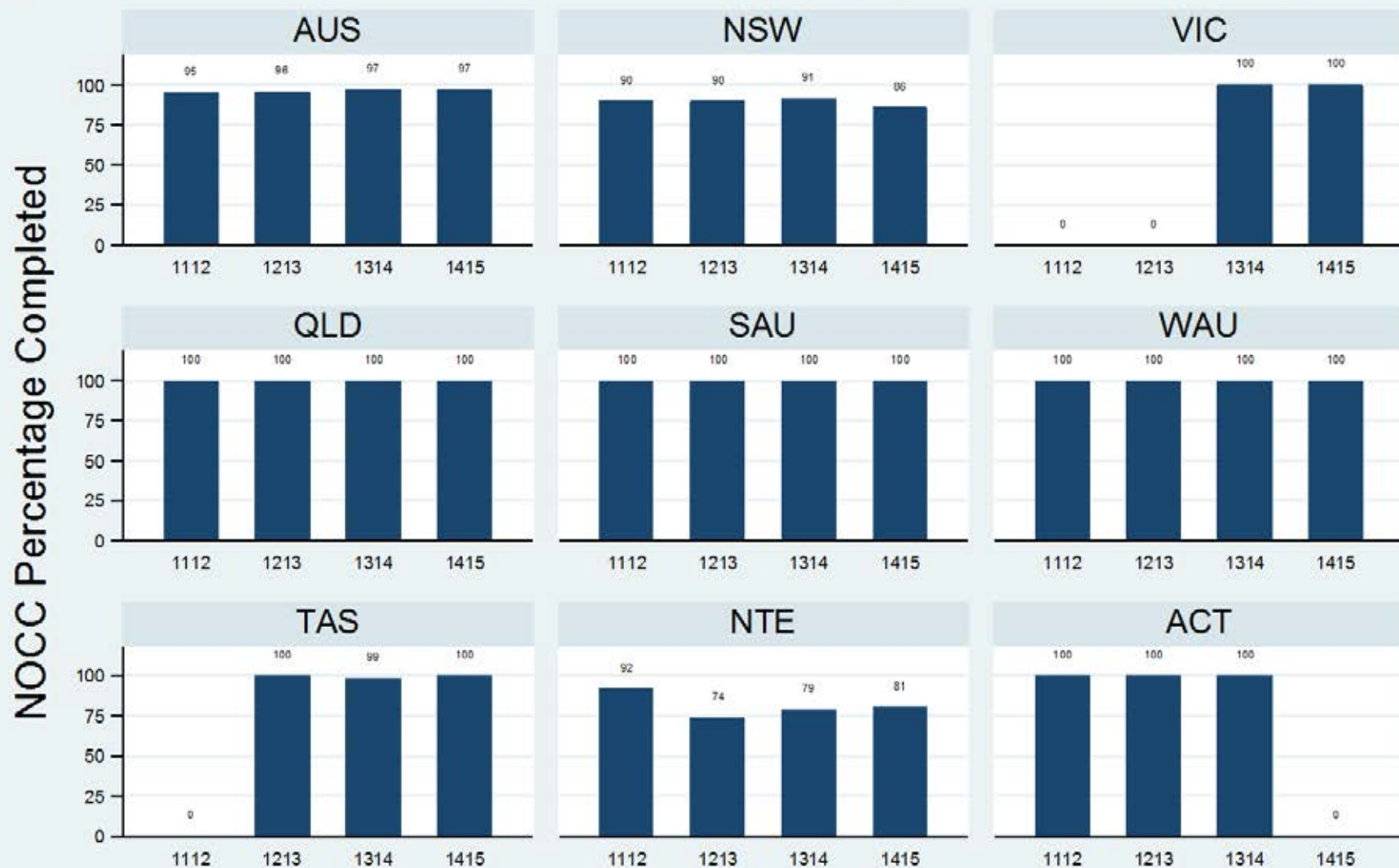
Figure 1.1.3.8.C: Child & Adolescent - Inpatient - Discharge - MHLS

Data Extract - 06 March 2016; Analysis & Reporting - 12 March 2016