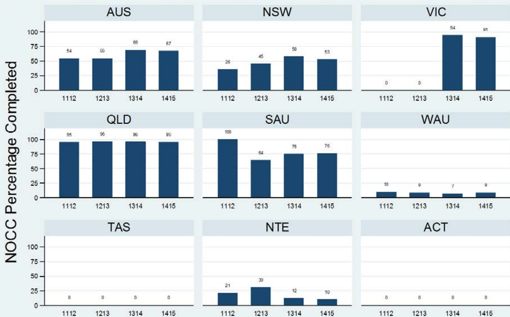
Figure 1.1.3.3.C: Child & Adolescent - Inpatient - Discharge - FIHS

Data Extract - 06 March 2016; Analysis & Reporting - 12 March 2016