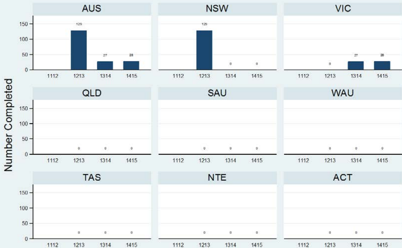
Figure 1.2.1.1.V: Child & Adolescent - Residential - Admission - HoNOSCA

Data Extract - 06 March 2016; Analysis & Reporting - 12 March 2016