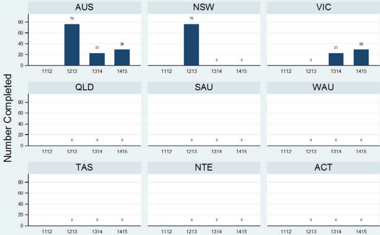
Figure 1.2.3.7.V: Child & Adolescent - Residential - Discharge - Diagnosis

Data Extract - 06 March 2016; Analysis & Reporting - 12 March 2016