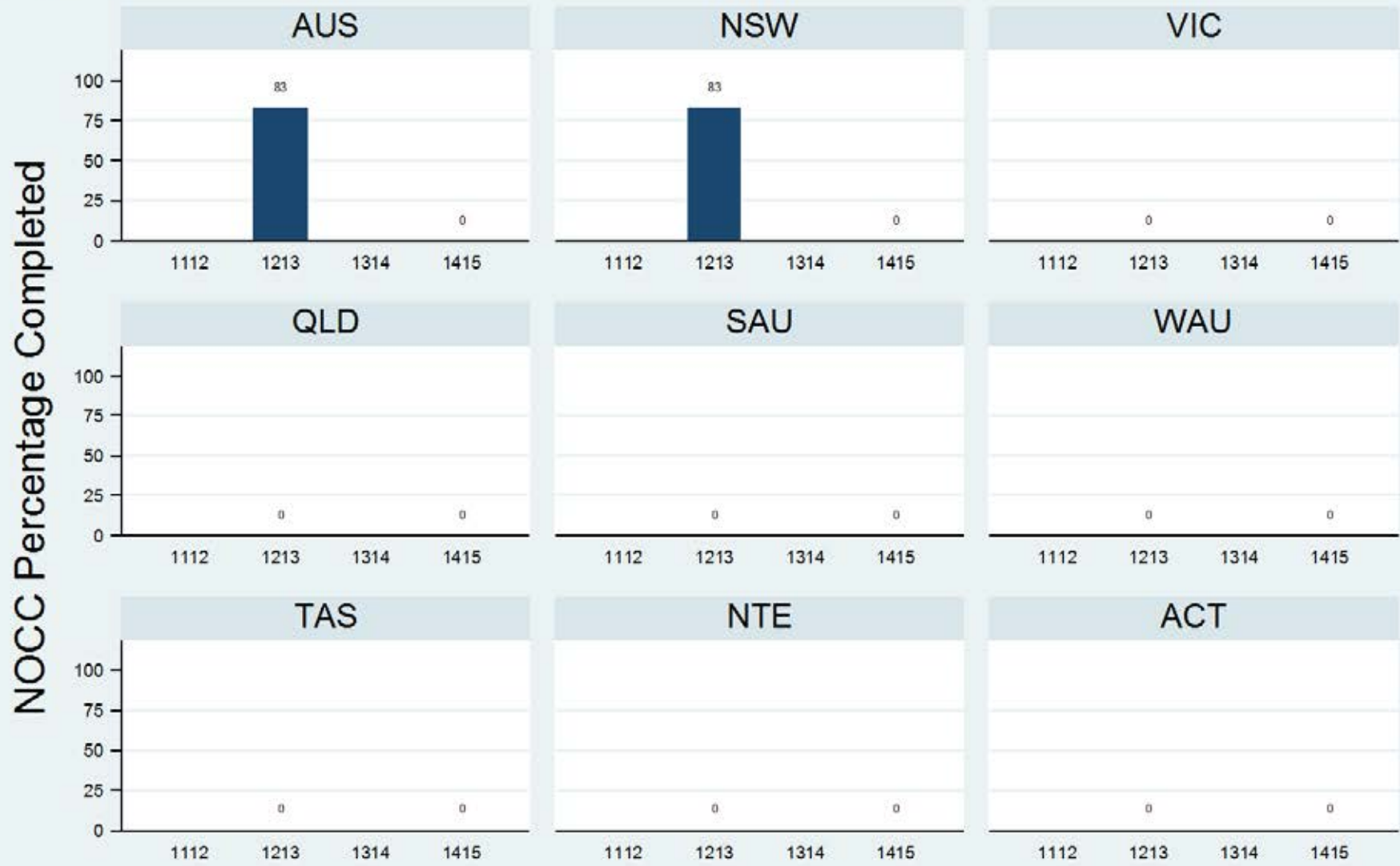
Figure 1.2.2.3.C: Child & Adolescent - Residential - Review - FIHS

Data Extract - 06 March 2016; Analysis & Reporting - 12 March 2016