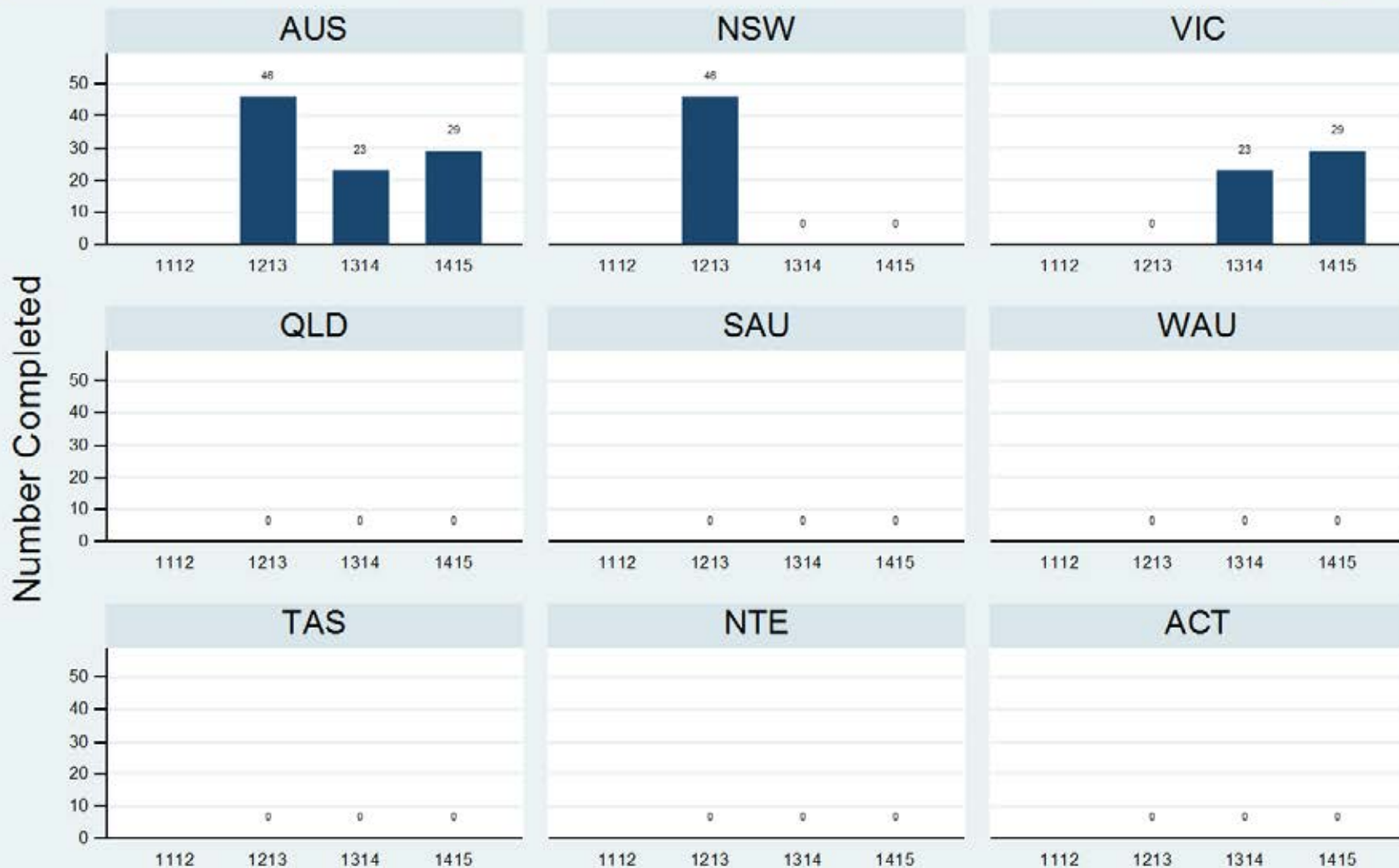
Figure 1.2.3.3.V: Child & Adolescent - Residential - Discharge - FIHS

Data Extract - 06 March 2016; Analysis & Reporting - 12 March 2016