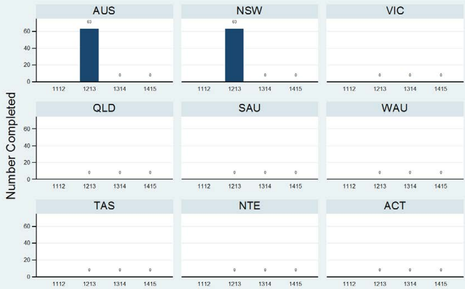
Figure 1.2.1.5.V: Child & Adolescent - Residential - Admission - SDQ-PY

Data Extract - 06 March 2016; Analysis & Reporting - 12 March 2016