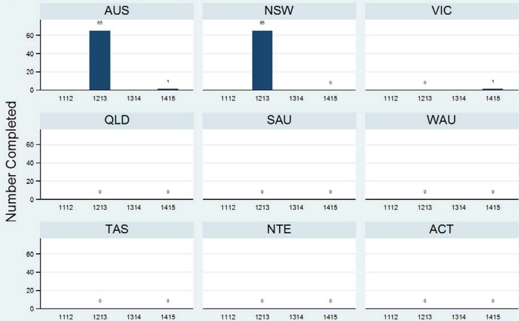
Figure 1.2.2.8.V: Child & Adolescent - Residential - Review - MHLS

Data Extract - 06 March 2016; Analysis & Reporting - 12 March 2016