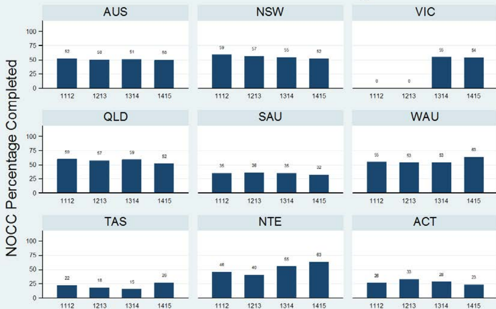
Figure 1.3.1.6.C: Child & Adolescent - Ambulatory - Admission - SDQ-YR

Data Extract - 06 March 2016; Analysis & Reporting - 12 March 2016