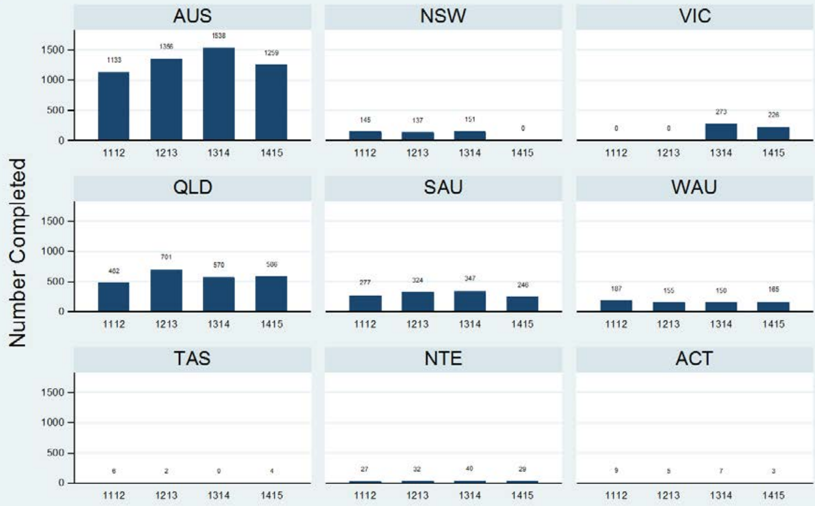
Figure 1.3.2.4.V: Child & Adolescent - Ambulatory - Review - SDQ-PC

Data Extract - 06 March 2016; Analysis & Reporting - 12 March 2016