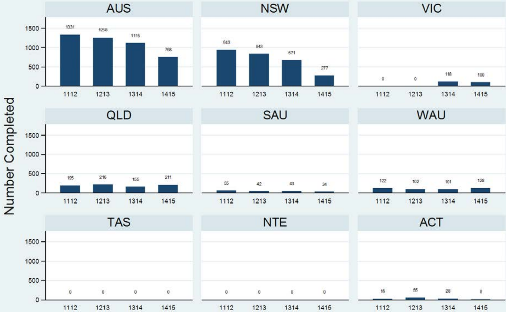
Figure 3.1.2.3.V: Older Persons - Inpatient - Review - RUG-ADL

Data Extract - 06 March 2016; Analysis & Reporting - 12 March 2016