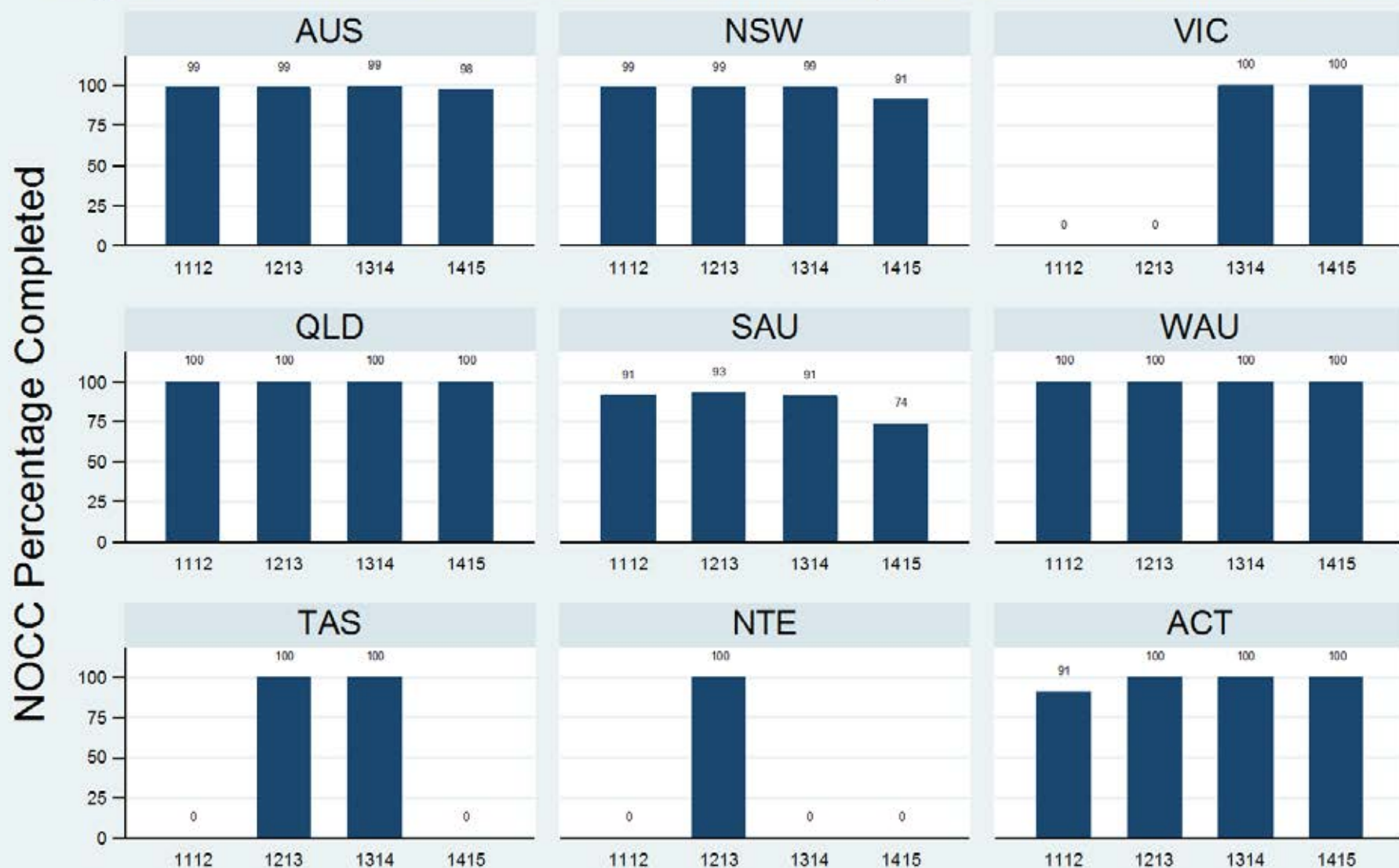
Figure 3.1.2.7.C: Older Persons - Inpatient - Review - MHLS

Data Extract - 06 March 2016; Analysis & Reporting - 12 March 2016