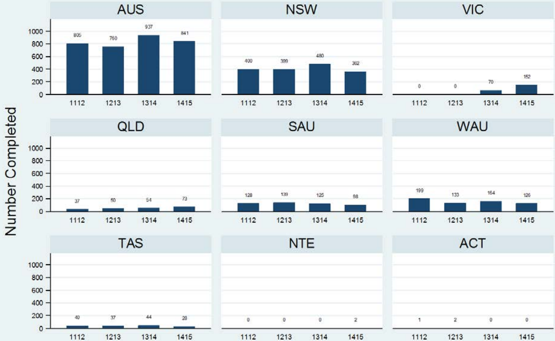
Figure 3.3.3.4.V: Older Persons - Ambulatory - Discharge - CSR

Data Extract - 06 March 2016; Analysis & Reporting - 12 March 2016