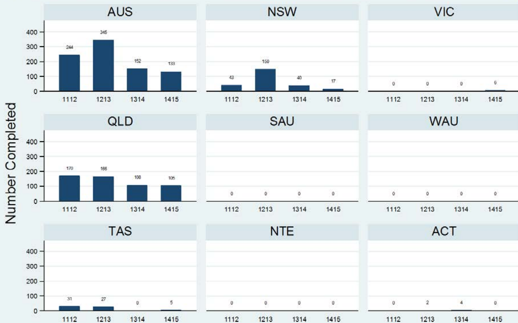
Figure 3.2.2.5.V: Older Persons - Residential - Review - Diagnosis

Data Extract - 06 March 2016; Analysis & Reporting - 12 March 2016