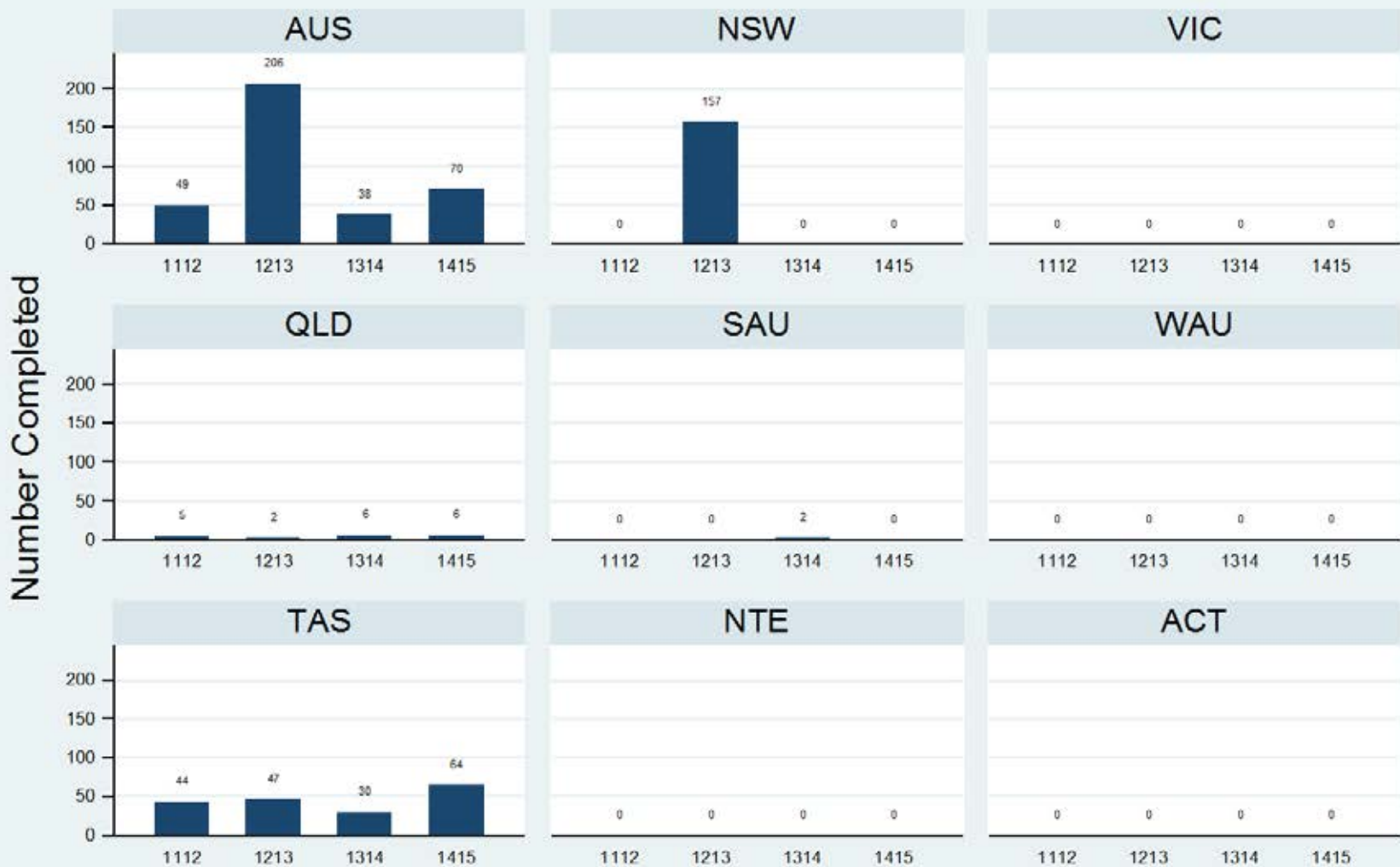
Figure 3.2.3.1.V: Older Persons - Residential - Discharge - HoNOS65+

Data Extract - 06 March 2016; Analysis & Reporting - 12 March 2016