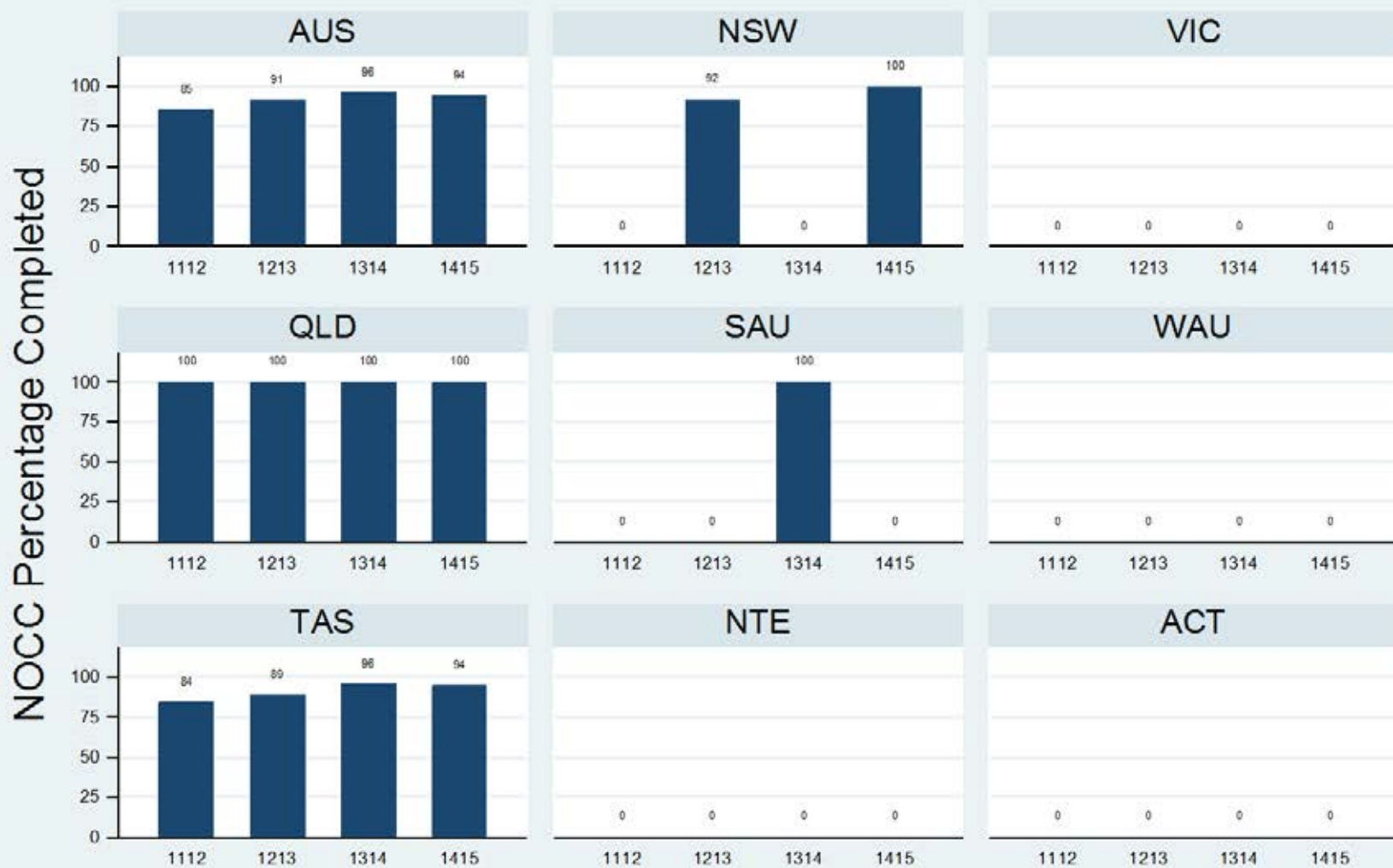
Figure 3.2.1.1.C: Older Persons - Residential - Admission - HoNOS65+

Data Extract - 06 March 2016; Analysis & Reporting - 12 March 2016