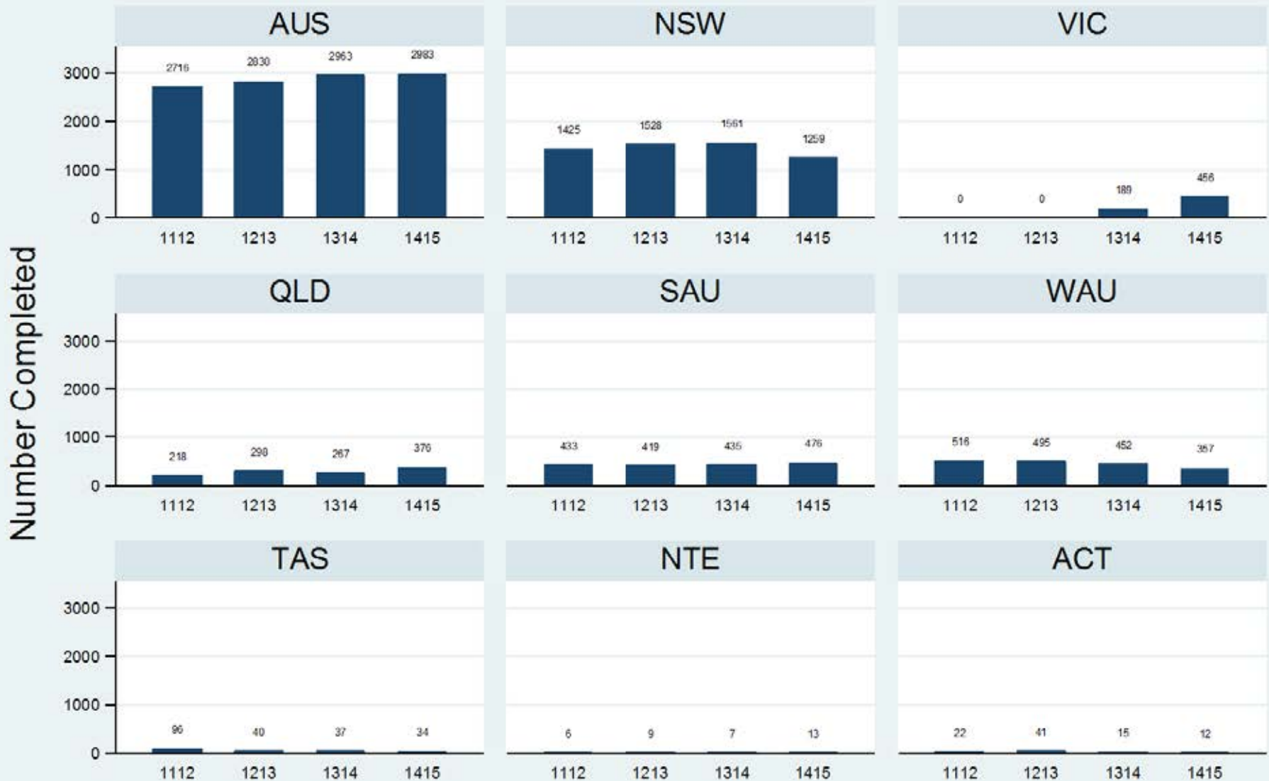
Figure 3.3.2.4.V: Older Persons - Ambulatory - Review - CSR

Data Extract - 06 March 2016; Analysis & Reporting - 12 March 2016