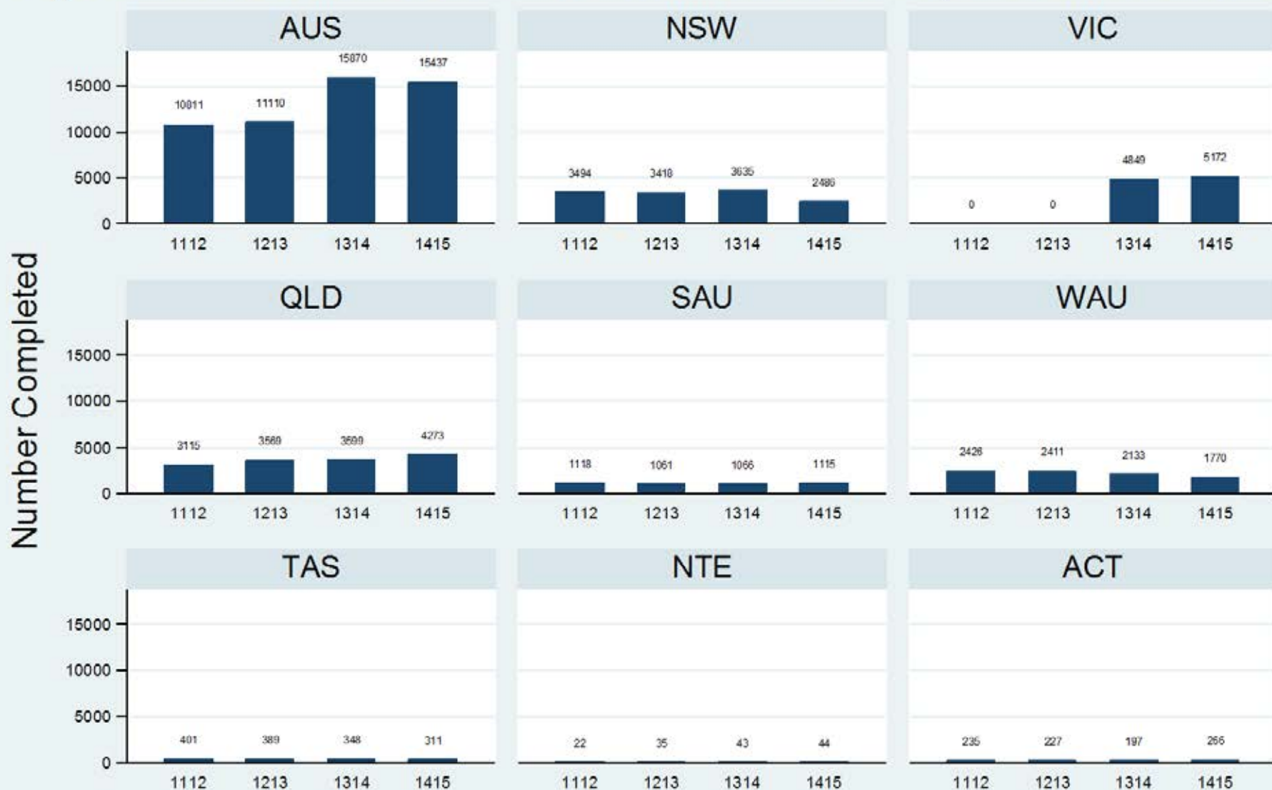
Figure 3.3.2.7.V: Older Persons - Ambulatory - Review - MHLS

Data Extract - 06 March 2016; Analysis & Reporting - 12 March 2016