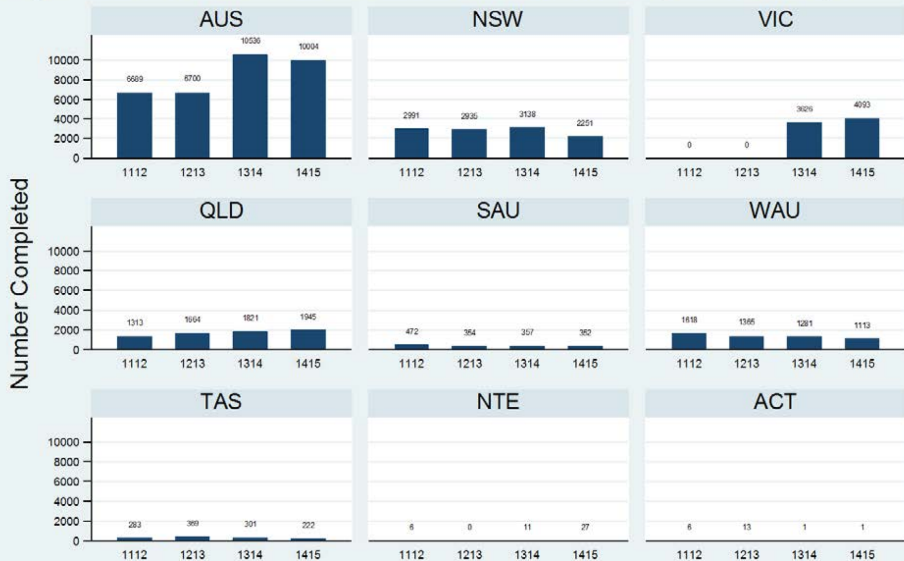
Figure 3.3.3.6.V: Older Persons - Ambulatory - Discharge - FOC

Data Extract - 06 March 2016; Analysis & Reporting - 12 March 2016