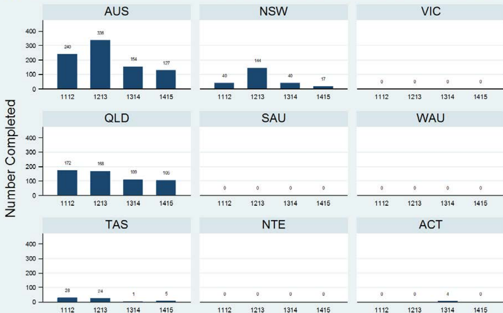
Figure 3.2.2.3.V: Older Persons - Residential - Review - RUG-ADL

Data Extract - 06 March 2016; Analysis & Reporting - 12 March 2016