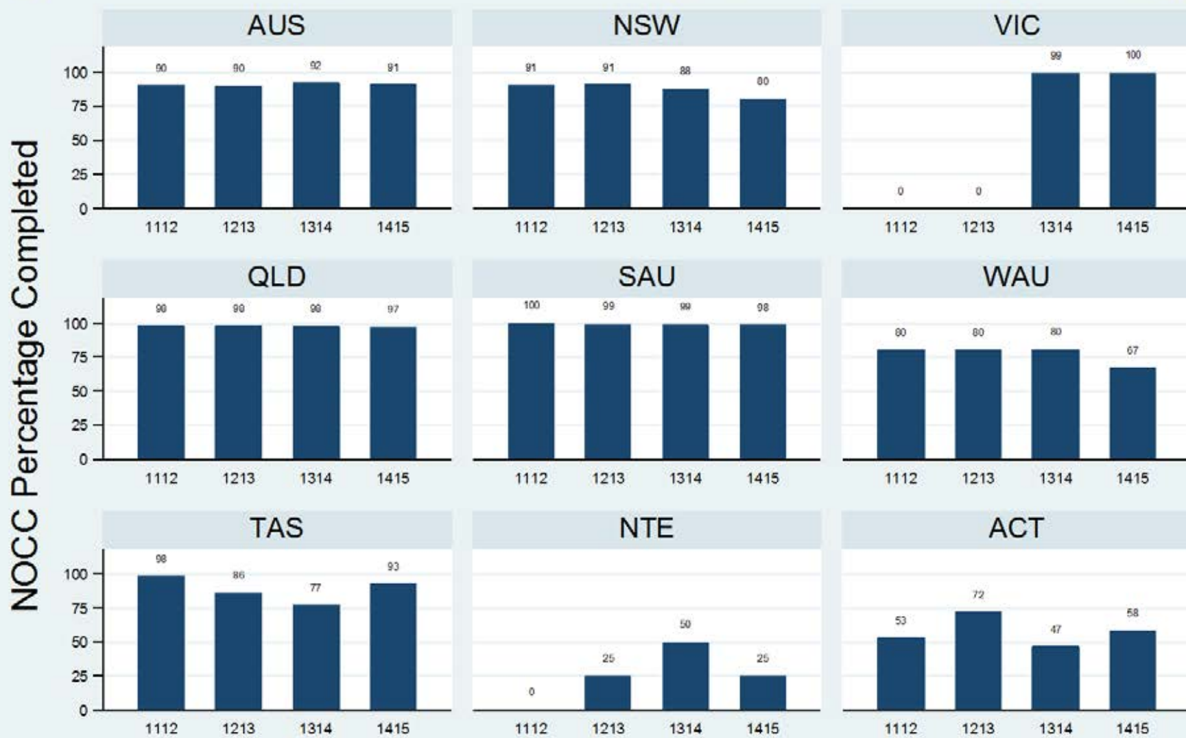
Figure 3.1.3.5.C: Older Persons - Inpatient - Discharge - Diagnosis

Data Extract - 06 March 2016; Analysis & Reporting - 12 March 2016