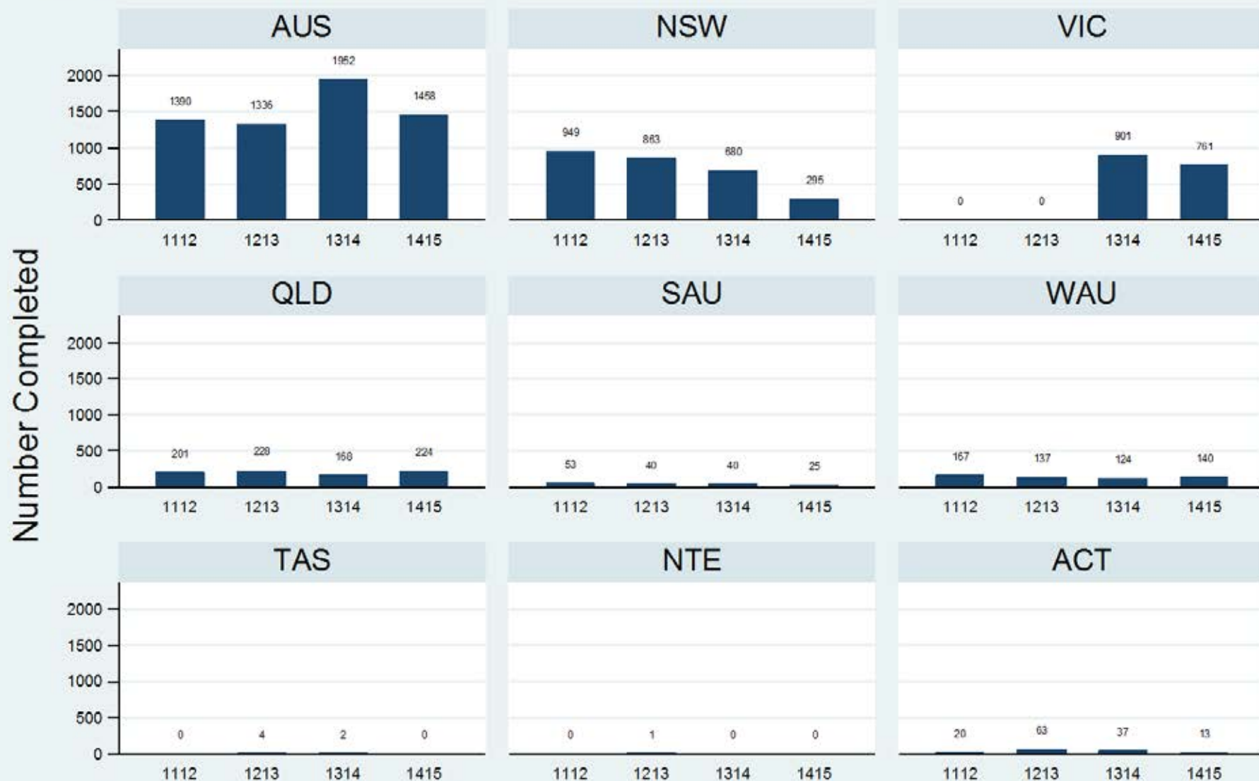
Figure 3.1.2.7.V: Older Persons - Inpatient - Review - MHLS

Data Extract - 06 March 2016; Analysis & Reporting - 12 March 2016