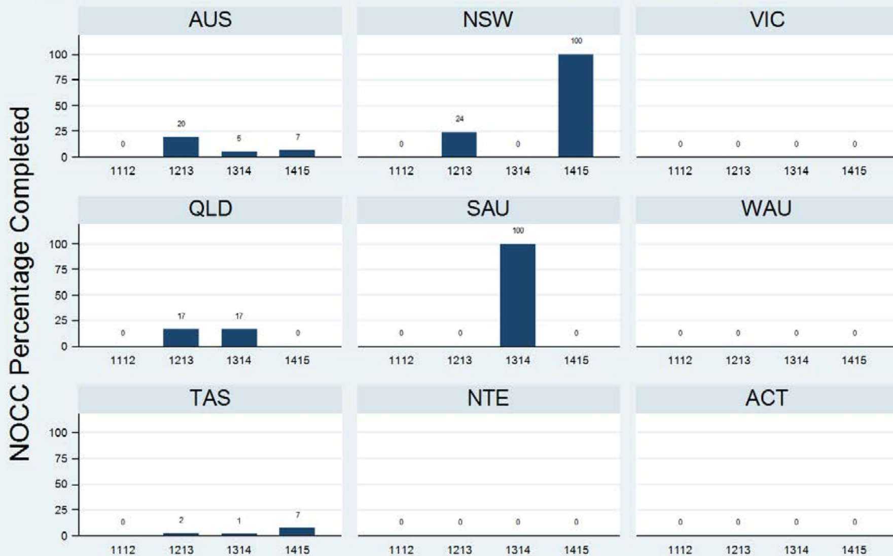
Figure 3.2.1.4.C: Older Persons - Residential - Admission - CSR

Data Extract - 06 March 2016; Analysis & Reporting - 12 March 2016