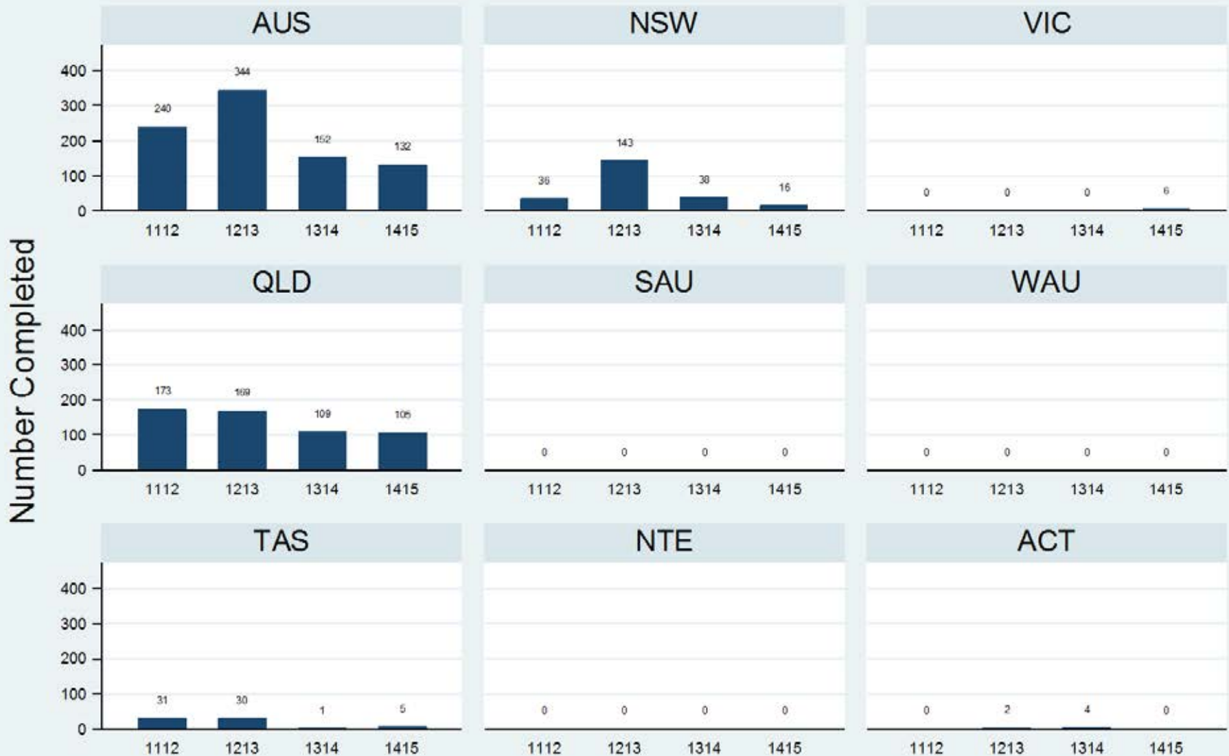
Figure 3.2.2.7.V: Older Persons - Residential - Review - MHLS

Data Extract - 06 March 2016; Analysis & Reporting - 12 March 2016