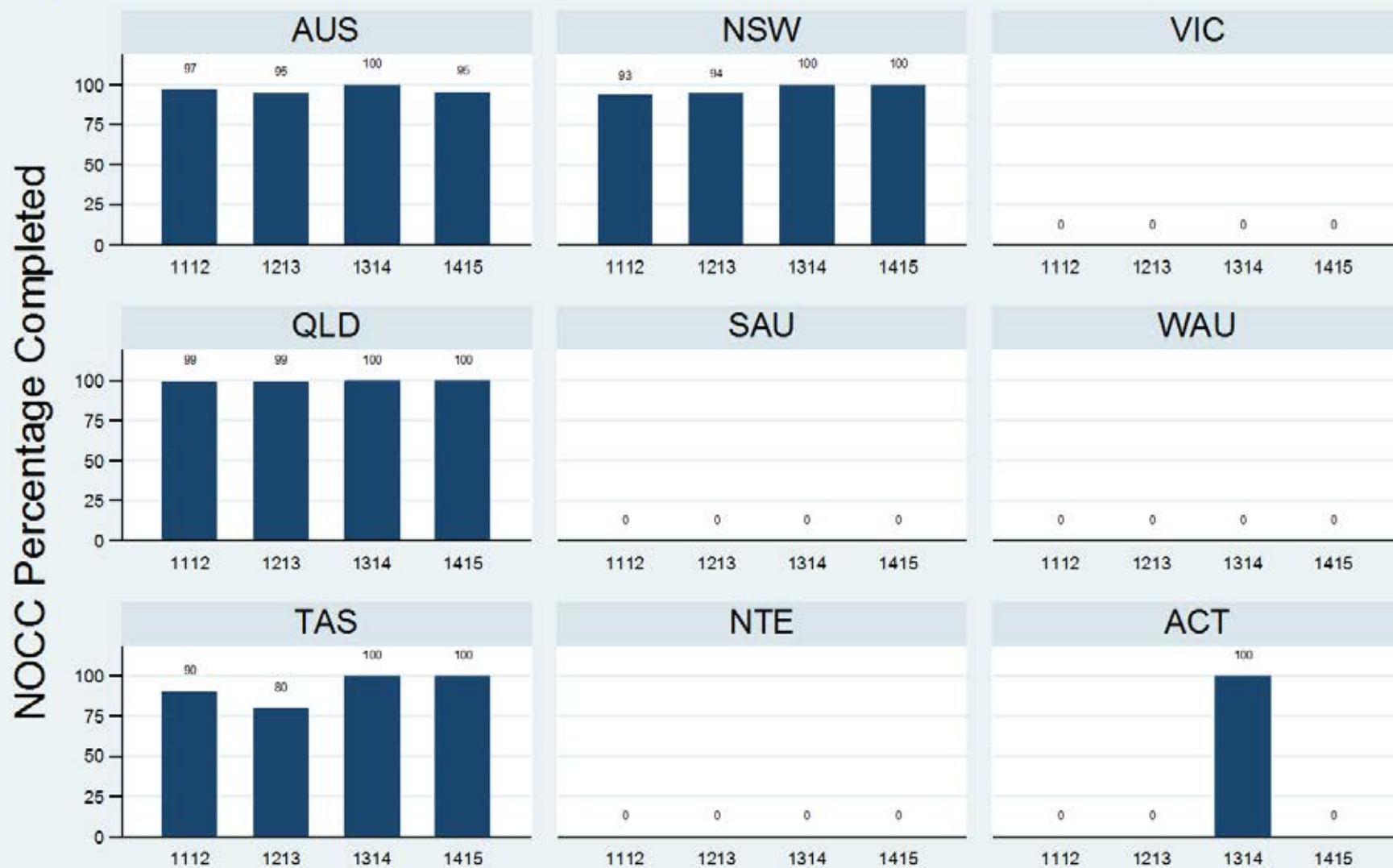
Figure 3.2.2.3.C: Older Persons - Residential - Review - RUG-ADL

Data Extract - 06 March 2016; Analysis & Reporting - 12 March 2016