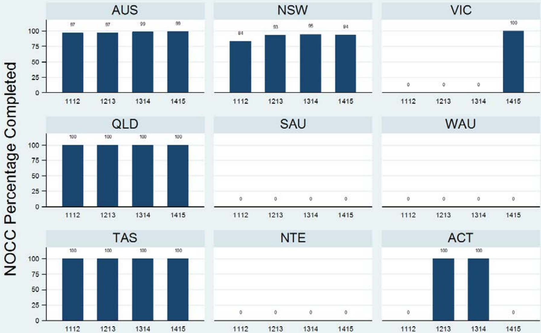
Figure 3.2.2.7.C: Older Persons - Residential - Review - MHLS

Data Extract - 06 March 2016; Analysis & Reporting - 12 March 2016