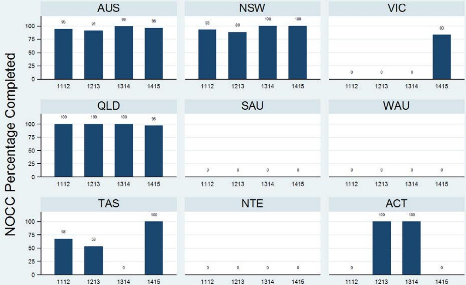
Figure 3.2.2.2.C: Older Persons - Residential - Review - LSP-16

Data Extract - 06 March 2016; Analysis & Reporting - 12 March 2016