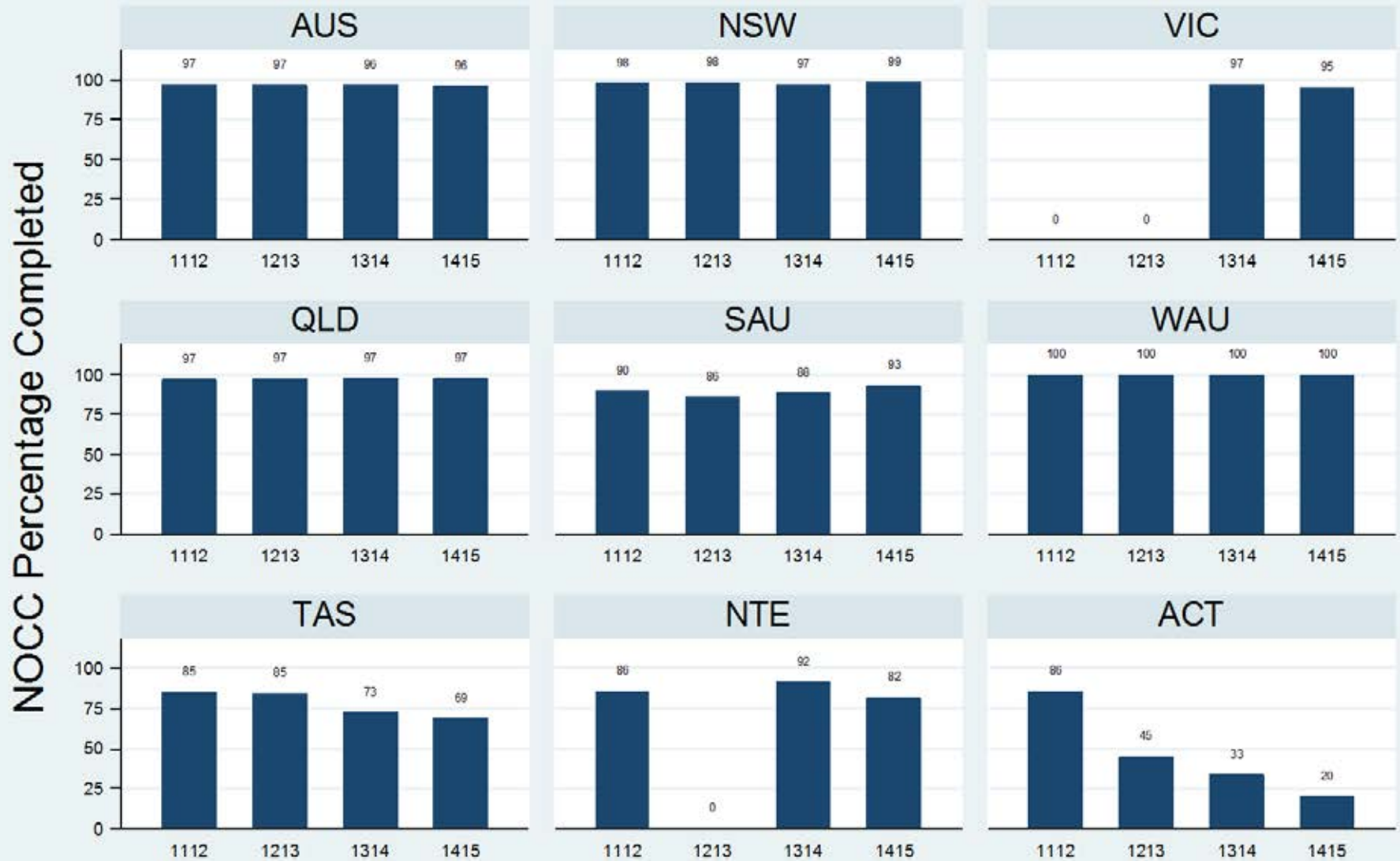
Figure 3.3.3.6.C: Older Persons - Ambulatory - Discharge - FOC

Data Extract - 06 March 2016; Analysis & Reporting - 12 March 2016