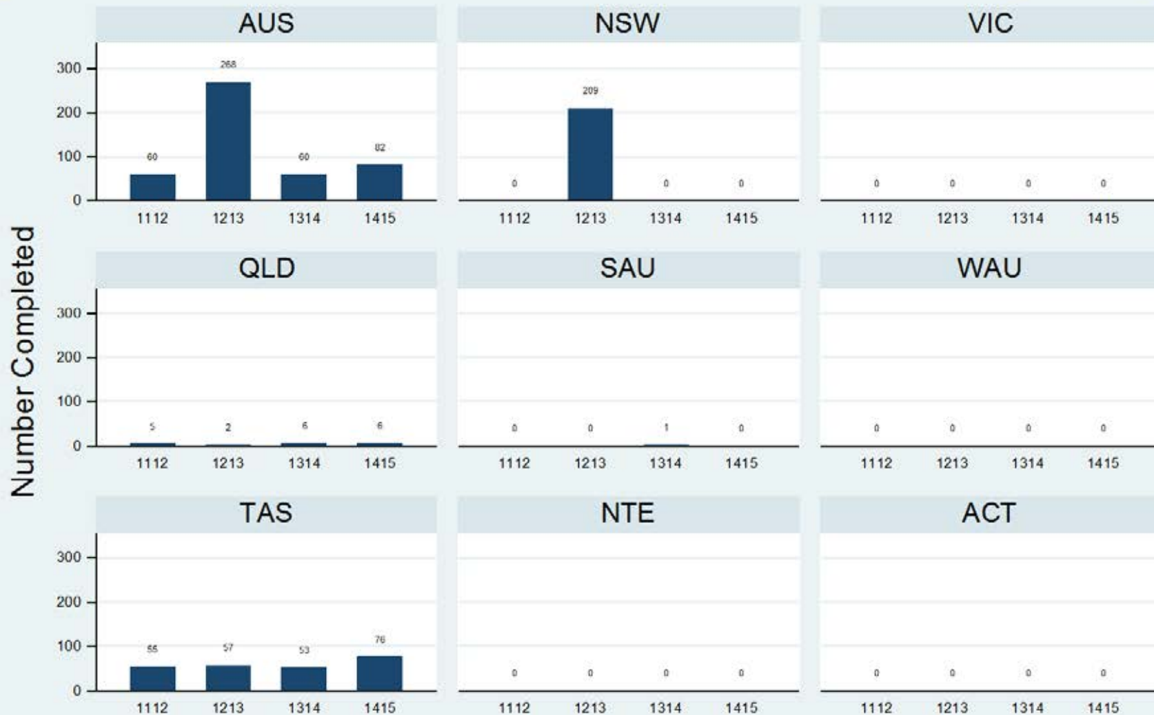
Figure 3.2.3.5.V: Older Persons - Residential - Discharge - Diagnosis

Data Extract - 06 March 2016; Analysis & Reporting - 12 March 2016