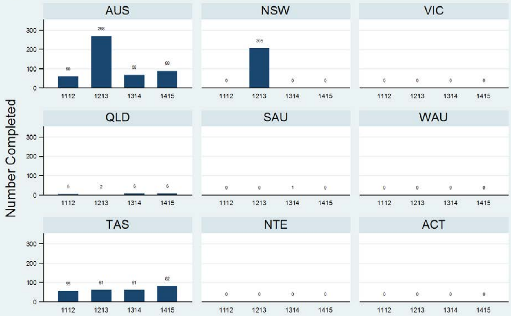
Figure 3.2.3.7.V: Older Persons - Residential - Discharge - MHLS

Data Extract - 06 March 2016; Analysis & Reporting - 12 March 2016