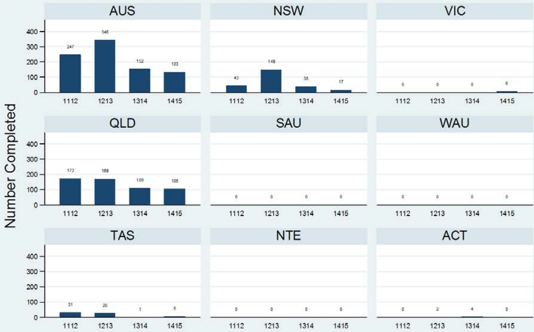
Figure 3.2.2.1.V: Older Persons - Residential - Review - HoNOS65+

Data Extract - 06 March 2016; Analysis & Reporting - 12 March 2016