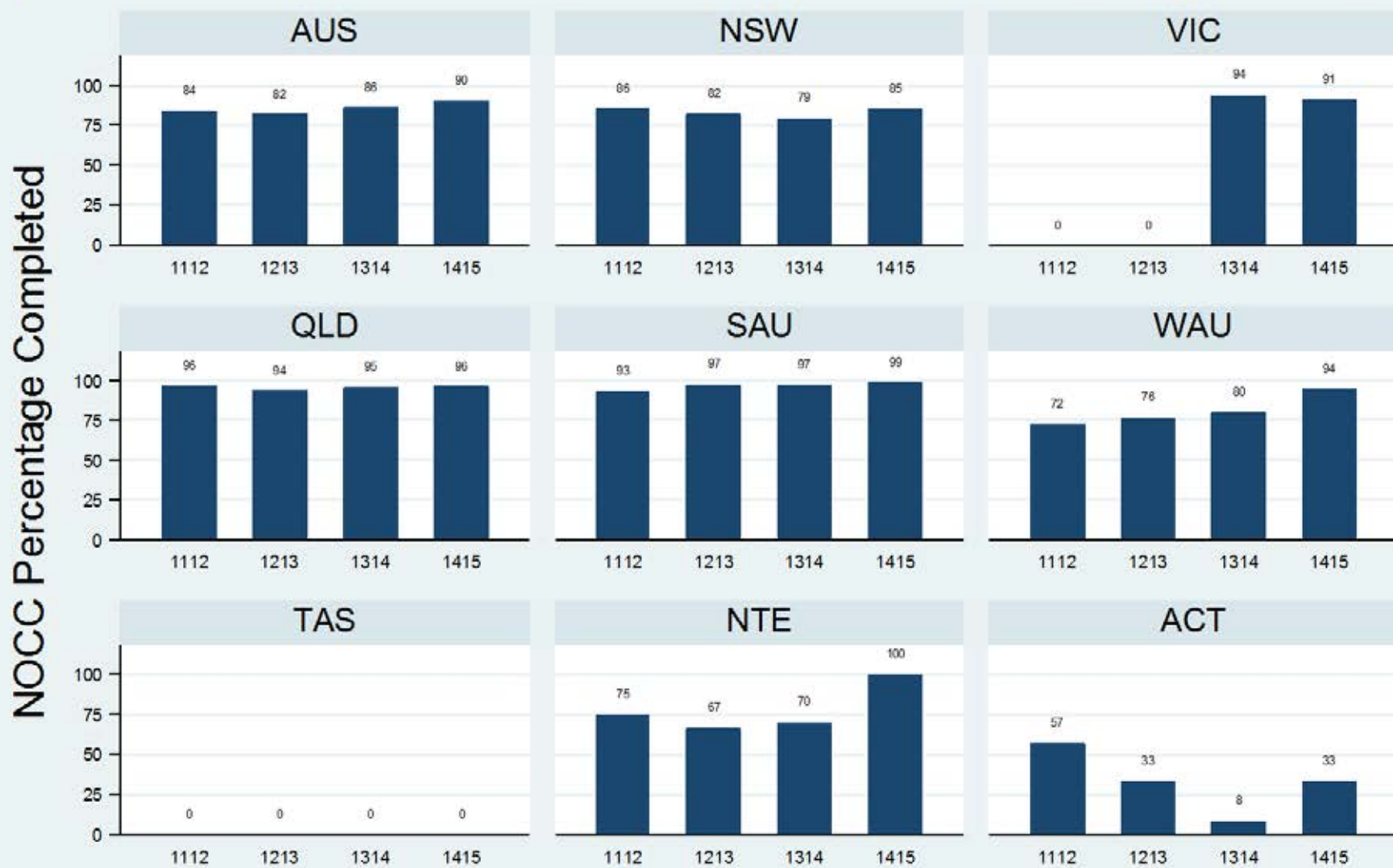
Figure 3.1.1.3.C: Older Persons - Inpatient - Discharge - RUG-ADL

Data Extract - 06 March 2016; Analysis & Reporting - 12 March 2016