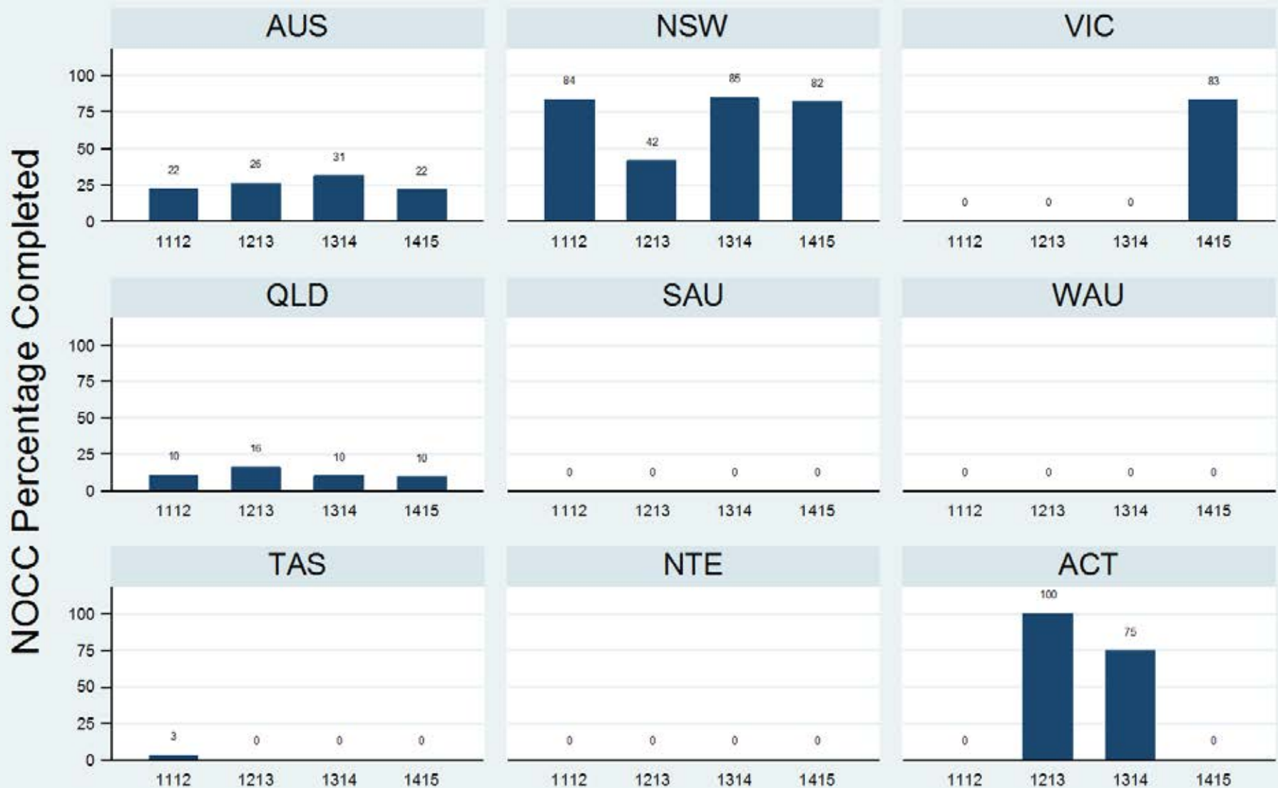
Figure 3.2.2.4.C: Older Persons - Residential - Review - CSR

Data Extract - 06 March 2016; Analysis & Reporting - 12 March 2016