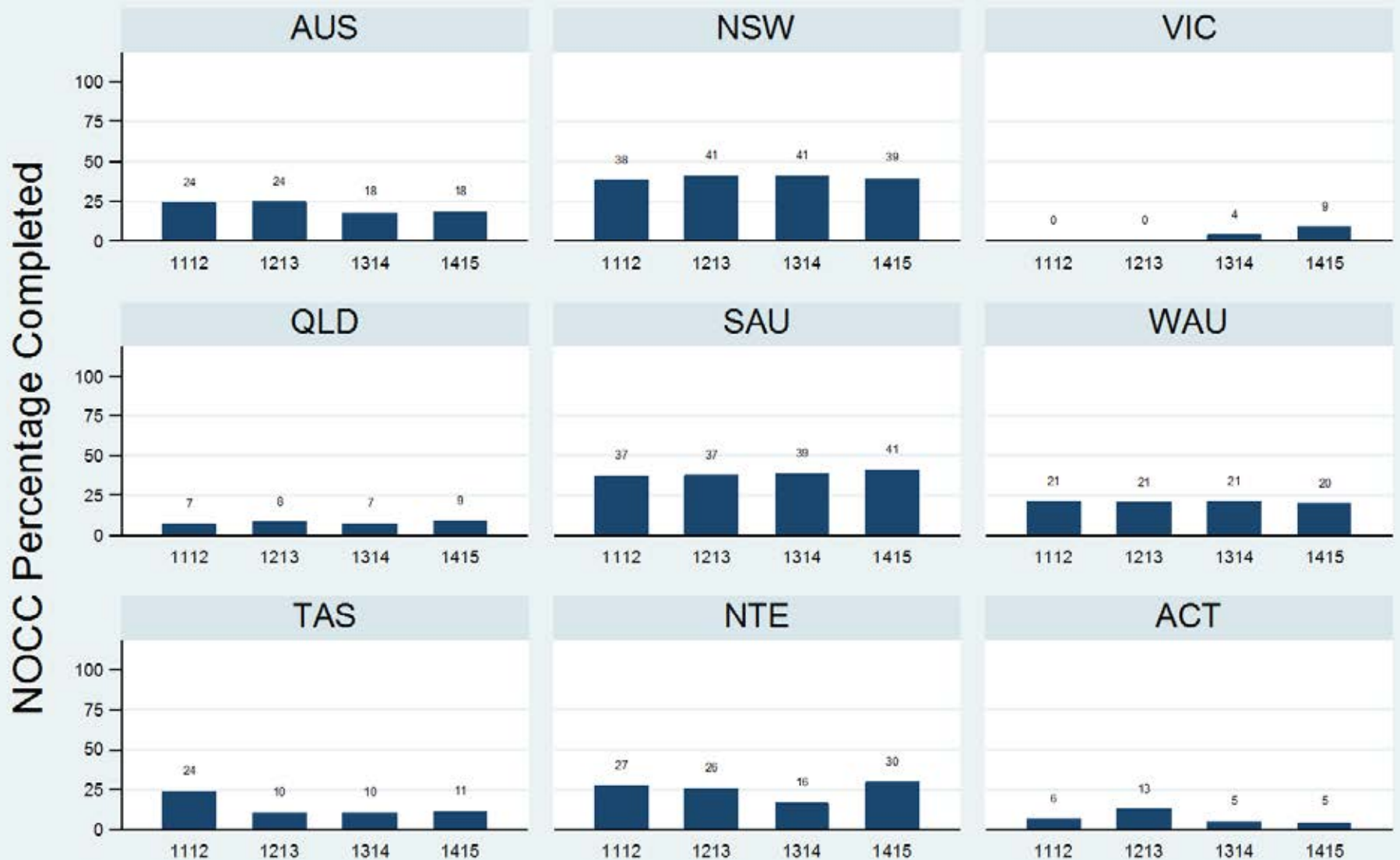
Figure 3.3.2.4.C: Older Persons - Ambulatory - Review - CSR

Data Extract - 06 March 2016; Analysis & Reporting - 12 March 2016