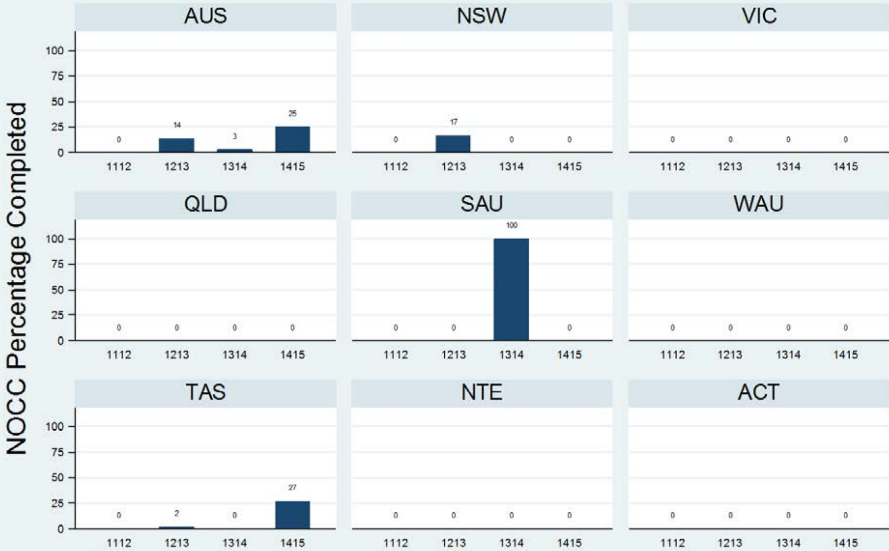
Figure 3.2.3.4.C: Older Persons - Residential - Discharge - CSR

Data Extract - 06 March 2016; Analysis & Reporting - 12 March 2016