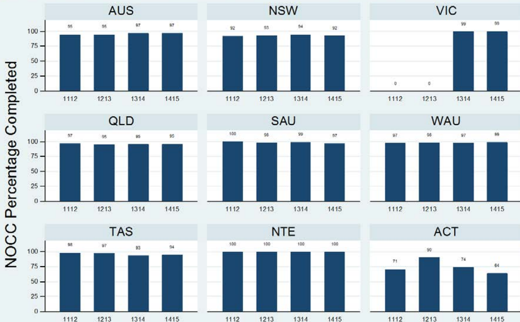
Figure 3.1.3.1.C: Older Persons - Inpatient - Discharge - HoNOS65+

Data Extract - 06 March 2016; Analysis & Reporting - 12 March 2016