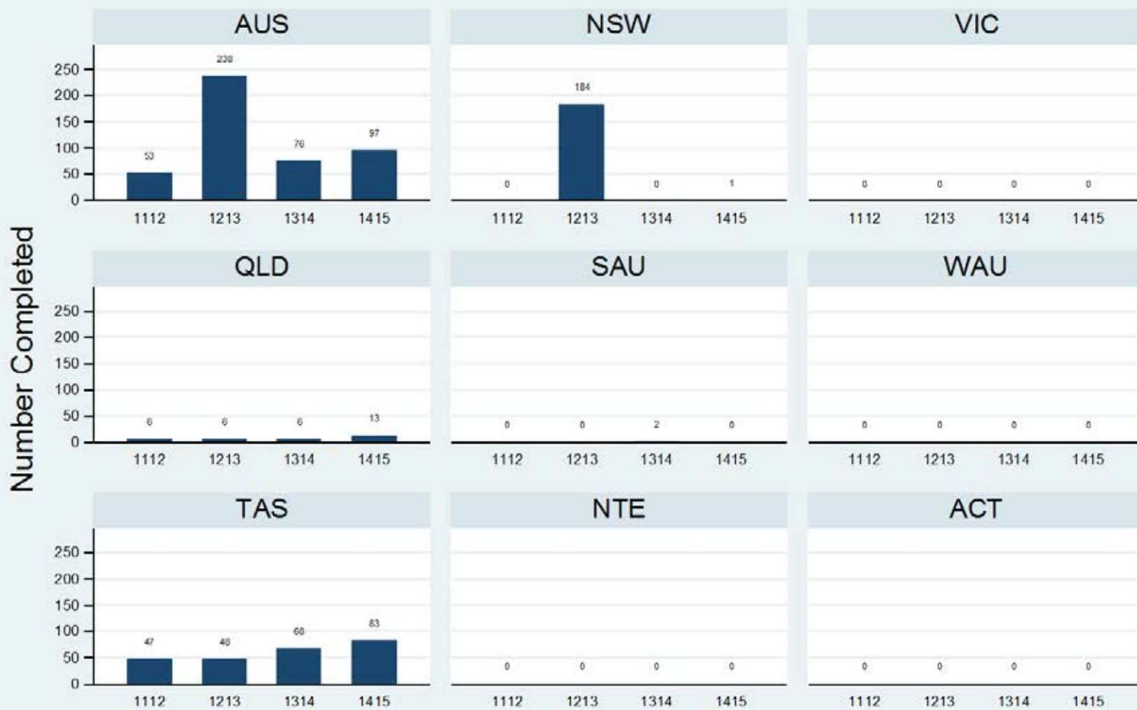
Figure 3.2.1.1.V: Older Persons - Residential - Admission - HoNOS65+

Data Extract - 06 March 2016; Analysis & Reporting - 12 March 2016