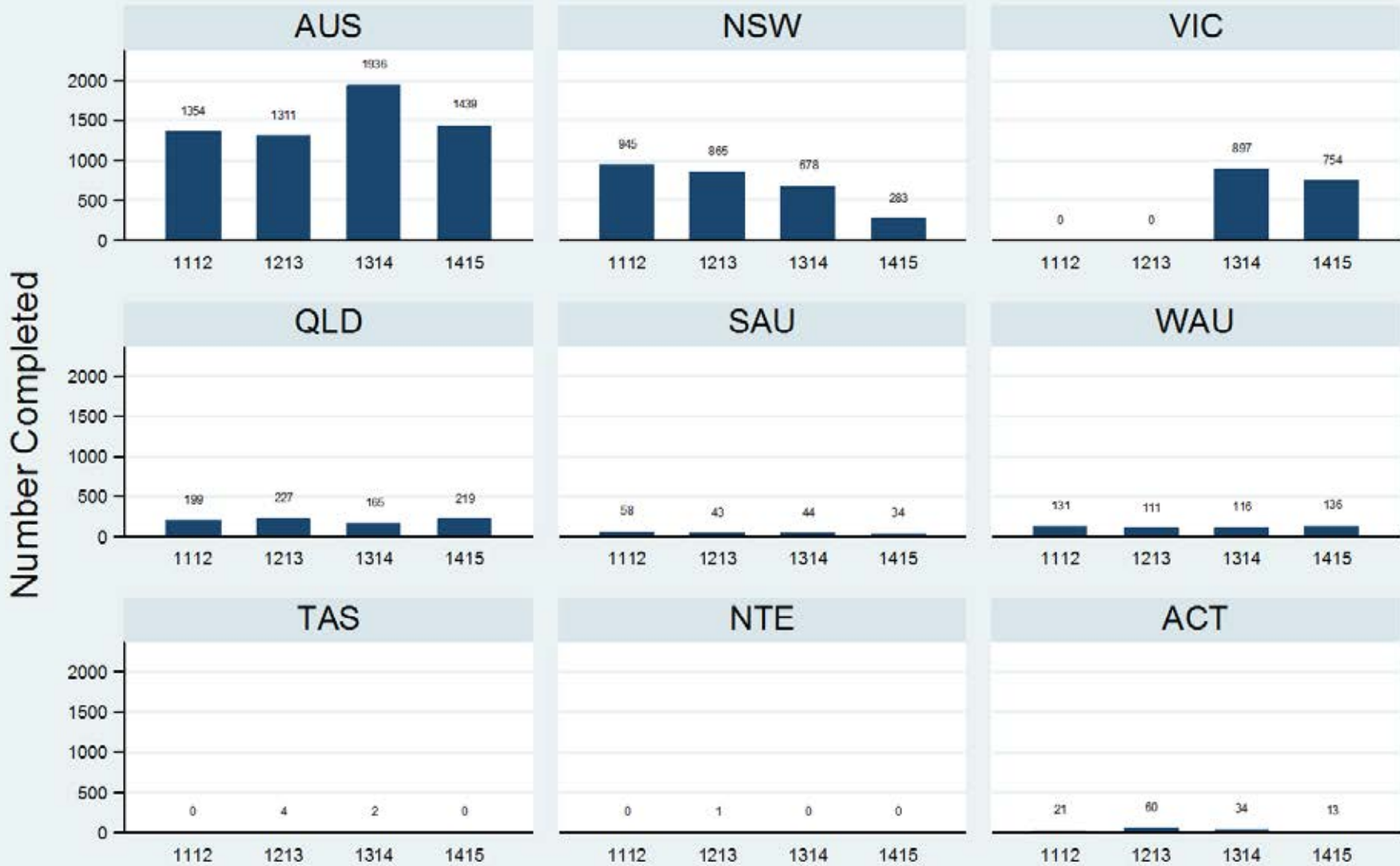
Figure 3.1.2.1.V: Older Persons - Inpatient - Review - HoNOS65+

Data Extract - 06 March 2016; Analysis & Reporting - 12 March 2016