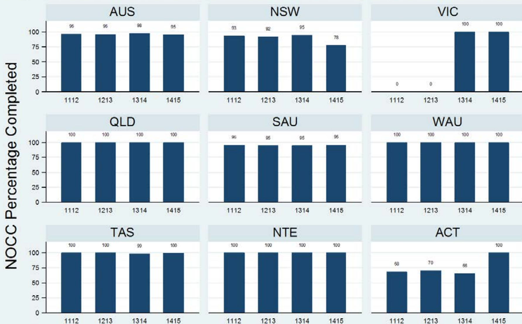
Figure 3.3.2.7.C: Older Persons - Ambulatory - Review - MHLS

Data Extract - 06 March 2016; Analysis & Reporting - 12 March 2016