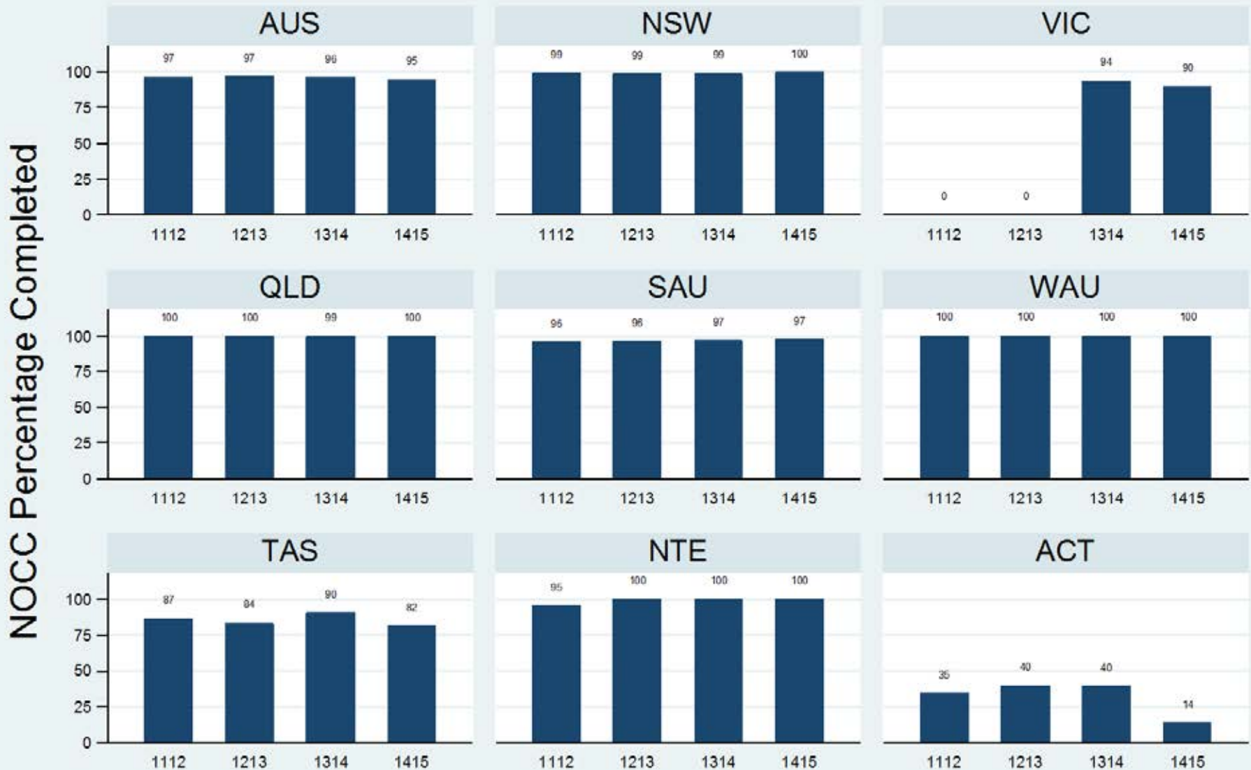
Figure 3.3.2.6.C: Older Persons - Ambulatory - Review - FOC

Data Extract - 06 March 2016; Analysis & Reporting - 12 March 2016