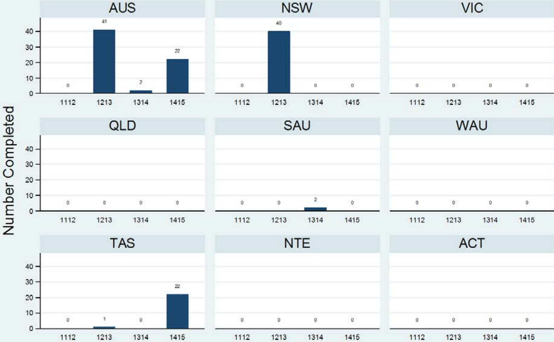
Figure 3.2.3.4.V: Older Persons - Residential - Discharge - CSR

Data Extract - 06 March 2016; Analysis & Reporting - 12 March 2016