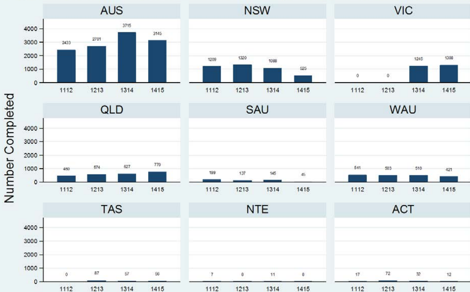
Figure 3.1.3.7.V: Older Persons - Inpatient - Discharge - MHLS

Data Extract - 06 March 2016; Analysis & Reporting - 12 March 2016