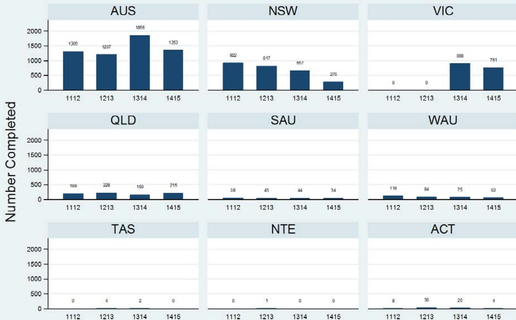
Figure 3.1.2.5.V: Older Persons - Inpatient - Review - Diagnosis

Data Extract - 06 March 2016; Analysis & Reporting - 12 March 2016