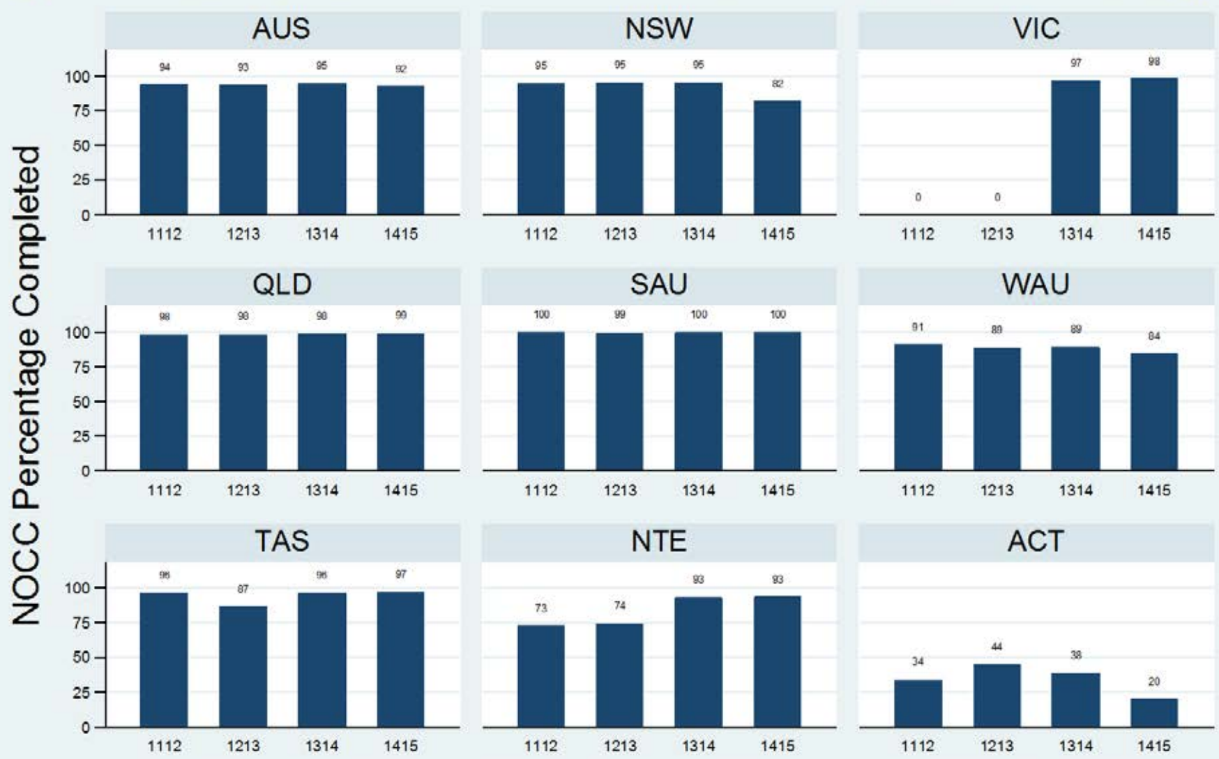
Figure 3.3.2.5.C: Older Persons - Ambulatory - Review - Diagnosis

Data Extract - 06 March 2016; Analysis & Reporting - 12 March 2016