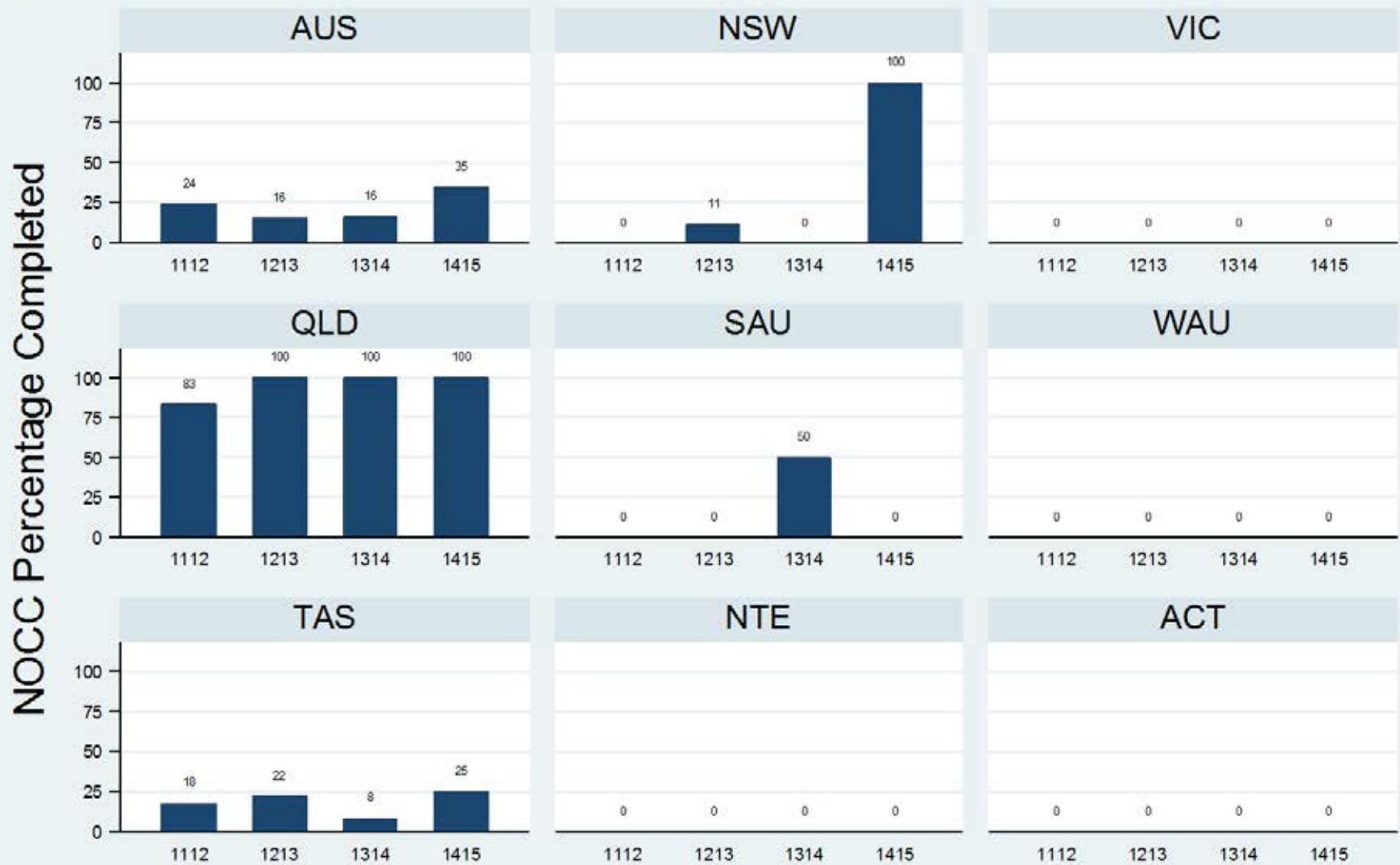
Figure 3.2.1.2.C: Older Persons - Residential - Admission - LSP-16

Data Extract - 06 March 2016; Analysis & Reporting - 12 March 2016