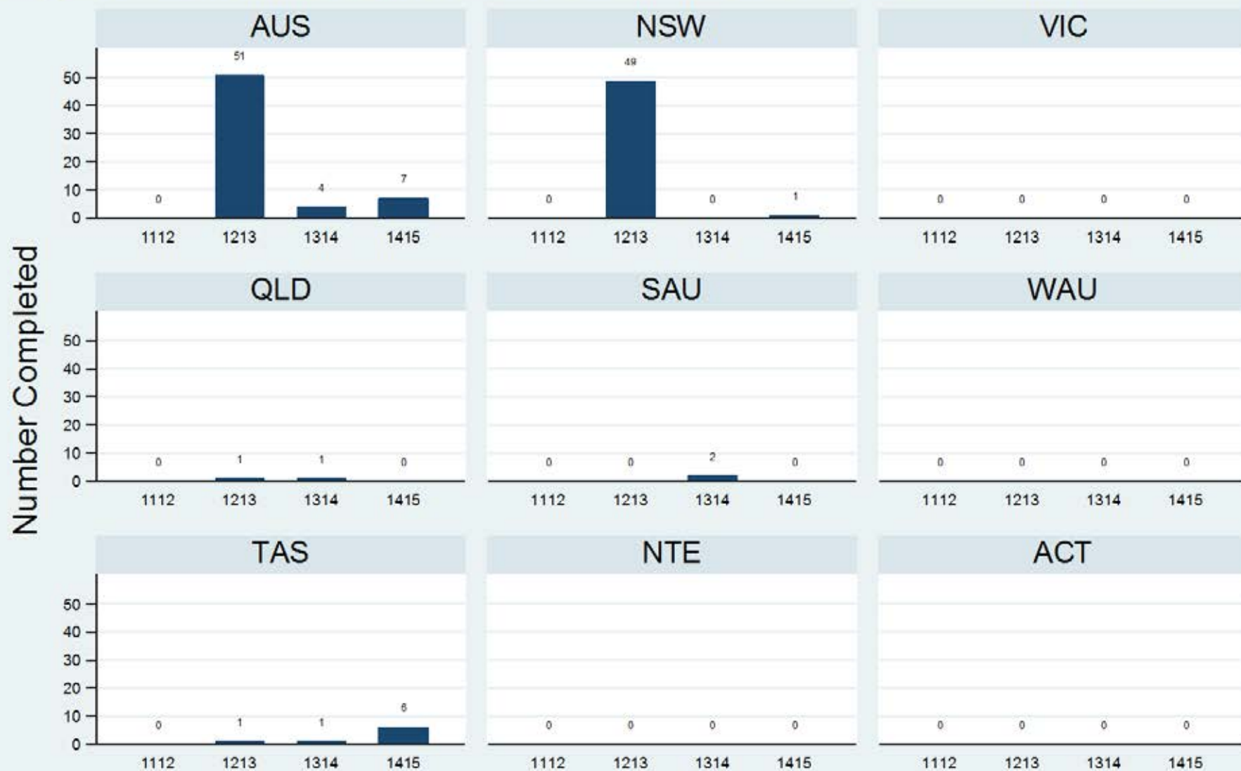
Figure 3.2.1.4.V: Older Persons - Residential - Admission - CSR

Data Extract - 06 March 2016; Analysis & Reporting - 12 March 2016