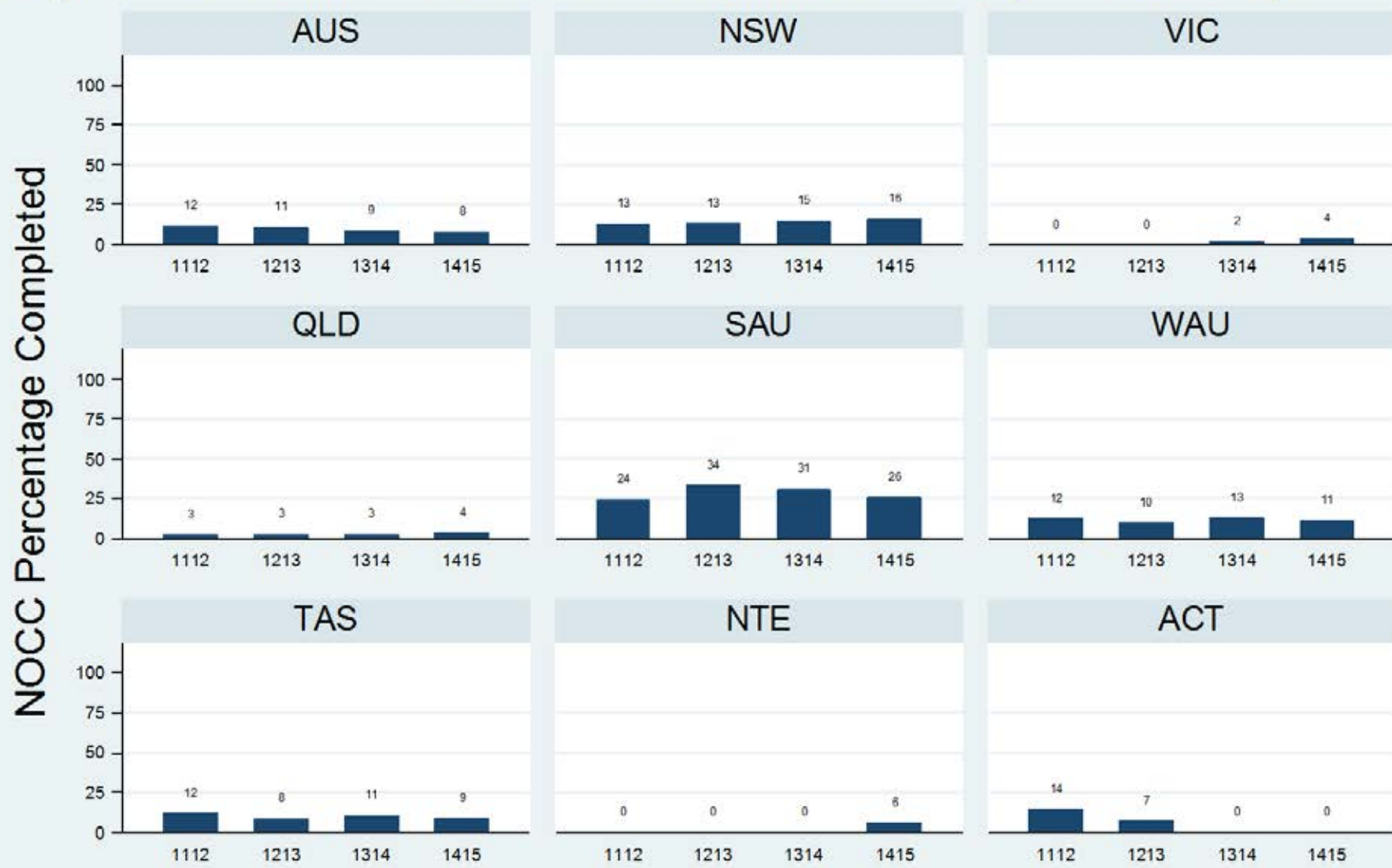
Figure 3.3.3.4.C: Older Persons - Ambulatory - Discharge - CSR

Data Extract - 06 March 2016; Analysis & Reporting - 12 March 2016