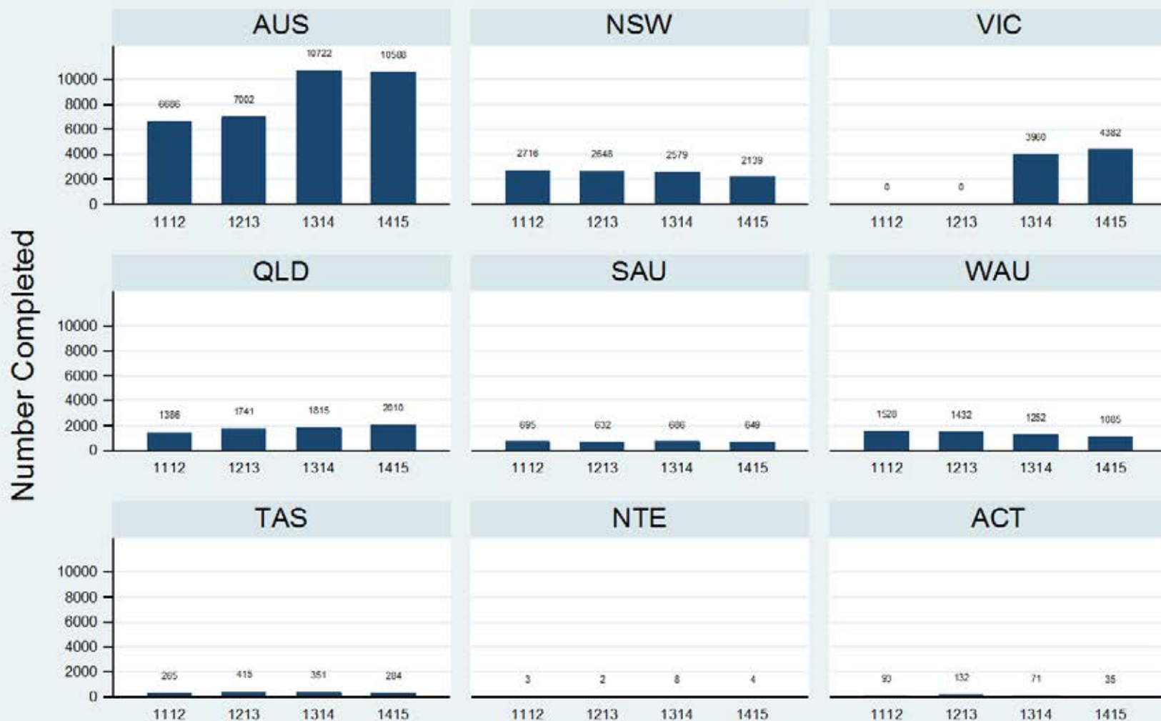
Figure 3.3.1.1.V: Older Persons - Ambulatory - Admission - HoNOS65+

Data Extract - 06 March 2016; Analysis & Reporting - 12 March 2016