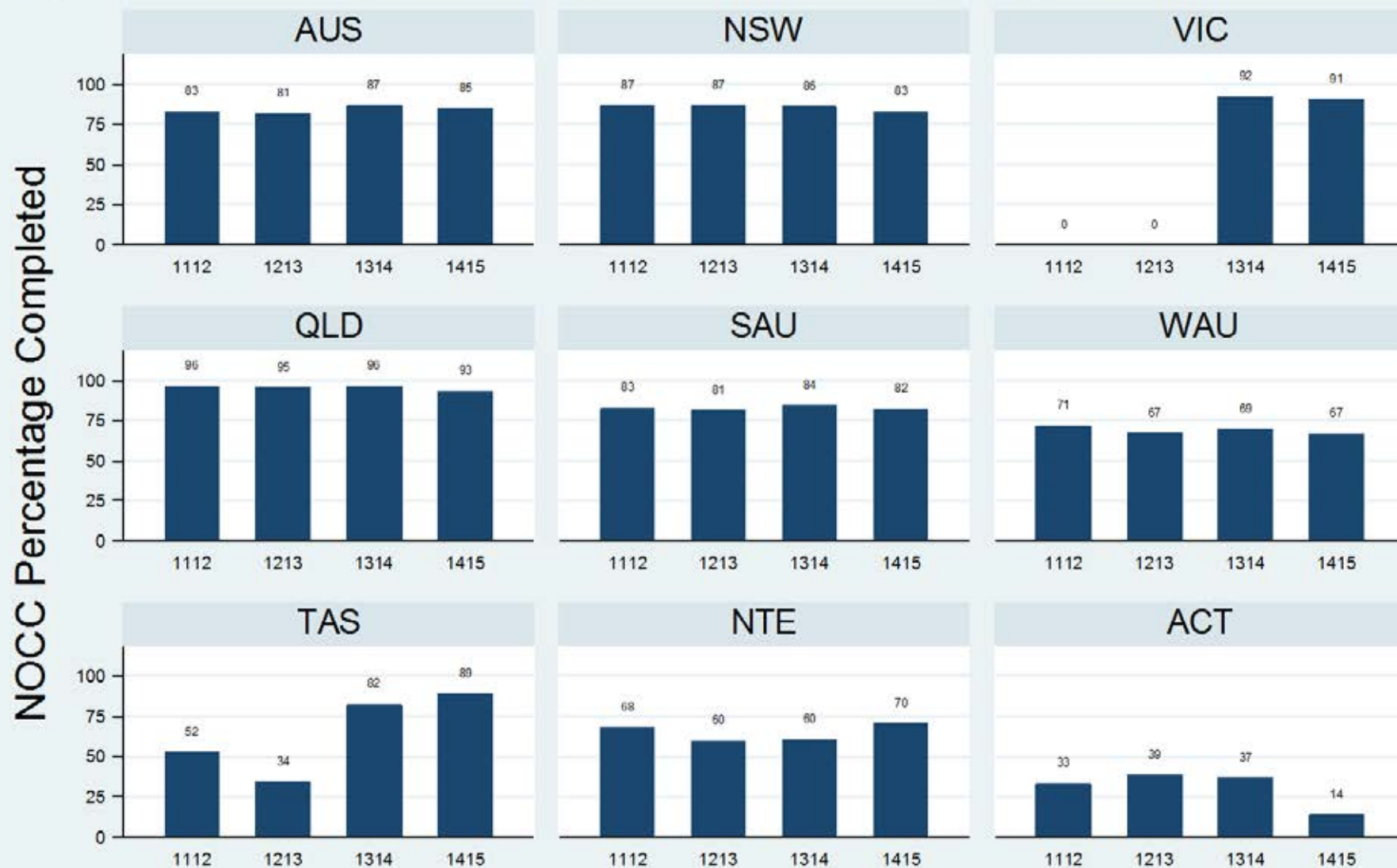
Figure 3.3.2.2.C: Older Persons - Ambulatory - Review - LSP-16

Data Extract - 06 March 2016; Analysis & Reporting - 12 March 2016