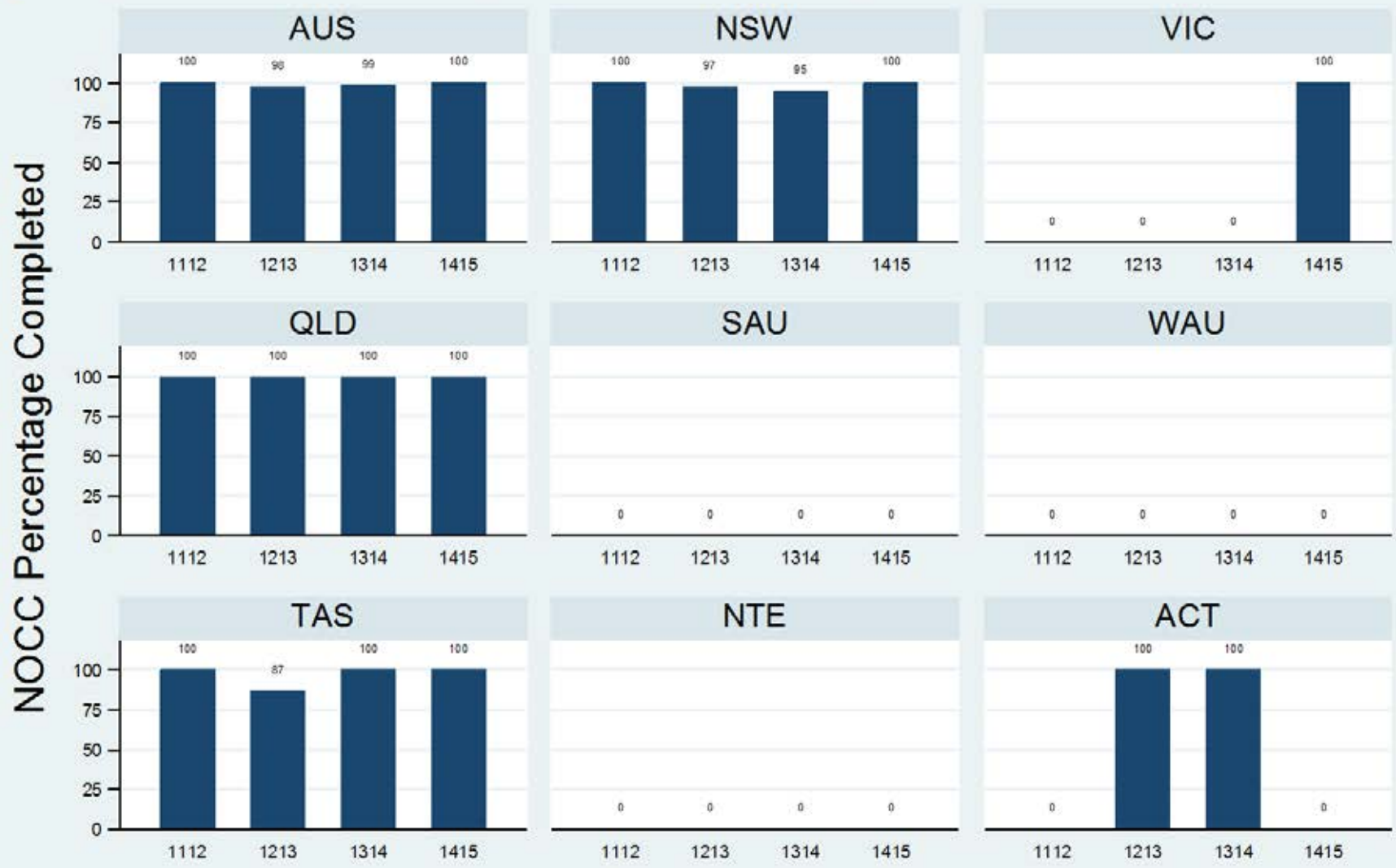
Figure 3.2.2.1.C: Older Persons - Residential - Review - HoNOS65+

Data Extract - 06 March 2016; Analysis & Reporting - 12 March 2016