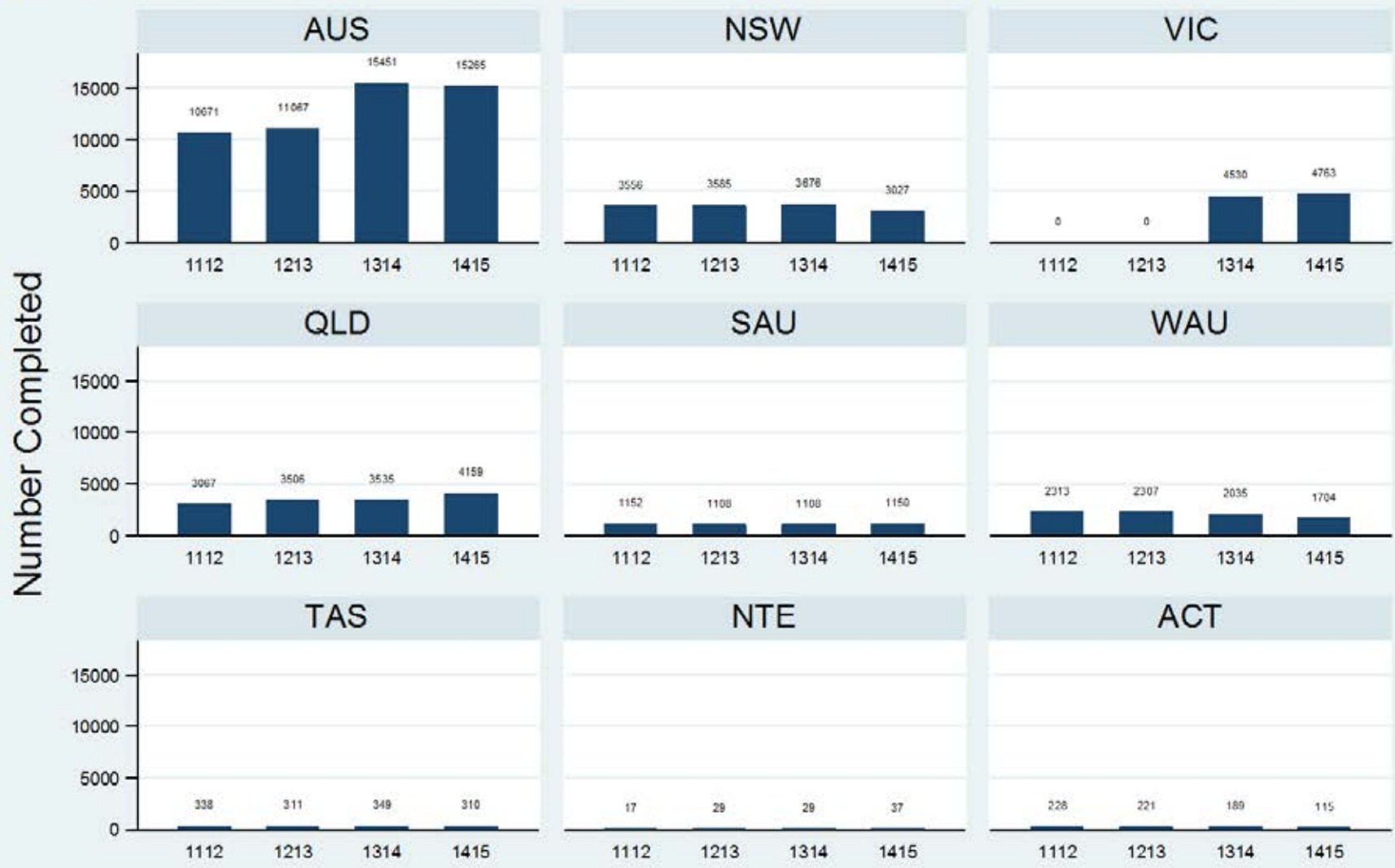
Figure 3.3.2.1.V: Older Persons - Ambulatory - Review - HoNOS65+

Data Extract - 06 March 2016; Analysis & Reporting - 12 March 2016