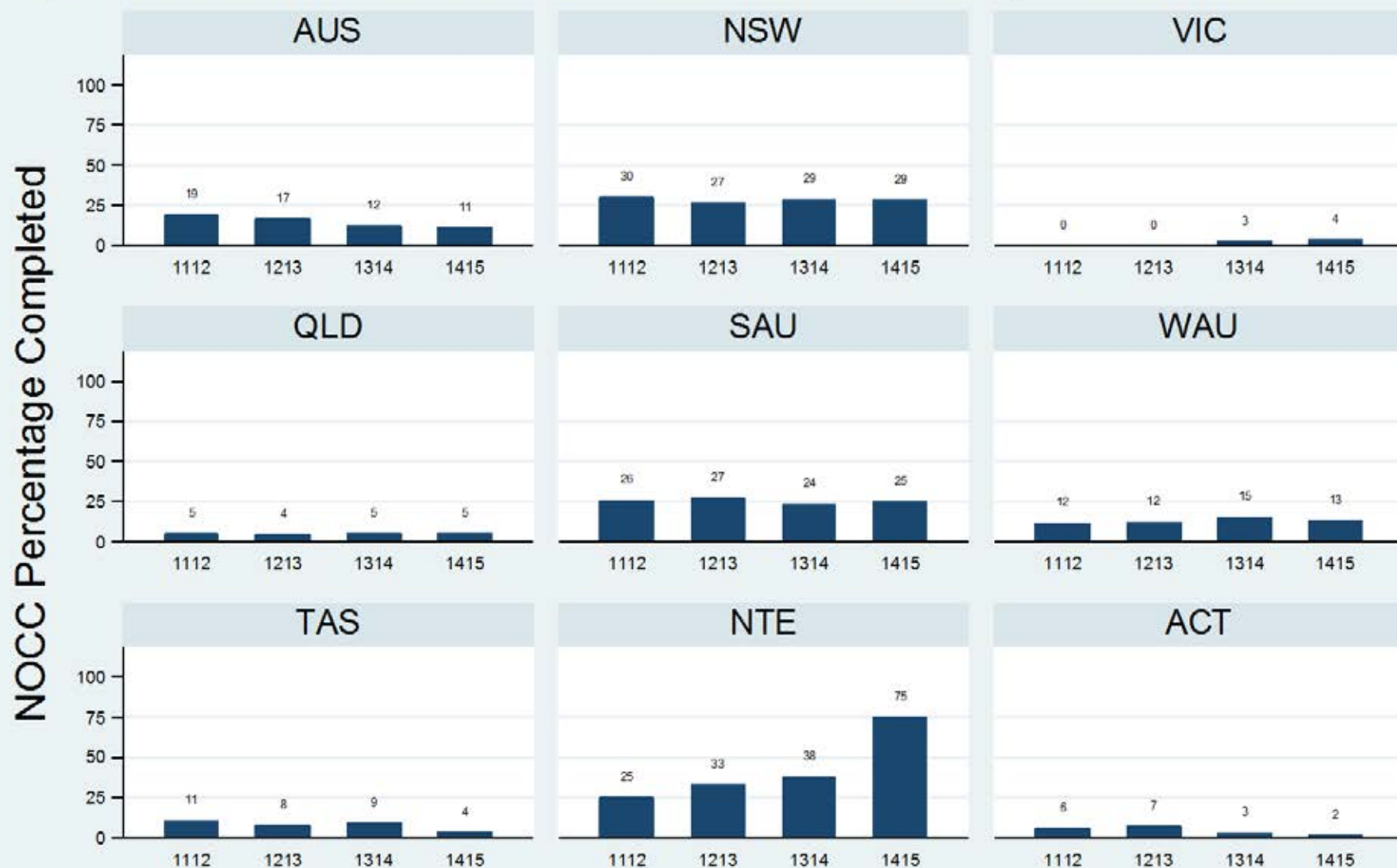
Figure 3.3.1.4.C: Older Persons - Ambulatory - Admission - CSR

Data Extract - 06 March 2016; Analysis & Reporting - 12 March 2016