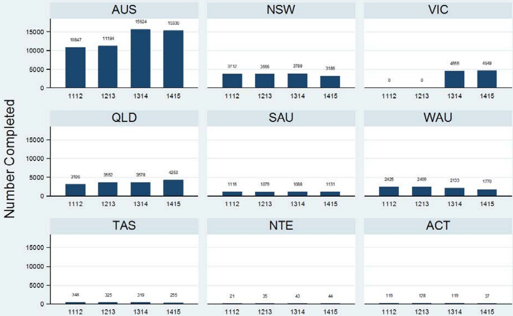
Figure 3.3.2.6.V: Older Persons - Ambulatory - Review - FOC

Data Extract - 06 March 2016; Analysis & Reporting - 12 March 2016