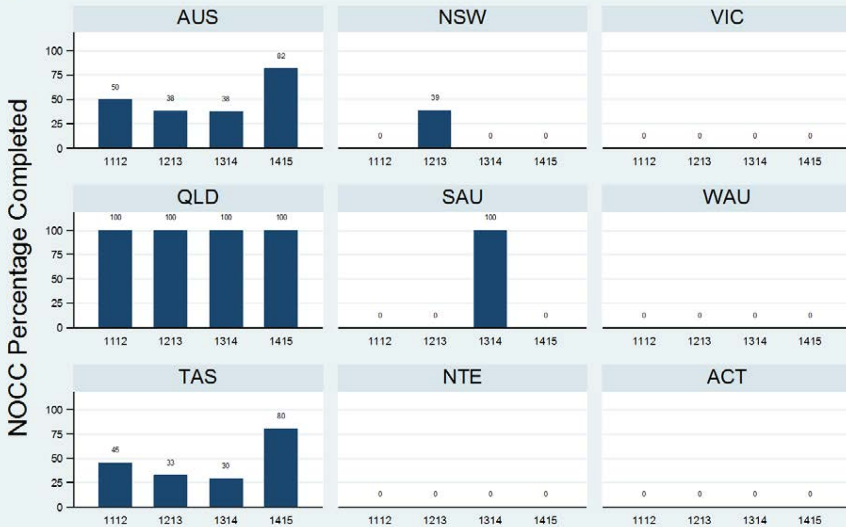
Figure 3.2.3.2.C: Older Persons - Residential - Discharge - LSP-16

Data Extract - 06 March 2016; Analysis & Reporting - 12 March 2016