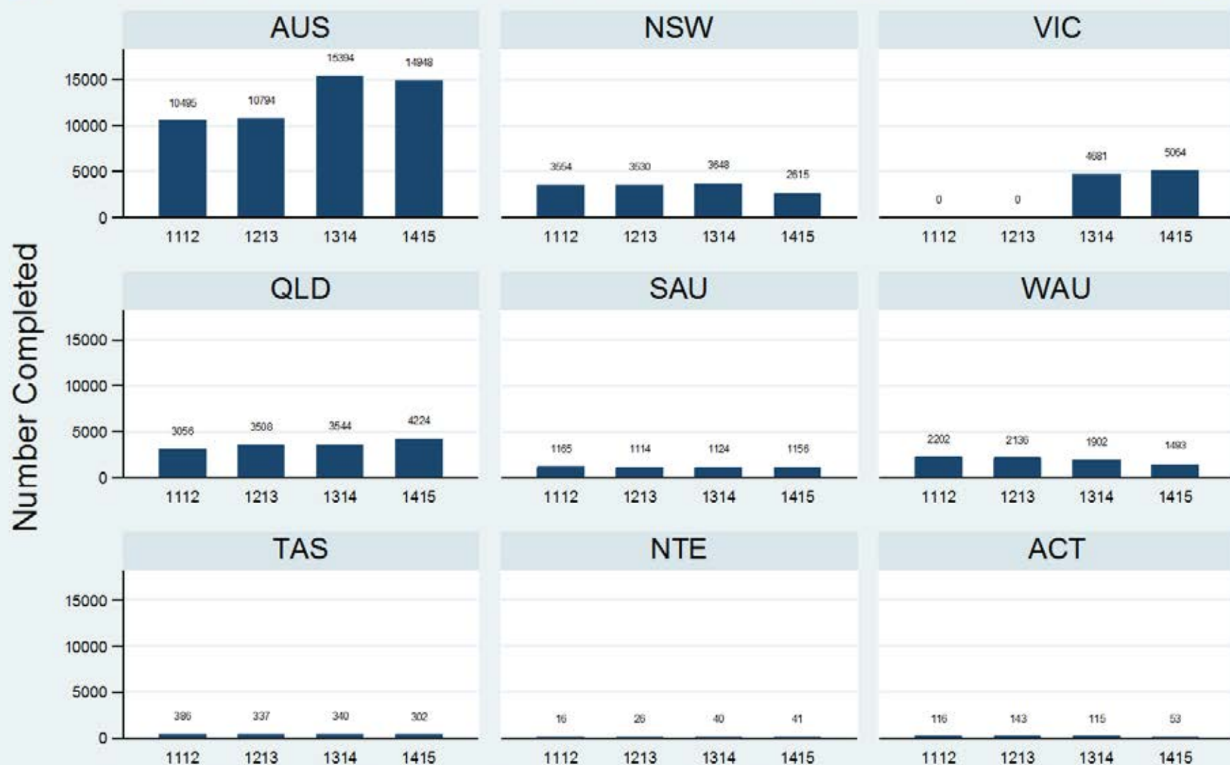
Figure 3.3.2.5.V: Older Persons - Ambulatory - Review - Diagnosis

Data Extract - 06 March 2016; Analysis & Reporting - 12 March 2016