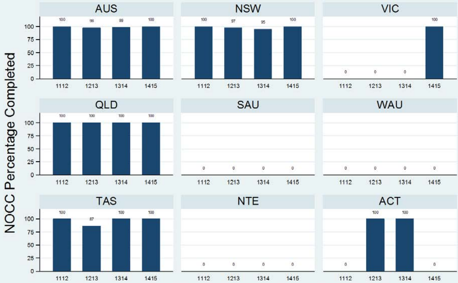
Figure 3.2.2.5.C: Older Persons - Residential - Review - Diagnosis

Data Extract - 06 March 2016; Analysis & Reporting - 12 March 2016