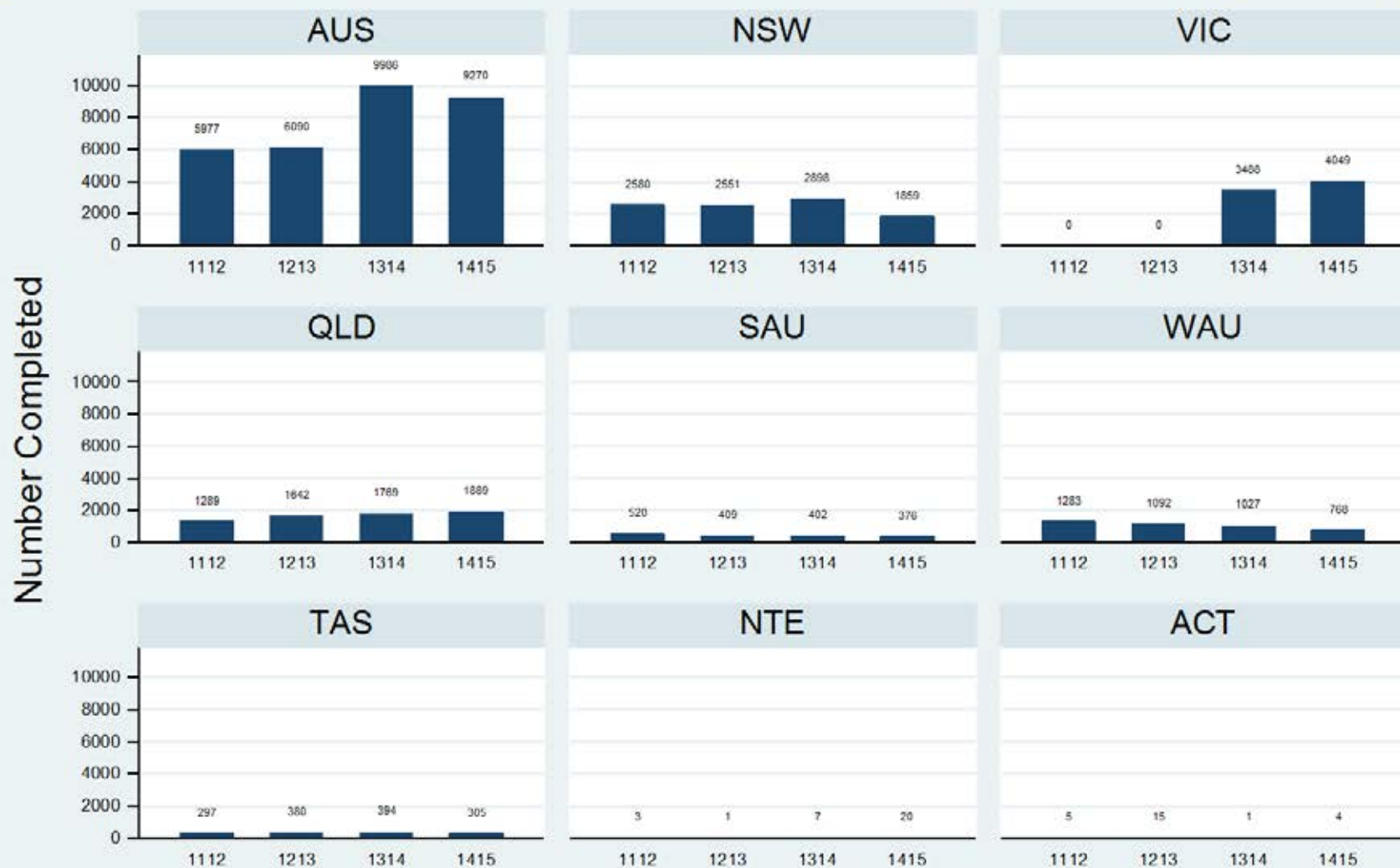
Figure 3.3.3.5.V: Older Persons - Ambulatory - Discharge - Diagnosis

Data Extract - 06 March 2016; Analysis & Reporting - 12 March 2016