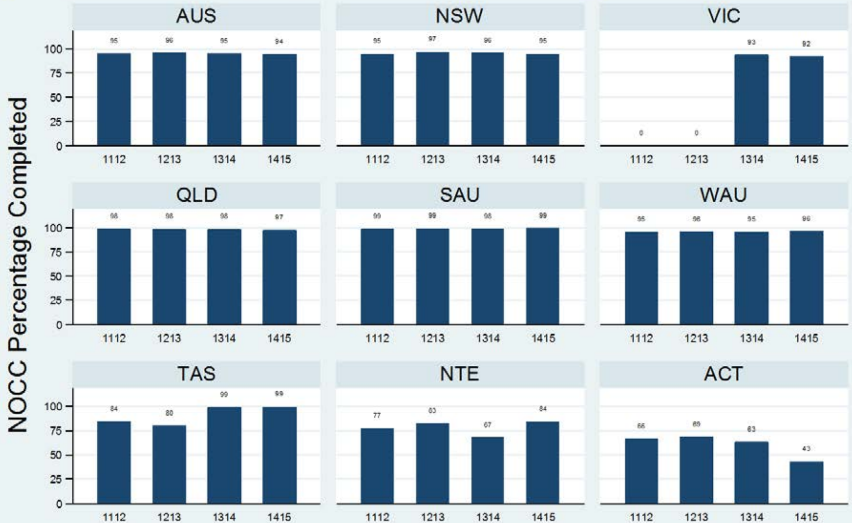
Figure 3.3.2.1.C: Older Persons - Ambulatory - Review - HoNOS65+

Data Extract - 06 March 2016; Analysis & Reporting - 12 March 2016