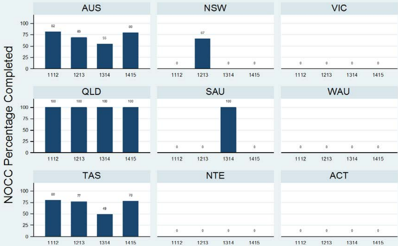
Figure 3.2.3.1.C: Older Persons - Residential - Discharge - HoNOS65+

Data Extract - 06 March 2016; Analysis & Reporting - 12 March 2016