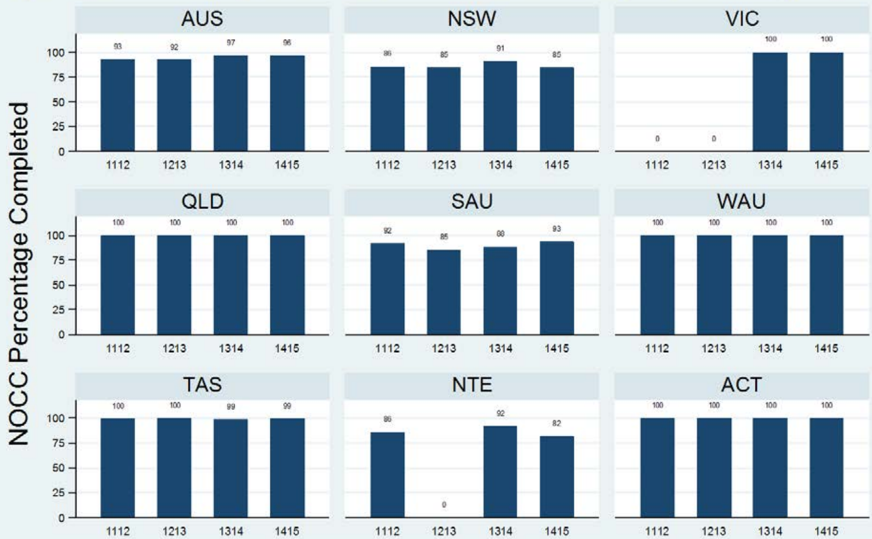
Figure 3.3.3.7.C: Older Persons - Ambulatory - Discharge - MHLS

Data Extract - 06 March 2016; Analysis & Reporting - 12 March 2016