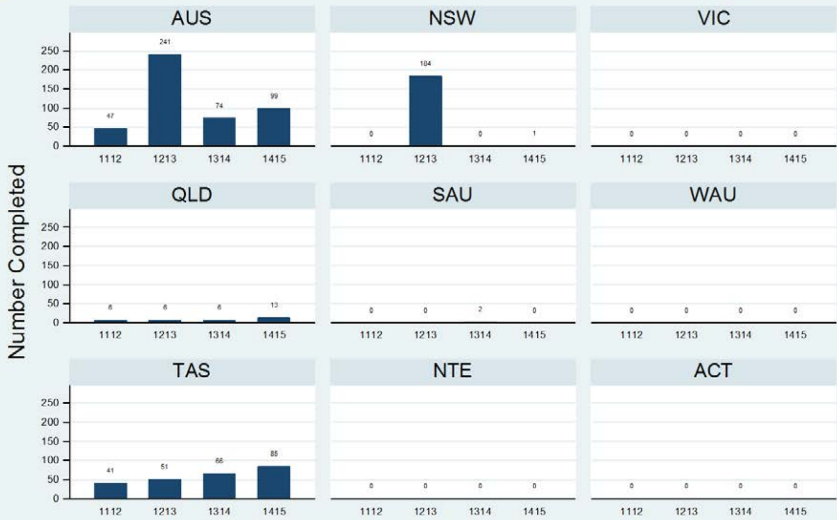
Figure 3.2.1.3.V: Older Persons - Residential - Discharge - RUG-ADL

Data Extract - 06 March 2016; Analysis & Reporting - 12 March 2016