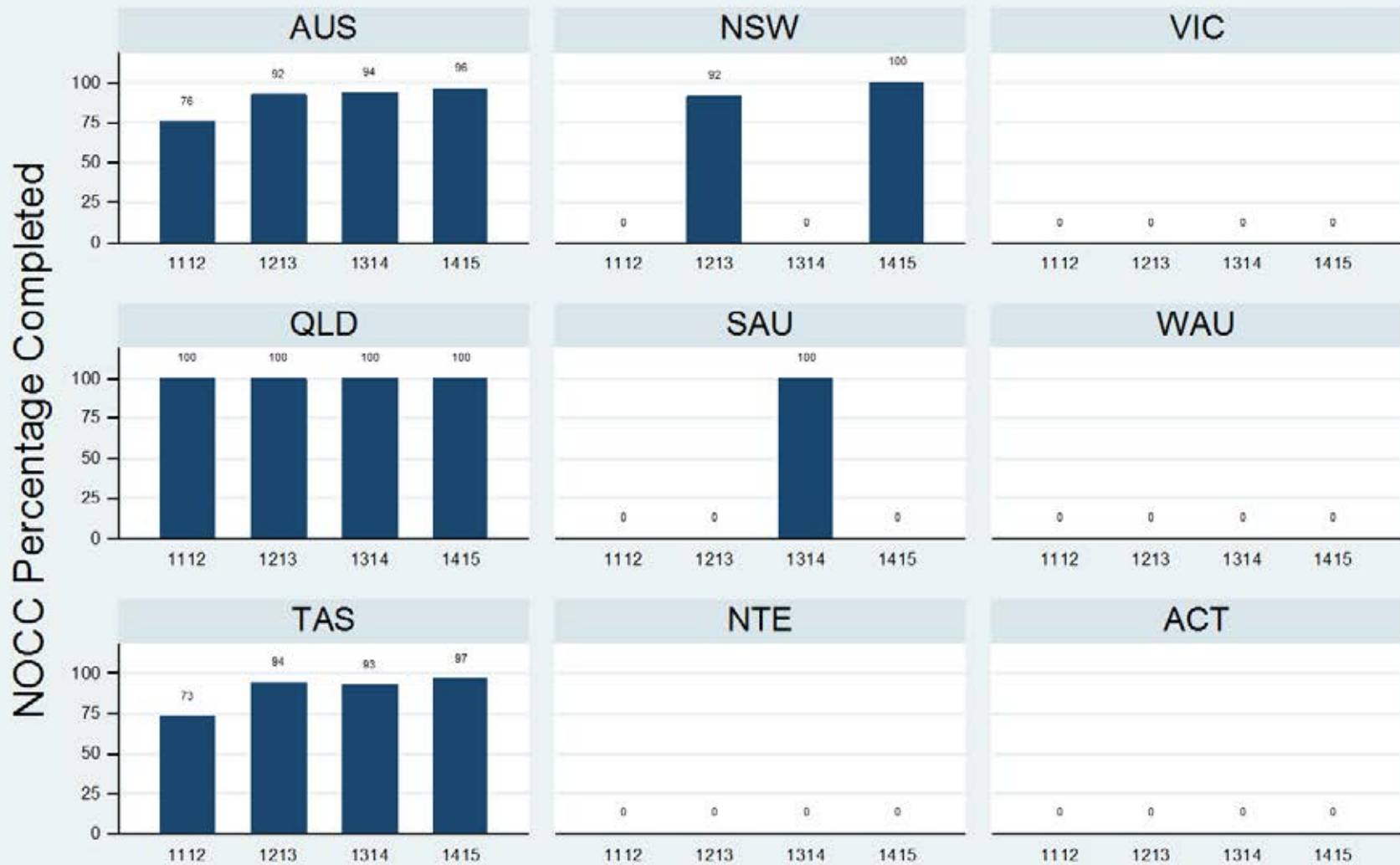
Figure 3.2.1.3.C: Older Persons - Residential - Discharge - RUG-ADL

Data Extract - 06 March 2016; Analysis & Reporting - 12 March 2016