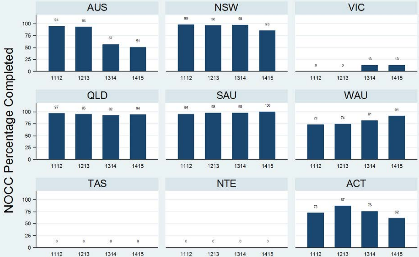
Figure 3.1.2.3.C: Older Persons - Inpatient - Review - RUG-ADL

Data Extract - 06 March 2016; Analysis & Reporting - 12 March 2016