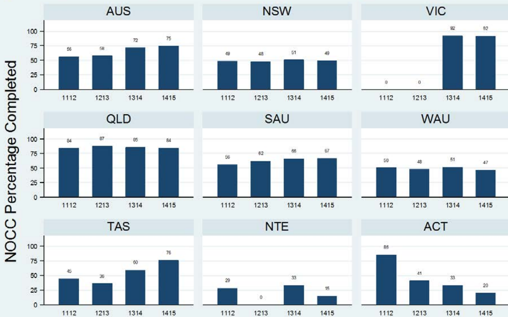
Figure 3.3.3.2.C: Older Persons - Ambulatory - Discharge - LSP-16

Data Extract - 06 March 2016; Analysis & Reporting - 12 March 2016