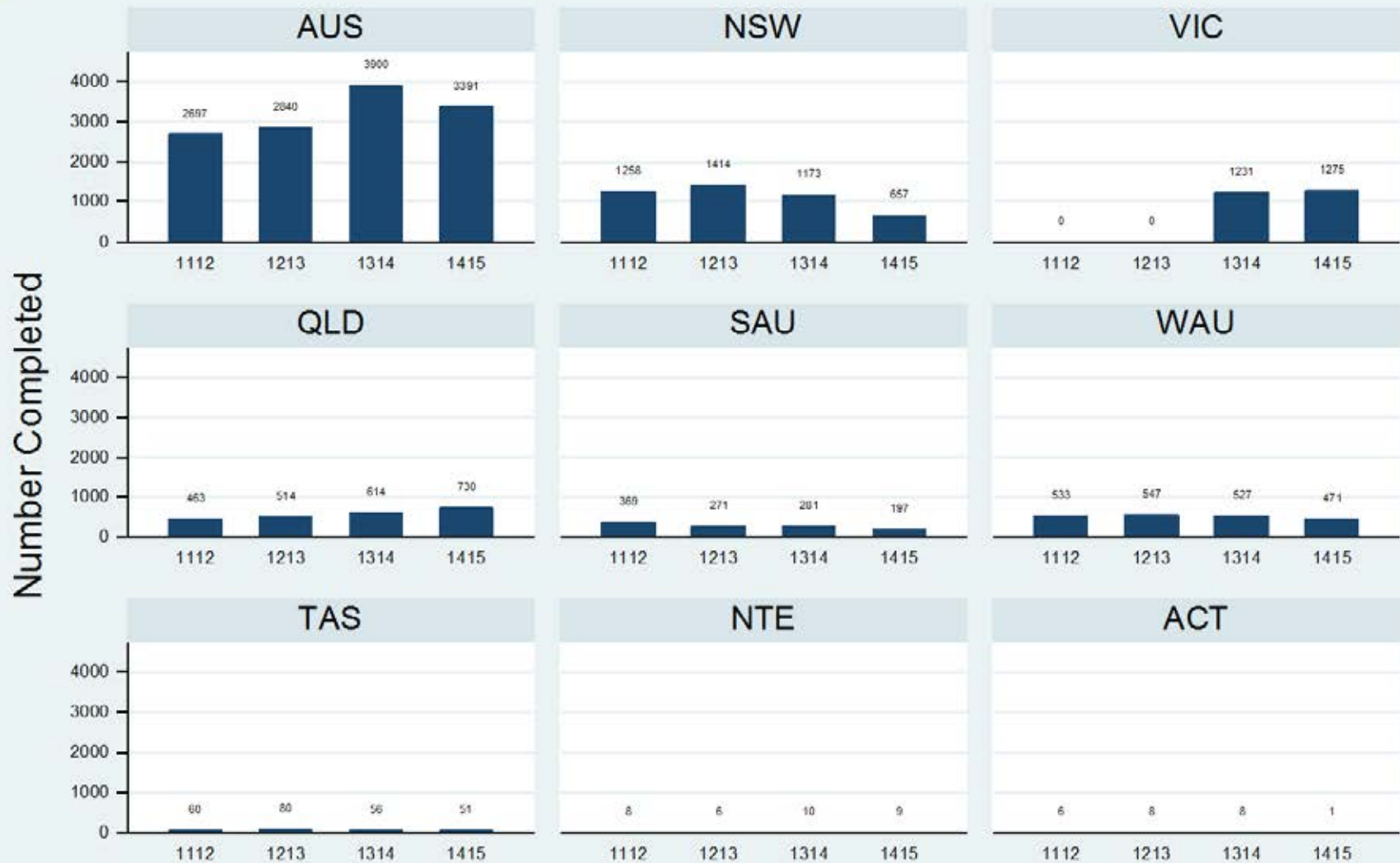
Figure 3.1.1.1.V: Older Persons - Inpatient - Admission - HoNOS65+

Data Extract - 06 March 2016; Analysis & Reporting - 12 March 2016