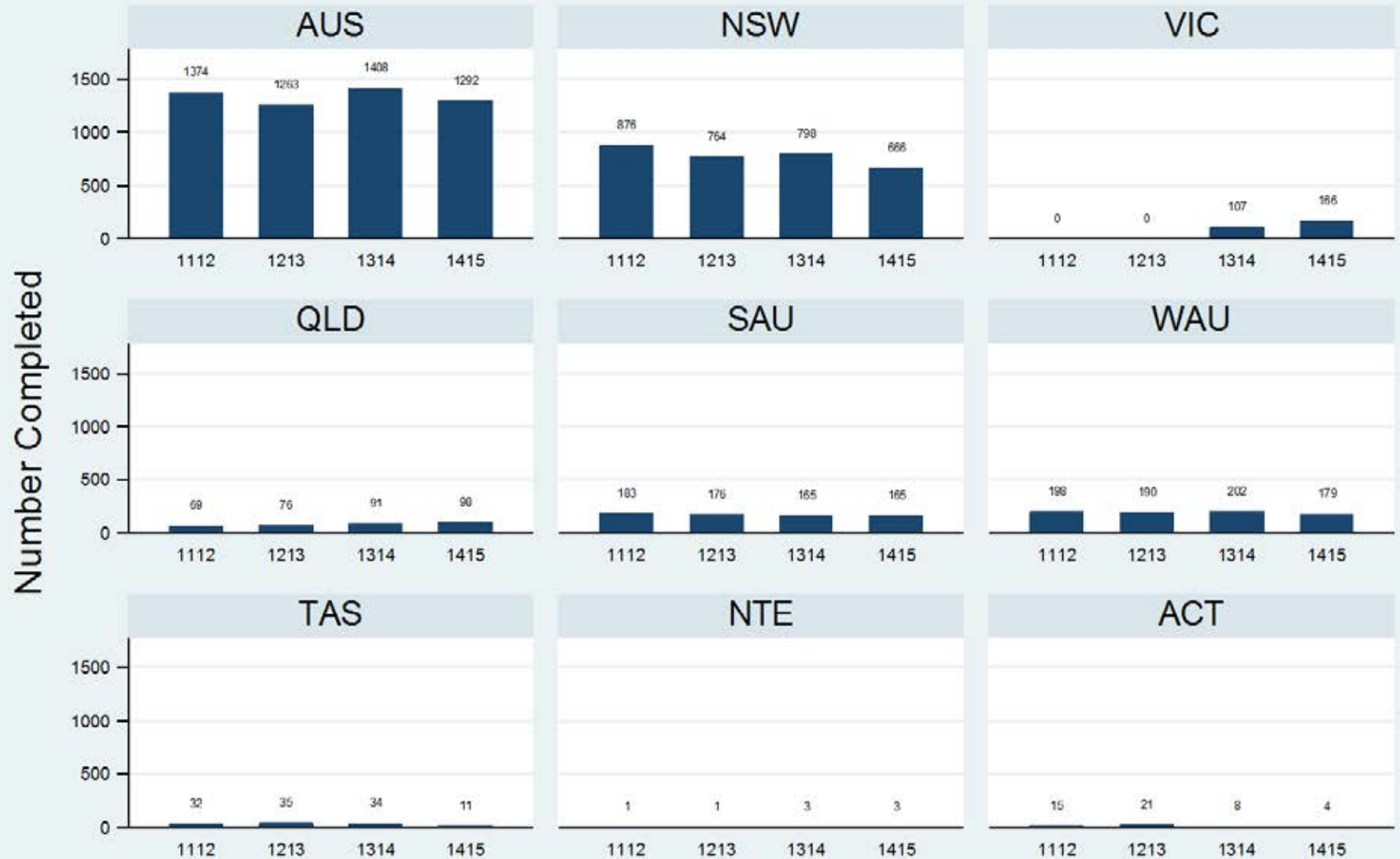
Figure 3.3.1.4.V: Older Persons - Ambulatory - Admission - CSR

Data Extract - 06 March 2016; Analysis & Reporting - 12 March 2016