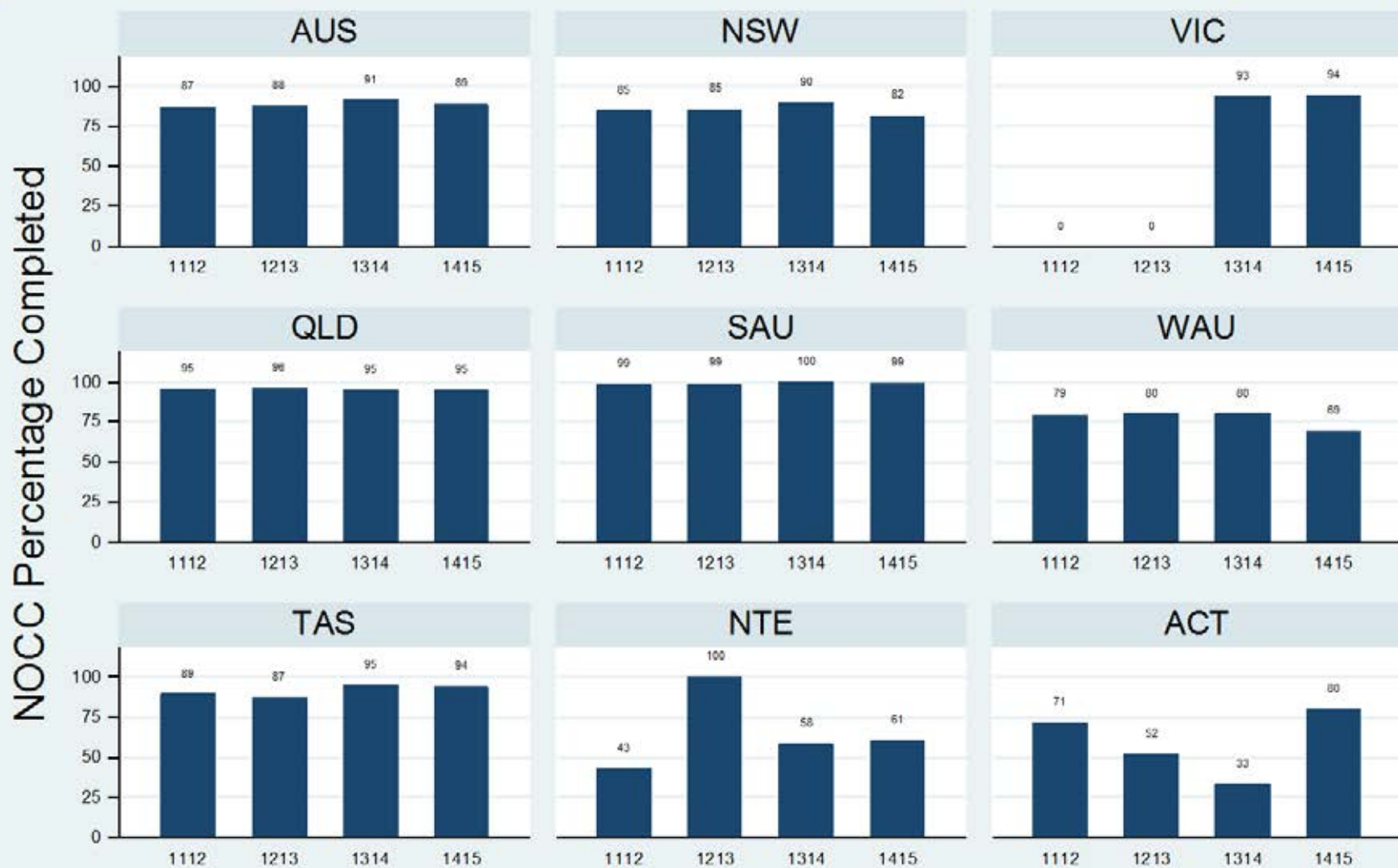
Figure 3.3.3.5.C: Older Persons - Ambulatory - Discharge - Diagnosis

Data Extract - 06 March 2016; Analysis & Reporting - 12 March 2016