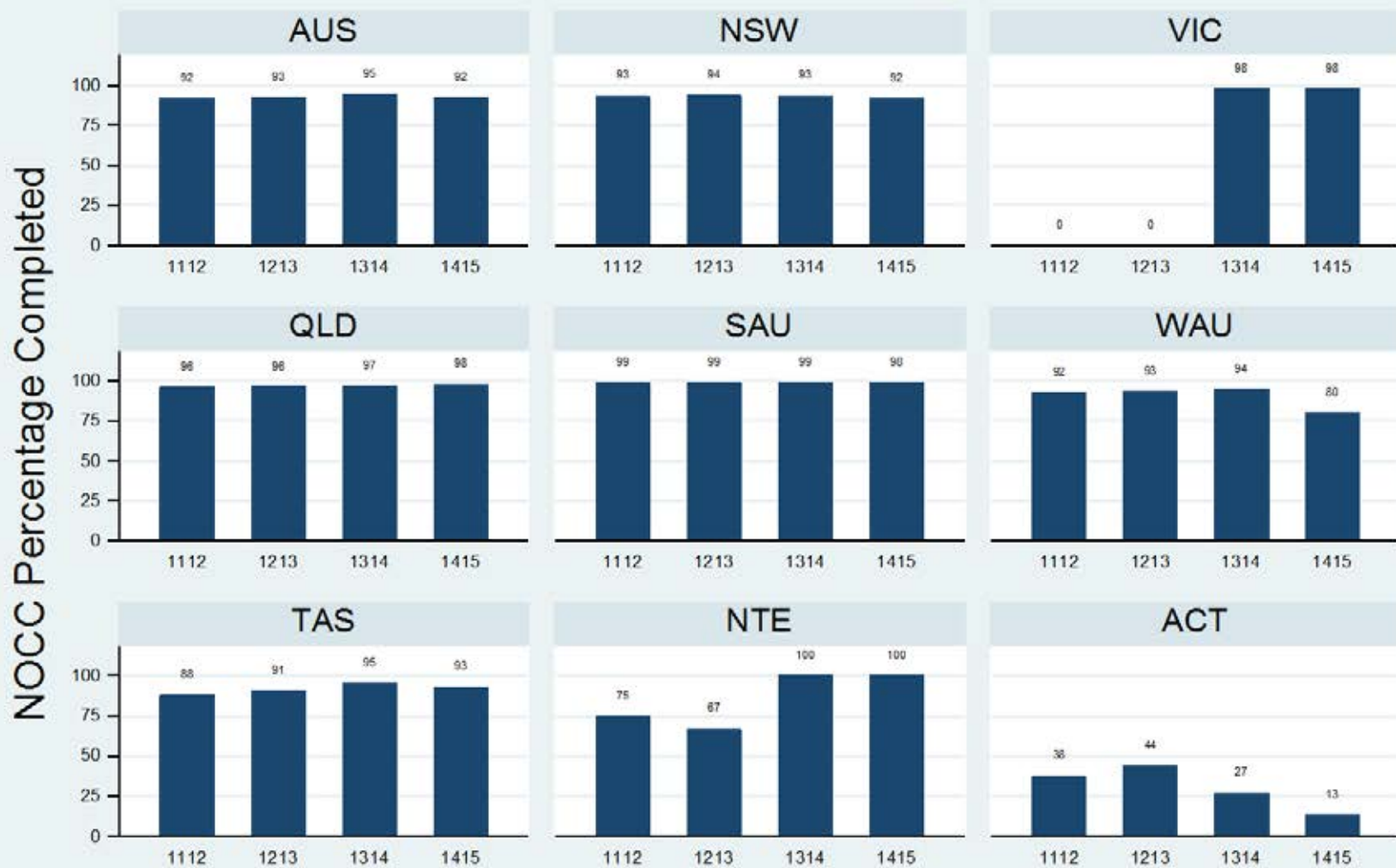
Figure 3.3.1.1.C: Older Persons - Ambulatory - Admission - HoNOS65+

Data Extract - 06 March 2016; Analysis & Reporting - 12 March 2016