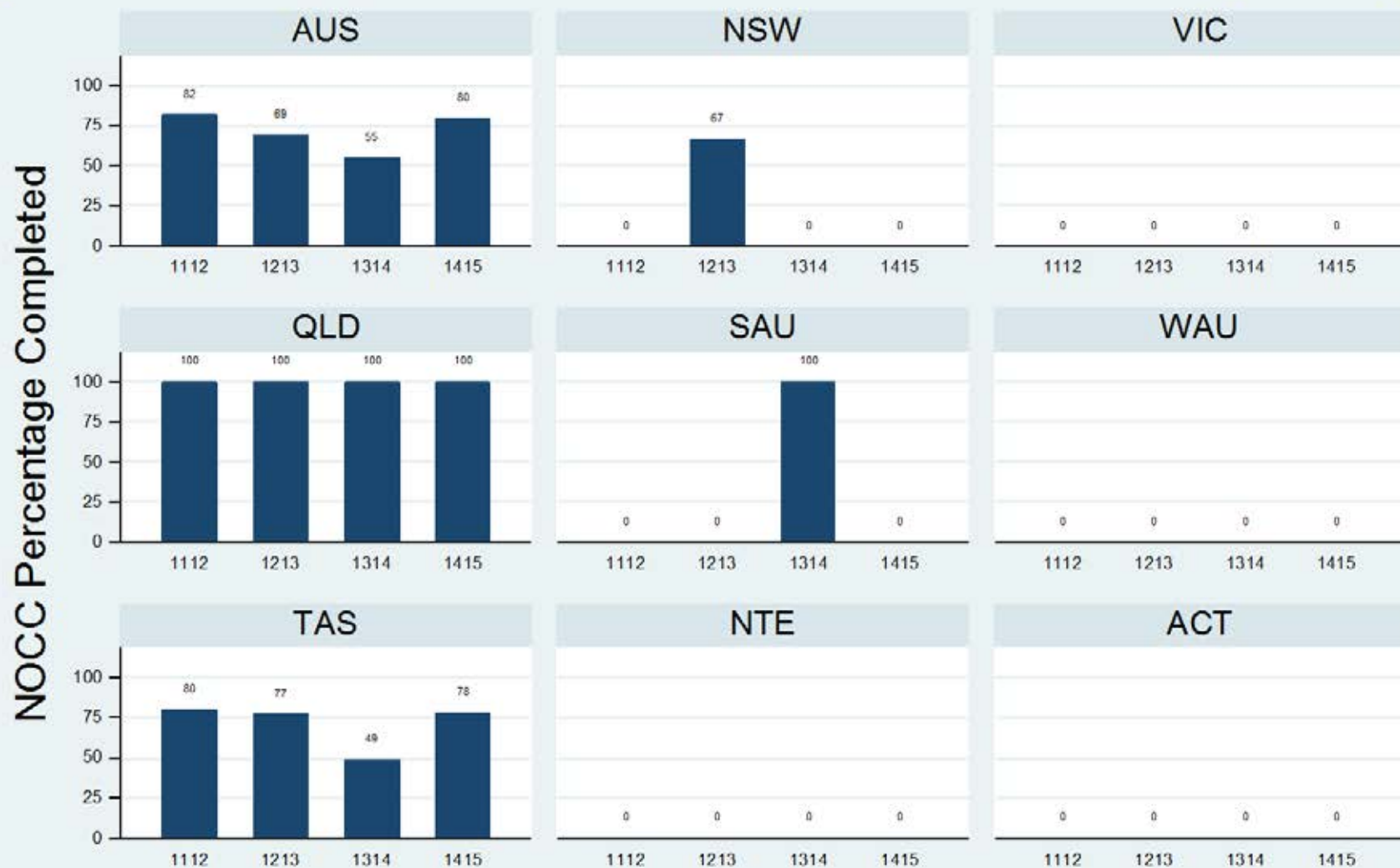
Figure 3.2.3.5.C: Older Persons - Residential - Discharge - Diagnosis

Data Extract - 06 March 2016; Analysis & Reporting - 12 March 2016