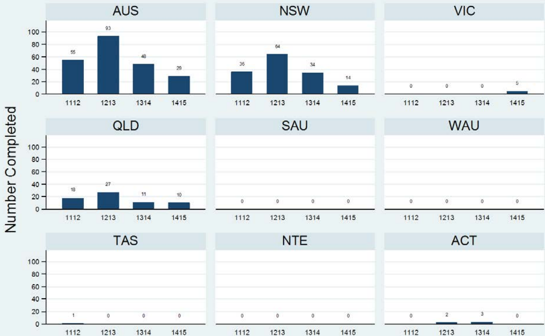
Figure 3.2.2.4.V: Older Persons - Residential - Review - CSR

Data Extract - 06 March 2016; Analysis & Reporting - 12 March 2016