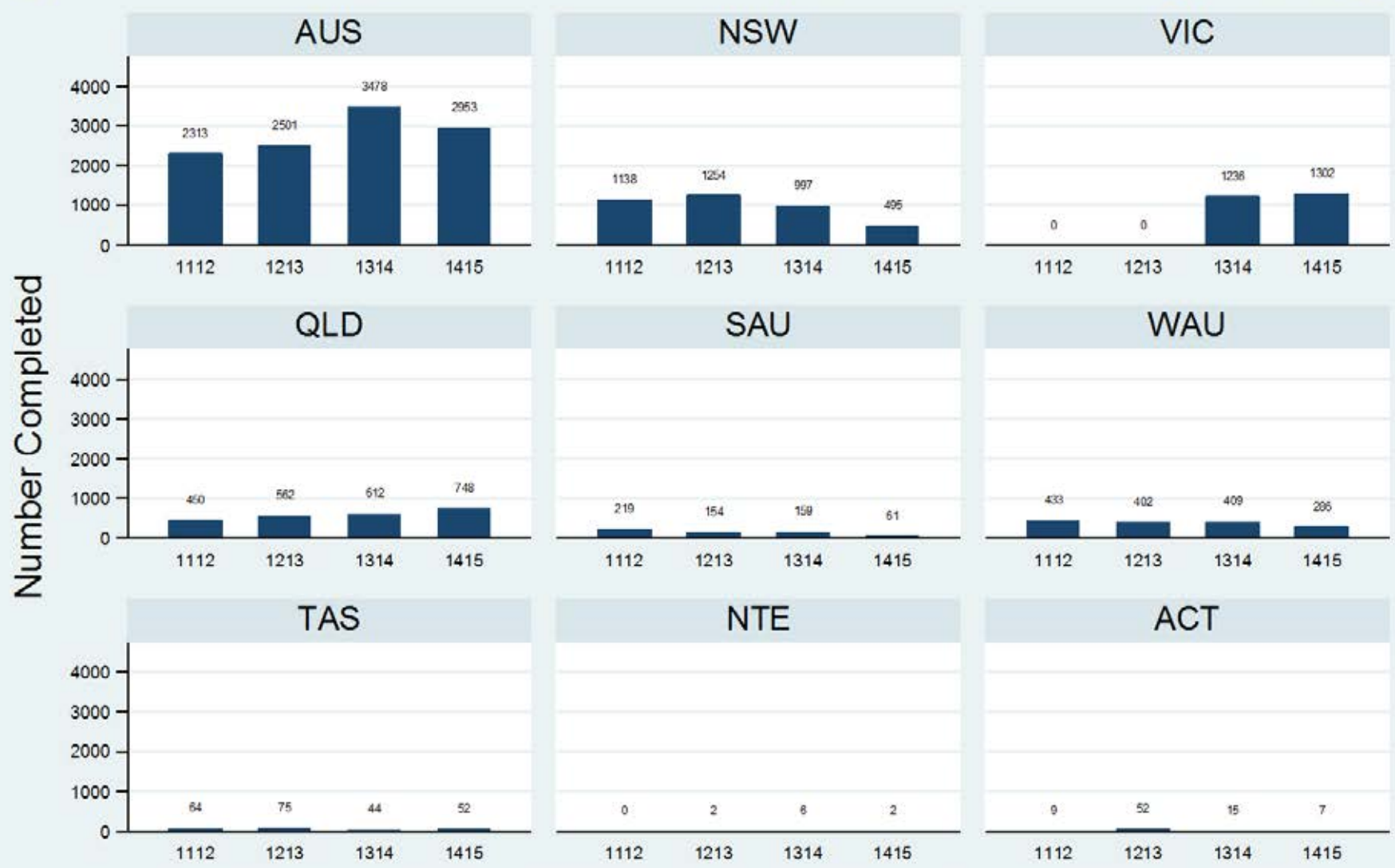
Figure 3.1.3.5.V: Older Persons - Inpatient - Discharge - Diagnosis

Data Extract - 06 March 2016; Analysis & Reporting - 12 March 2016