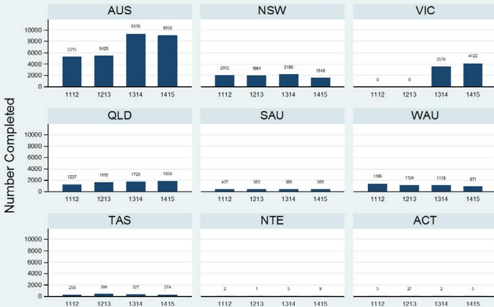
Figure 3.3.3.1.V: Older Persons - Ambulatory - Discharge - HoNOS65+

Data Extract - 06 March 2016; Analysis & Reporting - 12 March 2016