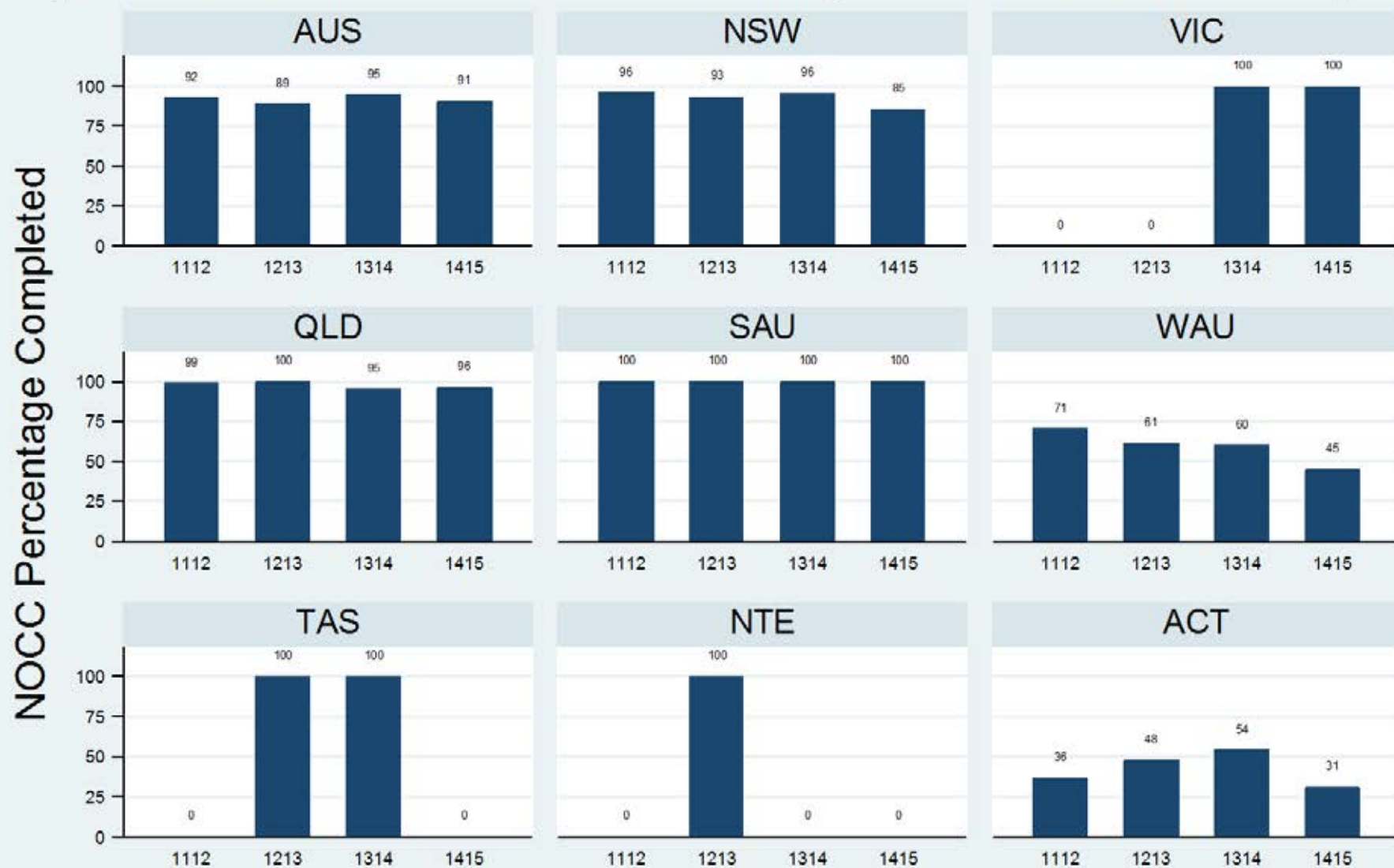
Figure 3.1.2.5.C: Older Persons - Inpatient - Review - Diagnosis

Data Extract - 06 March 2016; Analysis & Reporting - 12 March 2016