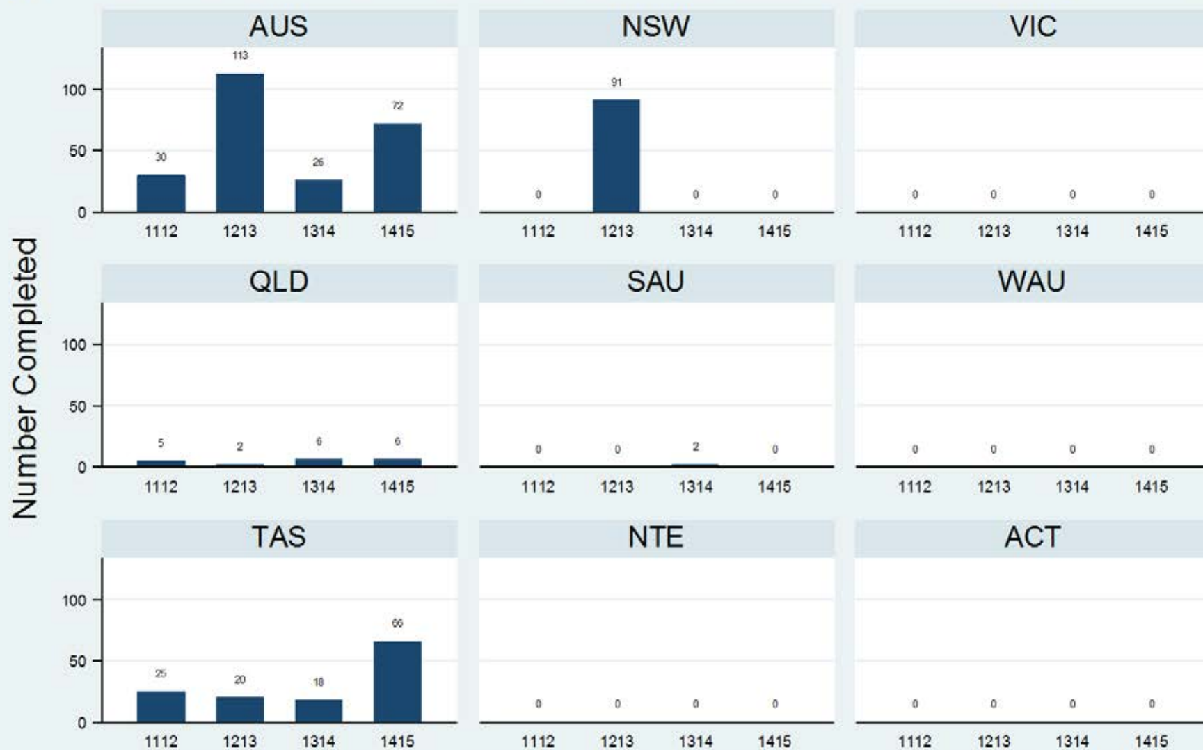
Figure 3.2.3.2.V: Older Persons - Residential - Discharge - LSP-16

Data Extract - 06 March 2016; Analysis & Reporting - 12 March 2016