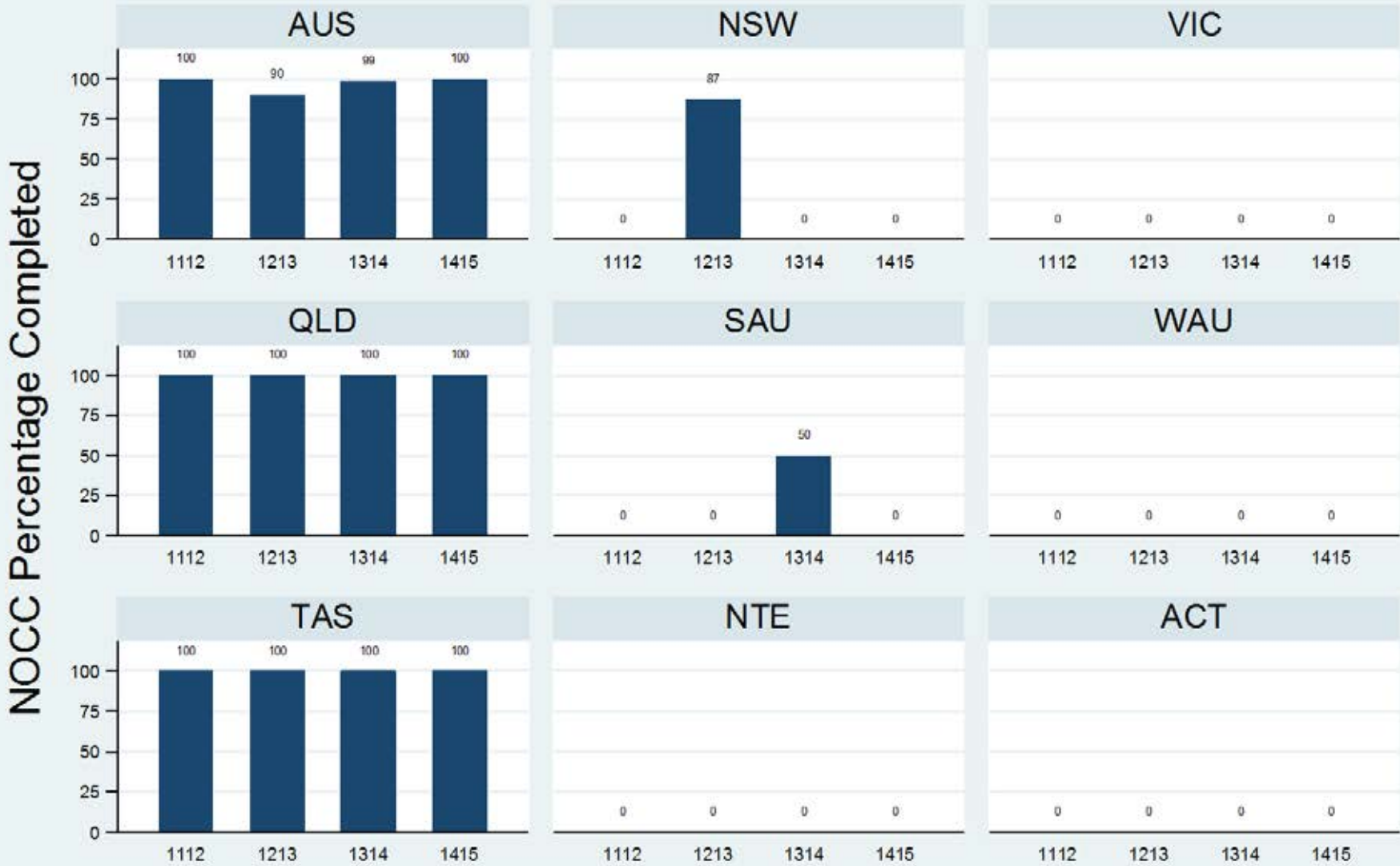
Figure 3.2.3.7.C: Older Persons - Residential - Discharge - MHLS

Data Extract - 06 March 2016; Analysis & Reporting - 12 March 2016