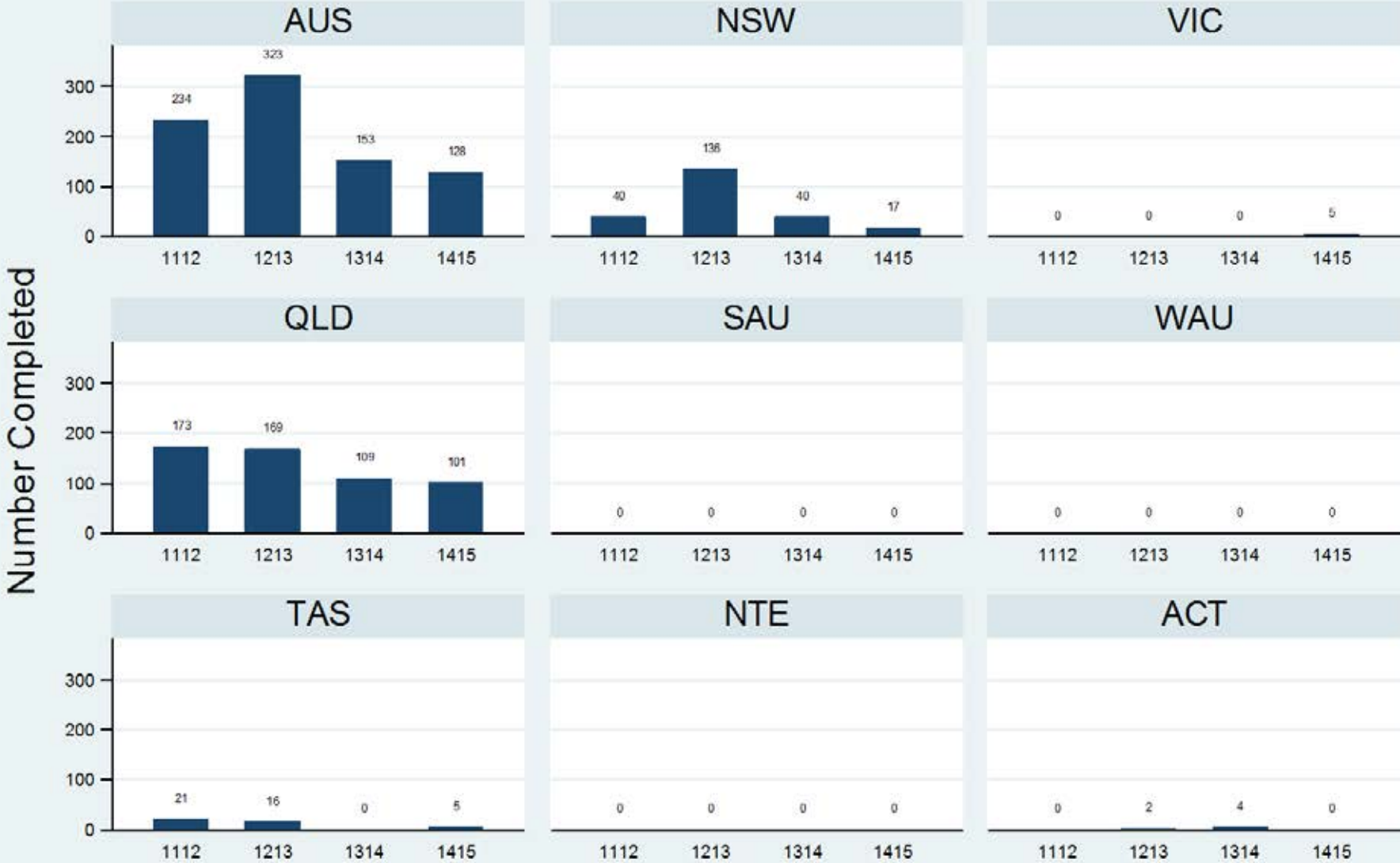
Figure 3.2.2.2.V: Older Persons - Residential - Review - LSP-16

Data Extract - 06 March 2016; Analysis & Reporting - 12 March 2016