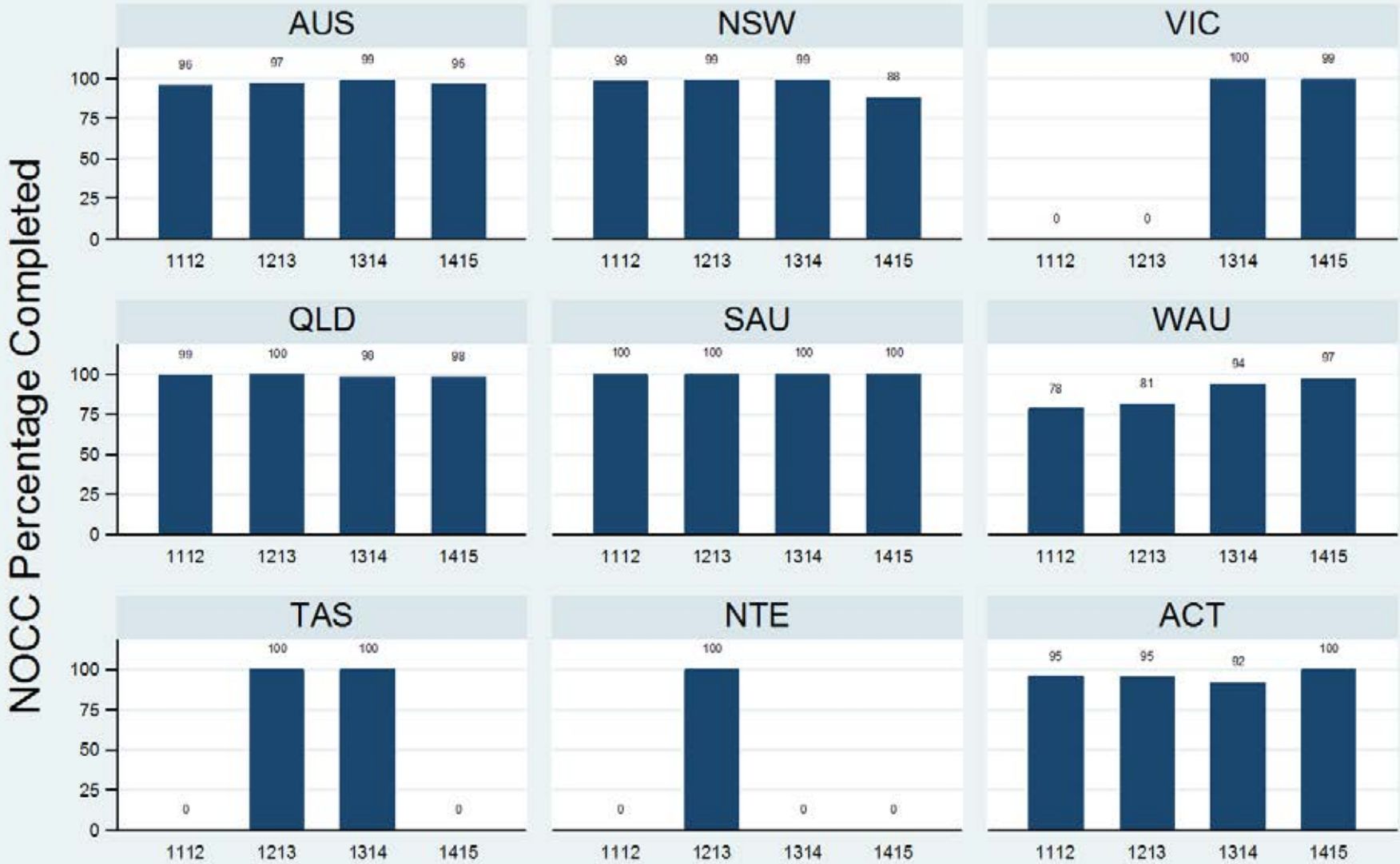
Figure 3.1.2.1.C: Older Persons - Inpatient - Review - HoNOS65+

Data Extract - 06 March 2016; Analysis & Reporting - 12 March 2016